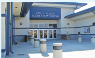
Quail Valley Elementary School