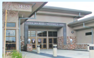
Herk Bouris Elementary School