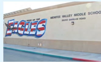
Menifee Valley Middle School