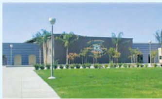
Bell Mountain Middle School