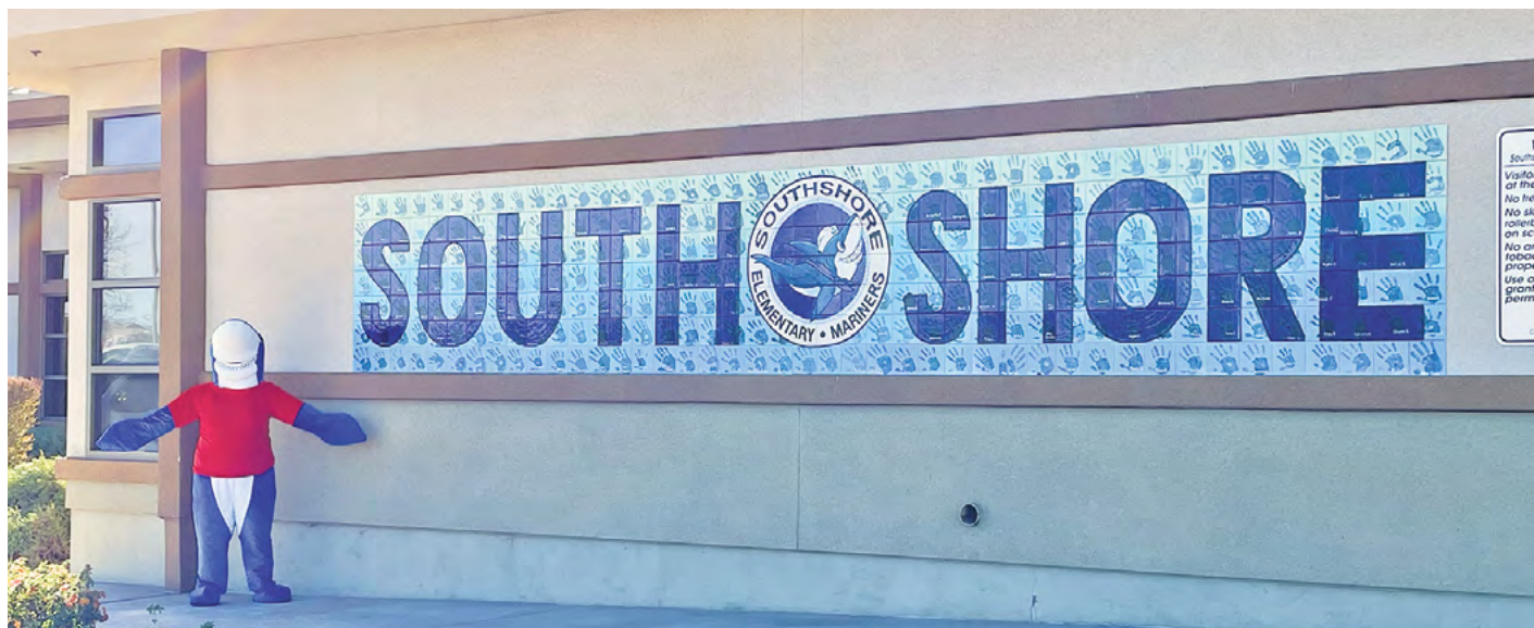
Fin, more than a mascot at Southshore!