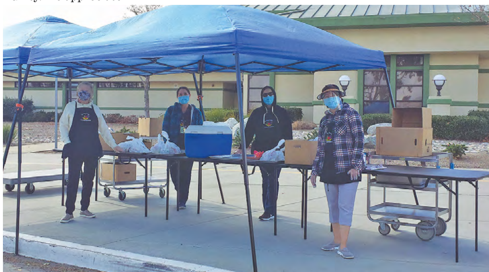
Nutrition Services staff is ready to serve meals via curbside pick-up at all MUSD school sites.

We encourage you to visit us here for more information. We hope to see you soon!