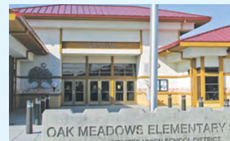
Oak Meadows Elementary School