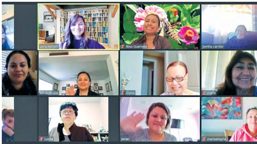
The Family Engagement Center continues to offer Community Classes virtually.

The Center offers a variety of classes throughout the year so that the community can receive support, and the knowledge they seek to support student growth and success.