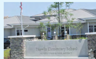
Táawila Elementary School