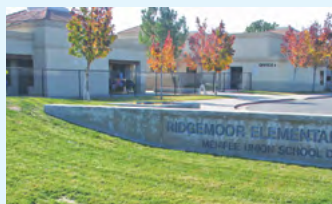
Ridgemoor Elementary School