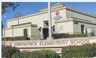
Callie Kirkpatrick Elementary School