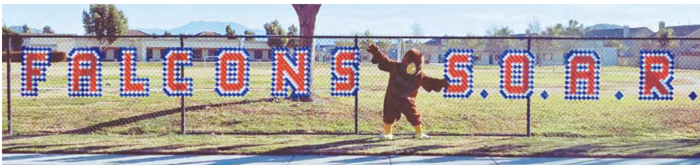
Freddie the Falcon, our Freedom Crest Elementary School mascot, is posing by our new sign purchased by the wonderful FCE PTO. The sign reminds students, staff, and community members to represent Freedom Crest by being Safe, Organized, Accountable, and Respectful (S.O.A.R.).

At Freedom Crest, we always aspire to S.O.A.R.—we are Safe, Organized, Accountable and Respectful!