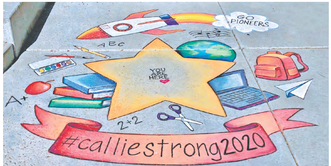
Everyone's a Star at Callie: #Calliestrong

leadership skills, and create innovative programs with community-service opportunities. Callie Mentors and Not Mean, Just Green are two student-created service-oriented programs that have been implemented this school year. Side by side with our PTA, we support our families with engaging activities and events throughout the year.