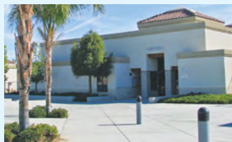
Freedom Crest Elementary School