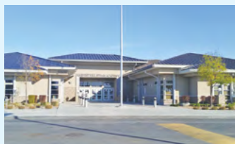
Harvest Hill STEAM Academy