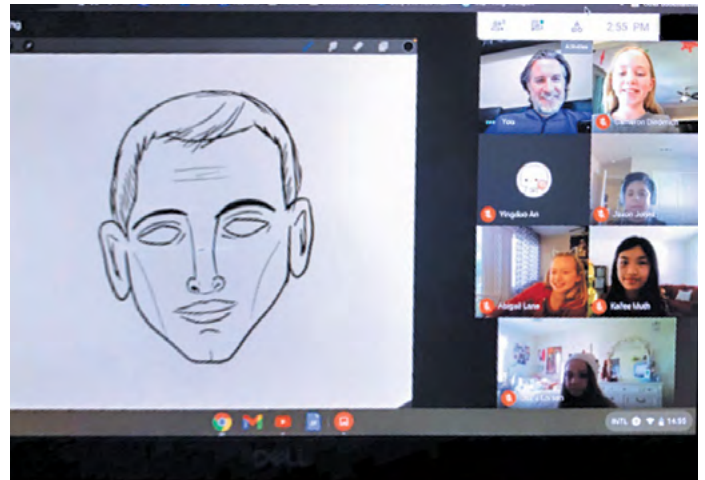
Mr. Martin's Career Exploration Academy

During the art sessions, students explored the facial proportions of the human face. They looked at different methods for sketching out the features of the face. Each student also chose to use the Loomis method to sketch out their face. During the second meeting, the students used clay and their sketches to create a 3D model of their face.