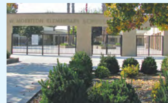
Chester W. Morrison Elementary School