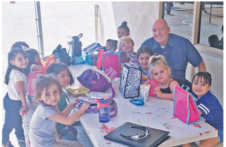
Mayor Bill Zimmerman interacts with Menifee students (Photo taken prior to COVID.)

In July 2020, the City of Menifee took a bold step forward in creating its own municipal police department. With public safety being the City's top priority, Menifee's city council members encouraged police Chief Pat Walsh's officers to maintain diligent traffic patrols around school