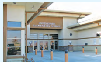
Southshore Elementary School