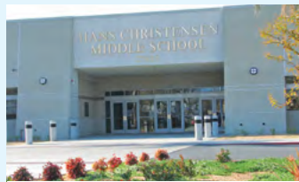
Hans Christensen Middle School