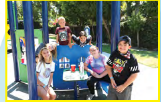
Summer Parks Program (June 13 - August 19)