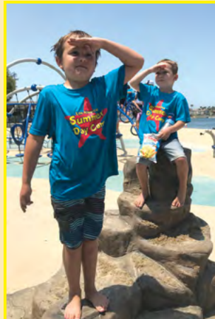
Summer Day Camp (June 13 - August 19)