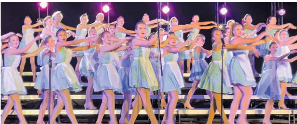
Los Alamitos High School Xquisite Show Choir Performs "Champion" at the All-District Choral Festival

We are so fortunate to have a music department faculty made up of diverse educational backgrounds, repertoires, and talents who lead students to their highest level of potential. We are equally as fortunate to have a supportive community made up of our Board of Education, parents and guardians that continue to motivate and support our students as well as volunteer so much of their personal time to champion our choral programs.