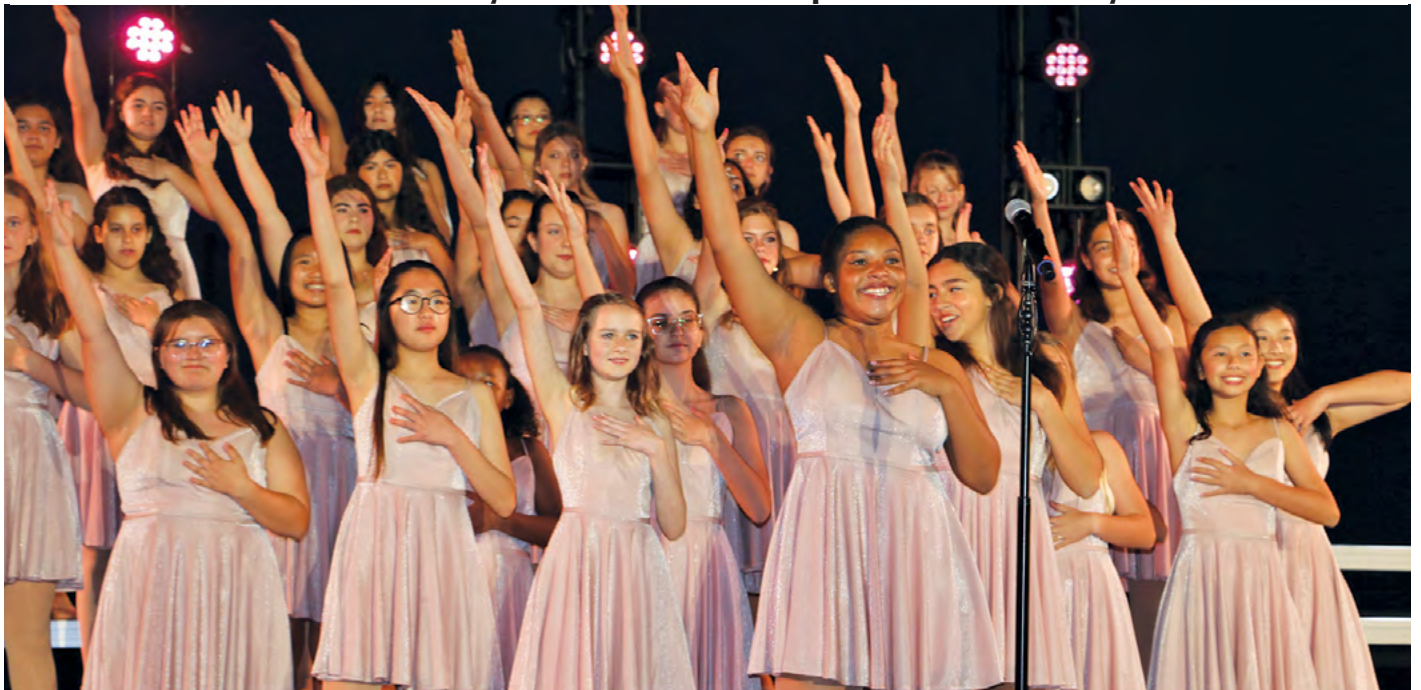
Oak Middle School Showstars with their performance of "Come Alive"