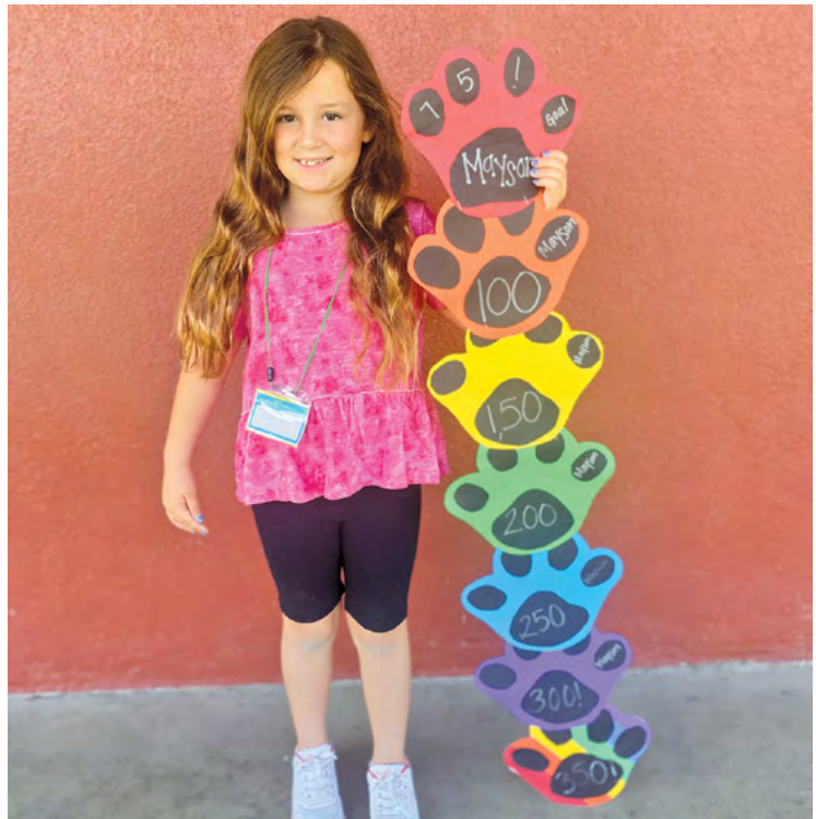
1st Grade Student proudly displaying her earned PAWS.

many Leos far surpass this goal! Students are awarded PAWS for every completed book. PAWS are proudly displayed on our classroom windows to remind our school that our first graders are SUPER READERS. Student celebrations occur every day as classes add up their daily PAW counts. Our first graders encourage one another and root for each other as their PAW counts grow. After one month, the grade level holds a celebration to recognize our Leos' perseverance, reading growth, and increased love of reading. Congratulations to our SUPER READERS!