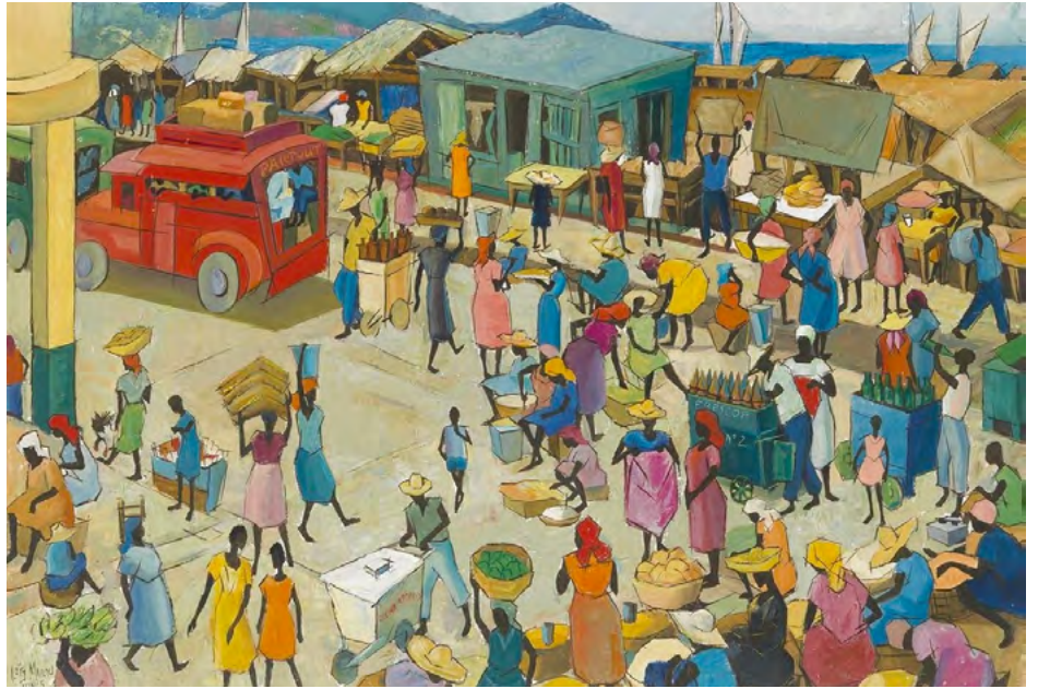
Bazar Du Quai, Port Au Prince, Haiti," oil on canvas, 1961 By Lois Mailou Jones