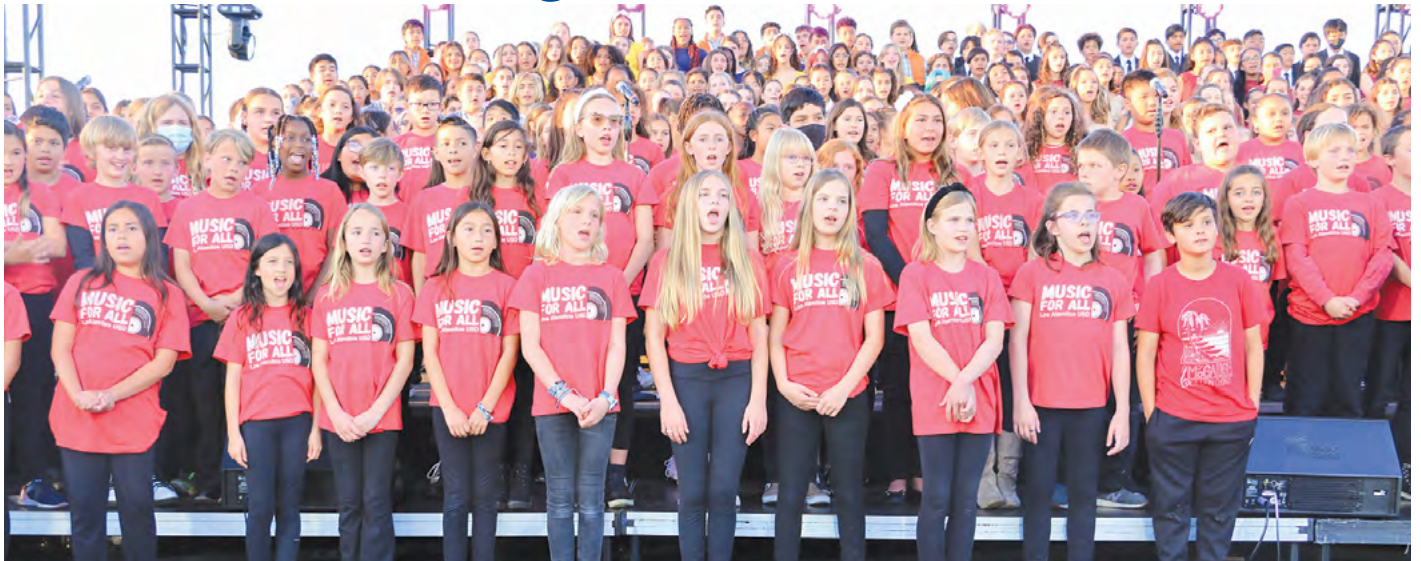
Los Alamitos Elementary school combined choirs perform "Music is Always There"