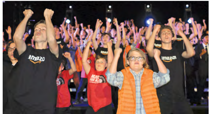
Combined elementary, middle and high school boys choirs, grades 4 through 12, perform together at the All-District Choral Festival

Featuring performances from choir students in fourth through twelfth grade, this year's program began with a beautiful rendition of "Gaudeamus Hodie" (Let us Rejoice Today) sung by our elementary and middle school choirs. Choirs from Oak and McAuliffe Middle Schools took the