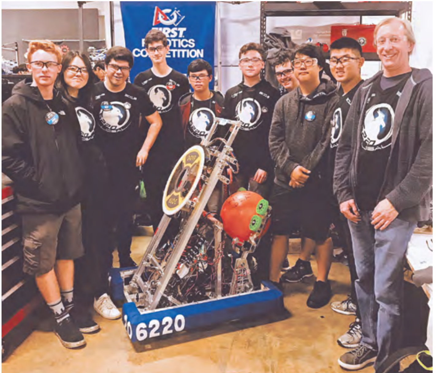
Los Alamitos High School Robotics Team Shines at OC Competition (please see page 8)