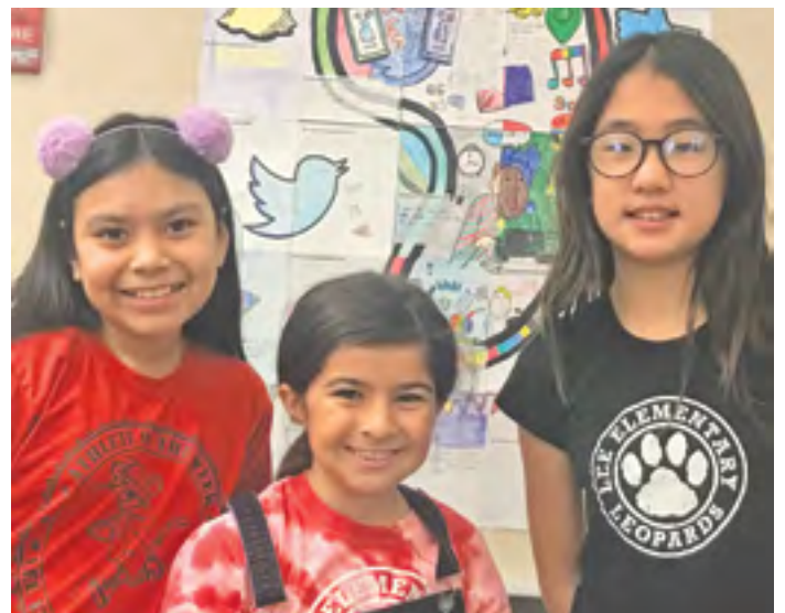
4th graders with their Digital Footprint poster.