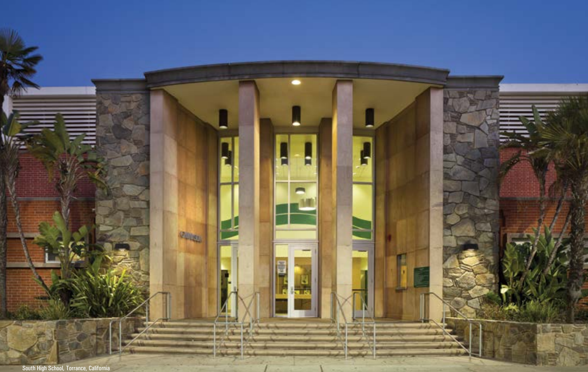
South High School, Torrance, California