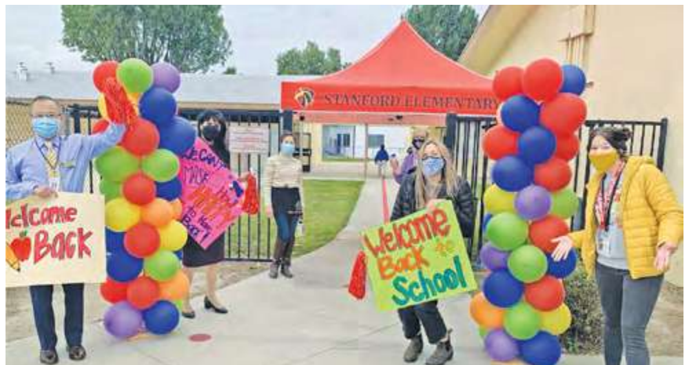
The Stanford staff welcoming our students back to in-person instruction.

Engineering, Art, and Math) Lab next year! The STEAM Lab will be a space where students can create, collaborate, explore robotics and coding, and engage in project-based learning that supports our state standards. Students will be able to practice problem solving and critical thinking skills in more engaging and meaningful ways.