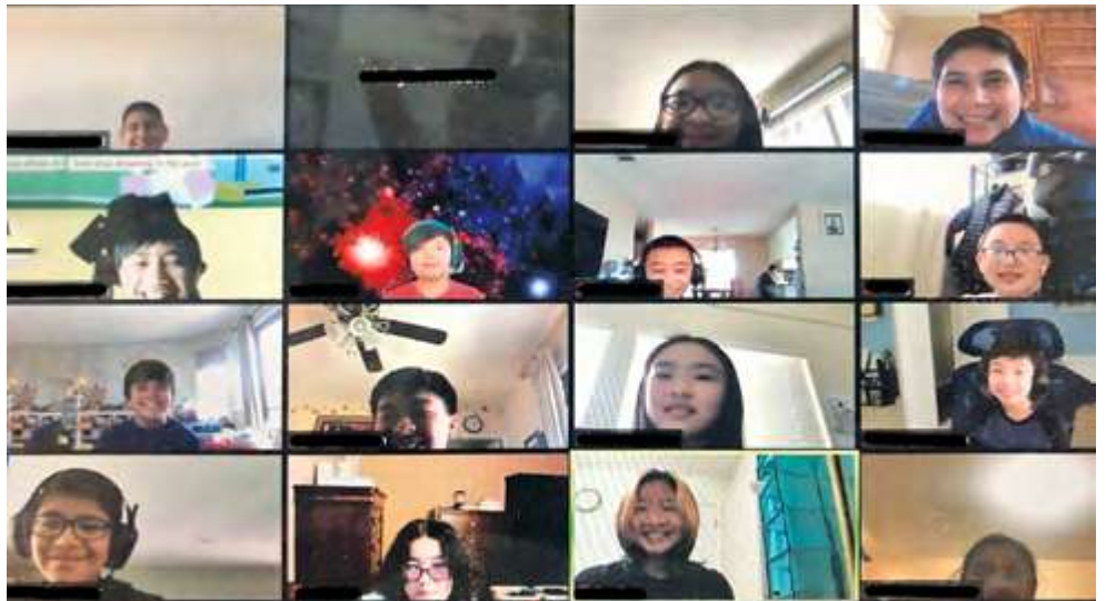
Sixth grade students meet regularly to prepare for the Orange County Academic Pentathlon competition.

and fine arts under the leadership and direction of one of our dedicated sixth grade teachers. Their commitment is strong as they demonstrate initiative and take risks to go above and beyond. We are so proud of their learning success and desire to grow their academic skills.