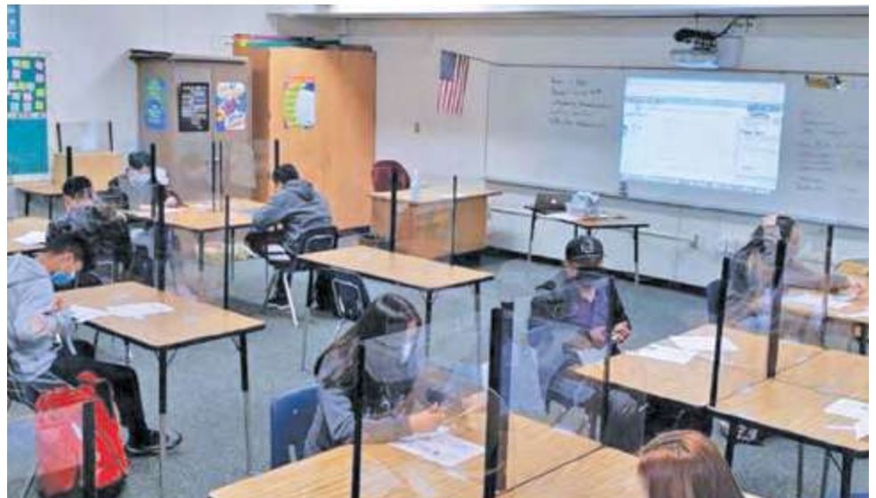
Rancho Alamitos students quickly transitioned to in-person instruction when school reopened in March.

in a row for Boys Cross Country. Our amazing ASB and dedicated clubs continue to keep school spirit high by offering students a variety of opportunities to participate in virtual/in-person spirit weeks that include cooking contests, talent shows, and an International Week.