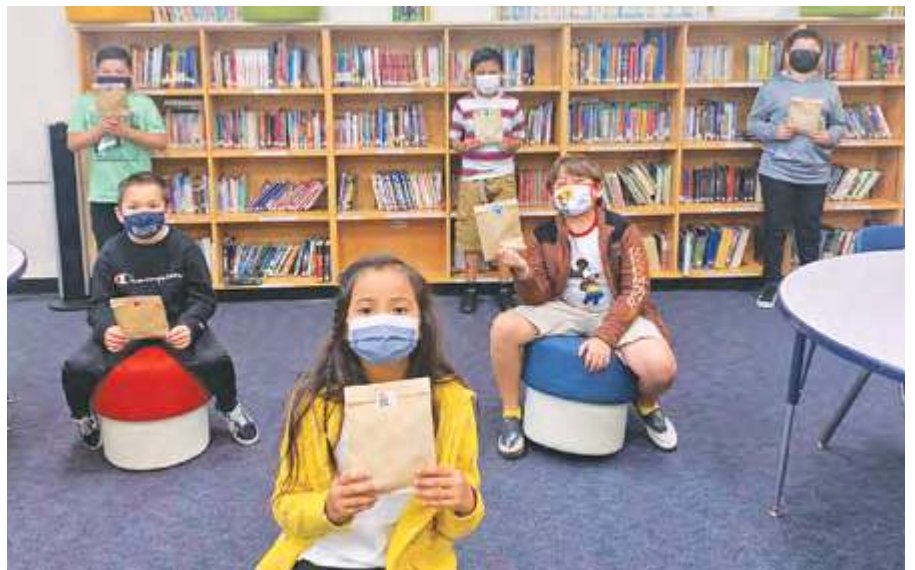
Students collect their prizes from the online Wakeham R.O.A.R. Store!

(R) Responsibility Is My Key for Success. In February, an online Wakeham store went “live” and students were able to spend their points earned when SEL learning objectives were met. We are proud of both the academic and social-emotional successes of our students.