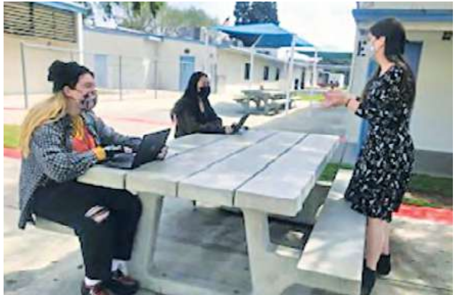
VLA students participate in on campus tutoring.

learning environment. The VLA Leadership Club planned student activities and participated in district activities like BRC, Ethnic Studies Focus Group, and more. We are truly proud of all that our wonderful VLA teachers and students have accomplished this year!