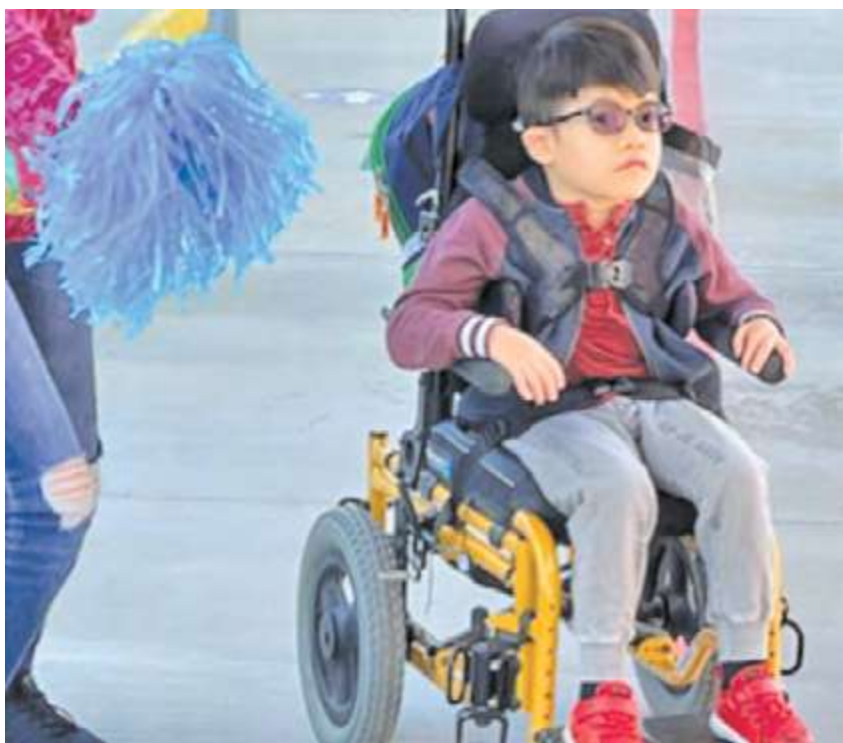
The staff at Mark Twain Special Education Center love having students back on campus!

Our staff and families have gotten to know each other so much better and I know this connection will take Mark Twain to another level of Home/School Connection to push our students to their fullest potential. Thank you, Warrior team and families, for your patience, flexibility, creativity, and love for your work and our students.