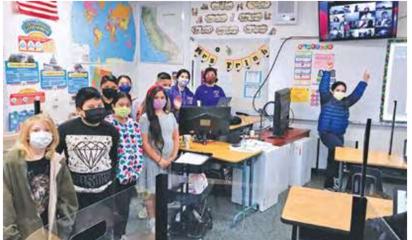
Faylane supports the education of all students including those learning in-person and online.

attuning earbuds to remote learners; eyes rotating from screen to those breathing through masks. It has been a glorious dance! I am so proud! We are enthusiastic to return to 5 full days of in-person instruction in the fall, with a regular schedule including recess and lunch. The best place to learn is in the classroom and we look forward to welcoming all students back to Faylane.