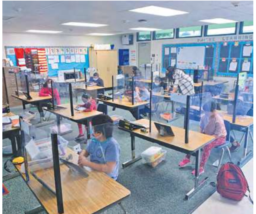
Hill Elementary School students returned to school with a renewed focus on academic excellence.

Thank you to the entire Hill community for making this return happen! Go Hounds!