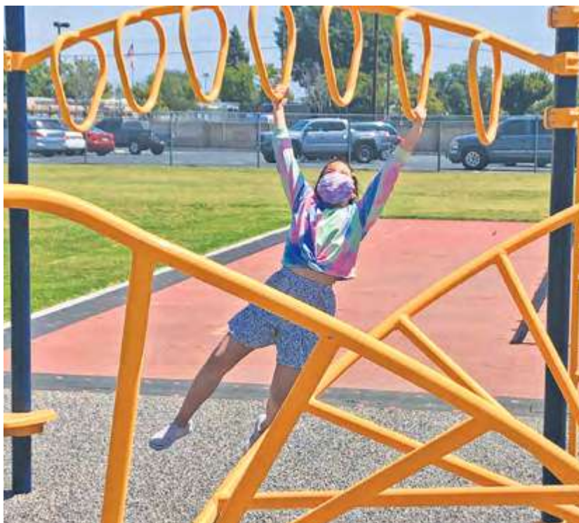
Students re-experience the joy of play when we reopened our play structure in April.

the learning process online. This April, we celebrated the return of many of our distance learners back to school for in-person learning. As we reopened, the joy of being back to school after a year of quarantining, was the overriding feeling of the day! While strict PPE and many other health and safety measures are in place, this did not diminish the excitement of being back to see friends, staff and teachers in person. Our Cook community has remained strong and resilient with the proof in the smiling eyes of students and staff. Nothing keeps our Cook Lions from learning! #CookLionStrong!