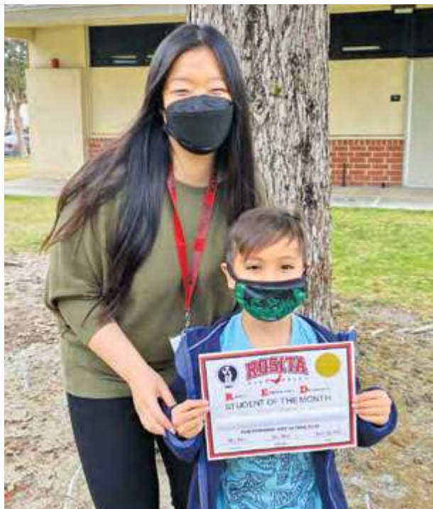
Rosita honors one of our second graders with the "RED" Student of the Month Award.

We are so excited to welcome our students back to campus for in-person instruction. Rosita had a successful reopening in March. Staff and students were delighted to have our classrooms filled with our beloved students whom we have missed after nearly one year of distance learning. One of our school and district goals is equipping students with personal skills. We are focused on helping all learners develop the personal skills necessary to achieve their academic and social-emotional goals.