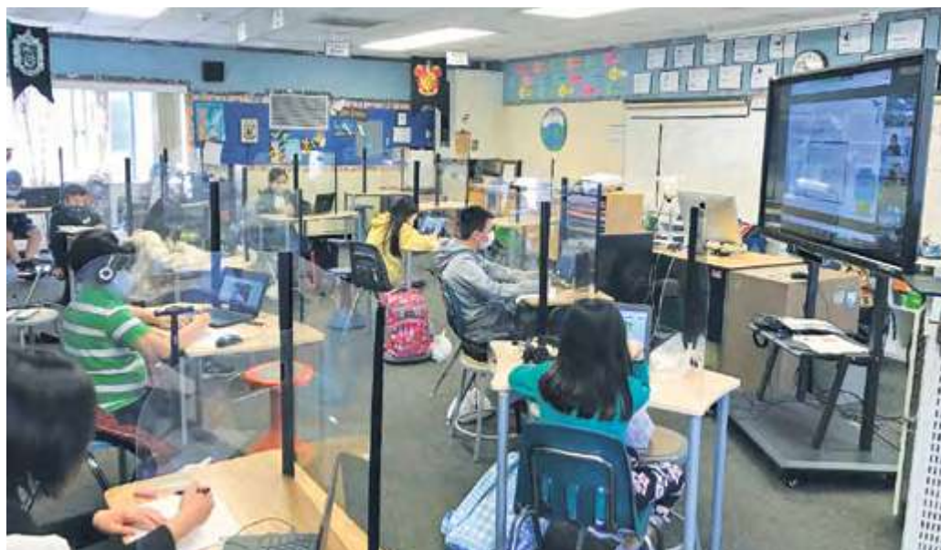
Allen students use 3D design software to create their Design Thinking project.

new activities in sports, the arts, and career education. We remain committed to offering opportunities that will equip students with both the academic and personal skills for lifelong success.