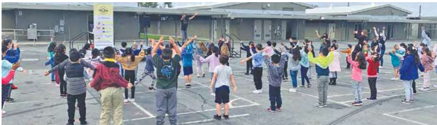
Students danced and exercised during a fun and inspiring outdoor assembly.

dancing and exercise can increase positive energy and help build happiness. Danny's uplifting message encouraged all of us to find joy in each and every day and to "LIVE HAPPY NOW!" We were pleased to be able to participate in this fun assembly as a way to maintain our momentum and excitement about being back on campus for in-person instruction. This assembly was a reflection of our commitment to supporting the whole child, including social-emotional well-being.