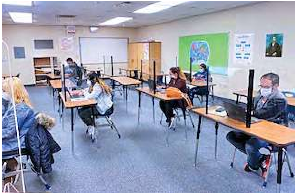
The Adult Education program at Lincoln offers in-person and online instruction with opportunities for adult learners at all levels.

that high school diploma, improve your English, or earn a certificate for job training. #yourfutureisbrightatggae