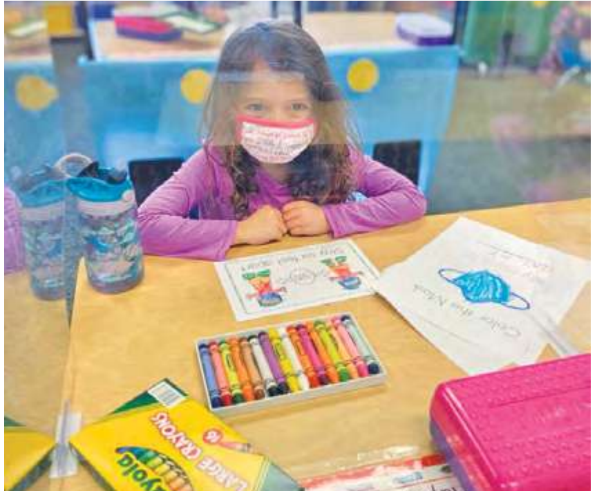
Parkview Elementary School students did a fantastic job following health and safety protocols when returning to in-person instruction.

Parkview Elementary School welcomed back all students on Monday, March 15th after a year of distance learning. All teachers and staff were eager to welcome students back to campus! Students did a wonderful job following new safety protocols and were so happy to see their friends and teachers. Parkview teachers did an amazing job over the past 12 months creating engaging lessons for their students and continuing the rigorous instruction Parkview is known for. For the remainder of the school year, many Parkview students opted to remain at home and classrooms were split between in-person instruction during the morning and on-line instruction during the afternoon. Parkview families know that either in-person or on-line, their students are in great hands and will be prepared for success in 2021-2022!