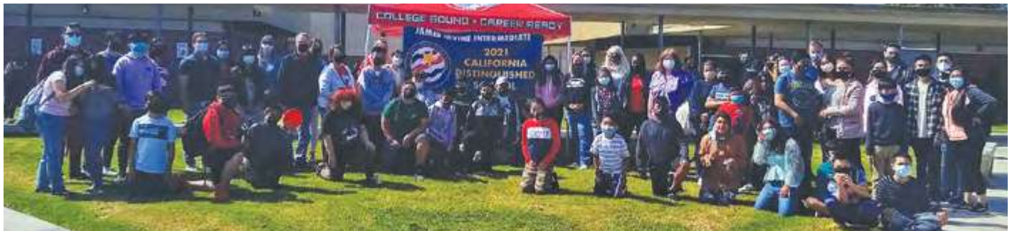
Irvine Intermediate School staff and students were excited to be named a 2021 California Distinguished School Award, a prestigious recognition awarded to only 11 schools across Orange County.

Irvine Intermediate is extremely proud of our teachers and students who make our school extraordinarily special! Throughout the past several years, there has been a dedicated focus on active speaking and listening strategies across the curriculum. When students have an opportunity to speak about the content they are learning, their understanding of the content deepens. Our students are learning to speak like historians, scientists, musicians, athletes, mathematicians, and scholars! Schoolwide, we have seen an increase in students' confidence, ability, and performance.