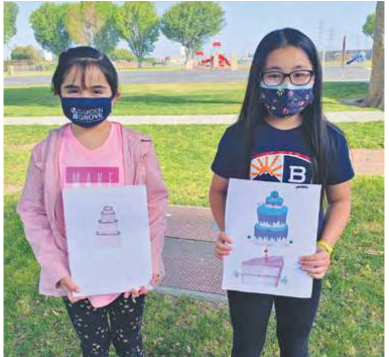
Bryant students proudly show off their drawings of desserts from the Bryant Family Arts Night.

Art Night, Family STEM Night, and a Readathon. Our partnership with Inner City Arts has helped to foster a resilient and creative community at Bryant. On April 8, parents and students joined an artist on Zoom, who taught shading and perspective techniques as she led us through drawing some delicious cakes and desserts. The following day, students returned to campus with their amazing artwork, increasing their sense of connectedness. Bryant is a joyous, child-centered community where there are many opportunities for enrichment and engaging academics. We appreciate every opportunity to make a positive connection with our students & families- that's the "Garden Grove Way!"