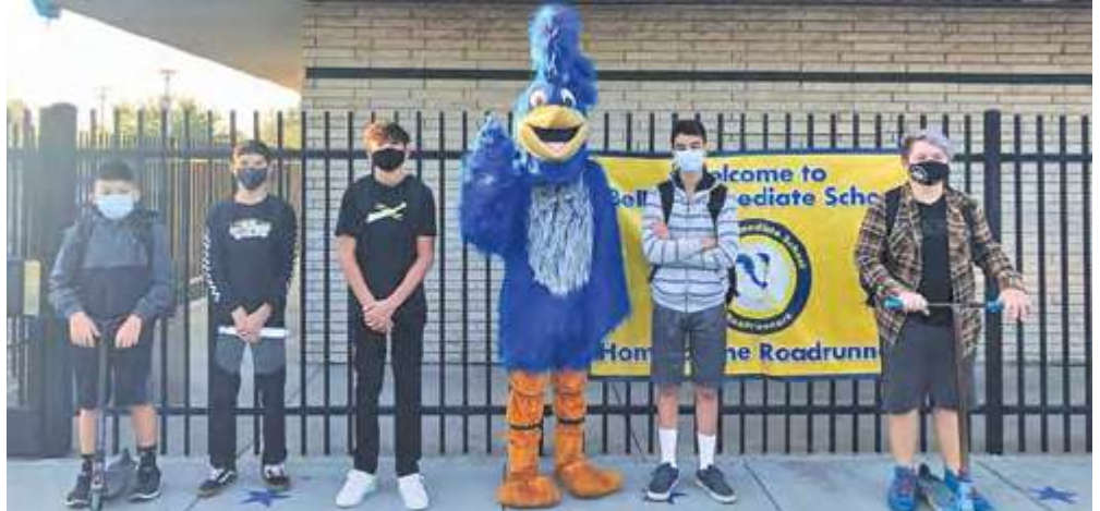
Bell Intermediate School is committed to the growth and success of all students.

example of how teachers put students first and received the distinguished honor of being a School to Watch for a second time. Ultimately, Bell continues to have student-centered organizational structures that set us apart because our students' growth and success are always at the forefront of our decision-making. Bell's teachers strive daily to keep students engaged and learning throughout a transitional time in their lives. #TheRoadrunnerWay!