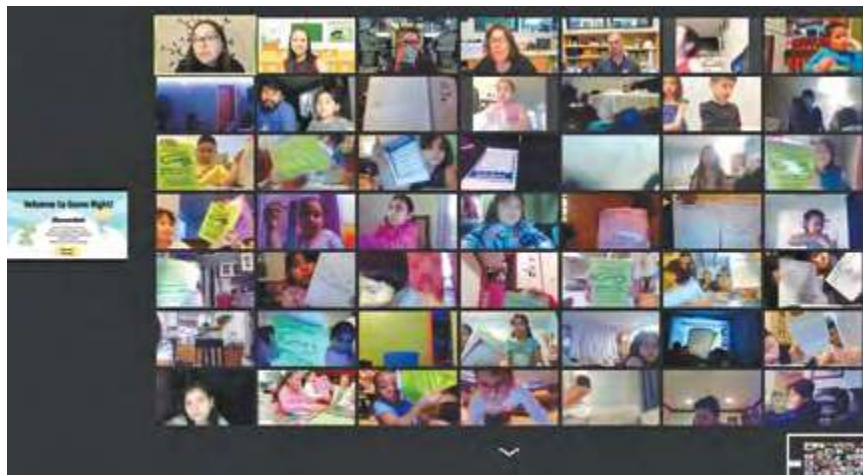
The Russell community enjoyed the school's virtual Family Bingo Night.

January. This event was characterized by collaboration between various school community members dedicated to connecting parents and families with digital and physical resources to support math instruction at home in an engaging manner. Who doesn't like Bingo, right? Community engagement will continue being a foundation for school wide activities and programming as Russell prepares for full-day in-person instruction in the Fall.