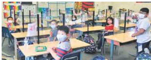
Students are happy to be back in school learning alongside their classmates.

school gates to be opened, to grab their Grab-n-Go lunches, waiting in restroom lines, and also to be picked up after their school session. Instead of regular recess we have structured P.E., where kids learn a new way of playing, being a part of a team, and learn social skills among their peers. Inside the classrooms, students are supported by our wonderful teaching staff. Since Morningside has a morning session and an afternoon session, we are able to split the full class and set up for a max occupancy of 15 students per session. We also have over 40 students participating in our Boys & Girls Club afterschool program which helps support our parents with their student's busy schedules. As the school year comes to an end, we are sad to see our 6th graders leave but excited to welcome our new kindergarteners. Despite the challenges of COVID-19, we