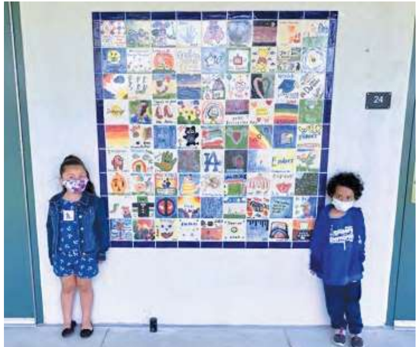
Students enjoy numerous renovations and upgrades including a new tile wall demonstrating our school spirit.

Our Enders Mustangs are so excited to be able to see all of their classmates in person. Our teachers and staff were always focused on what's best for our children and community. During the school year, we have also focused on some improvement projects for our campus. We have added to our existing Rock Garden, mounted a new tile wall, added a new outdoor shade structure for our students, and replaced old playground equipment with new play structures. By the end of the school year, every classroom will have wall mounted projectors to help aid student engagement and classroom instruction. We are very proud of our hard work and perseverance in once again uniting all our Mustangs in person this school year!