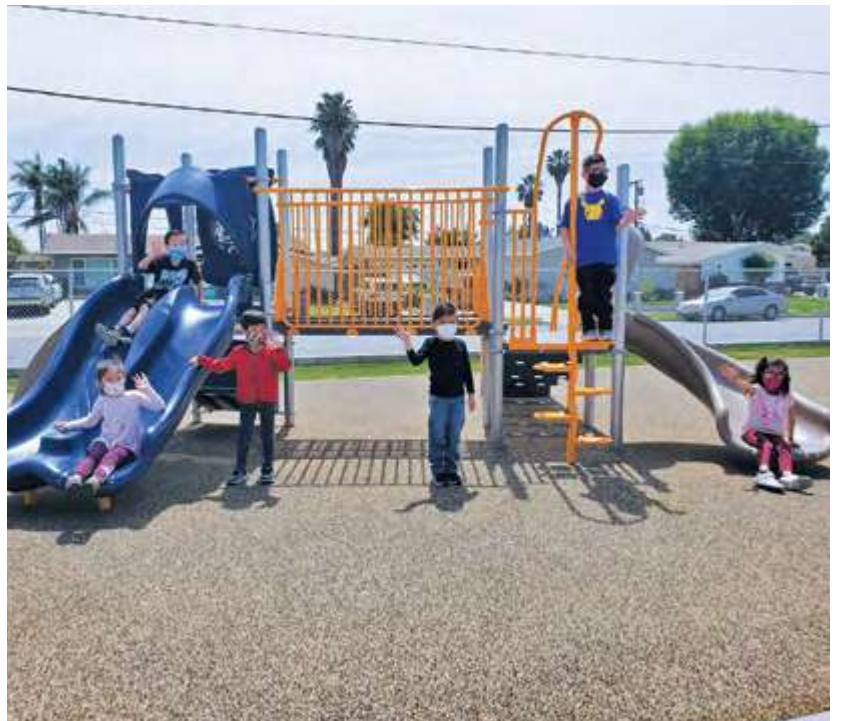
Kindergarten students enjoy the school's new playground equipment.

We can all say that this has been quite the year! I'm so proud of our Excelsior students, parents and staff. Our team has worked together to create high-quality learning environments for our students both at home and at school. Our families and teachers have shown their flexibility and dedication with each schedule change throughout the year. School staff have chipped in all year long with cleaning support, communication support, and other above and beyond duties to help our students succeed. Excelsior now has 100% of our students back on campus and we are excited to begin bringing back "normal" activities following all health and safety protocols. Last year, the PTA and staff worked to fundraise for a kindergarten playground. It was sitting vacant for many months. Finally, with our students back on campus, our kindergarten students are playing on the new equipment.