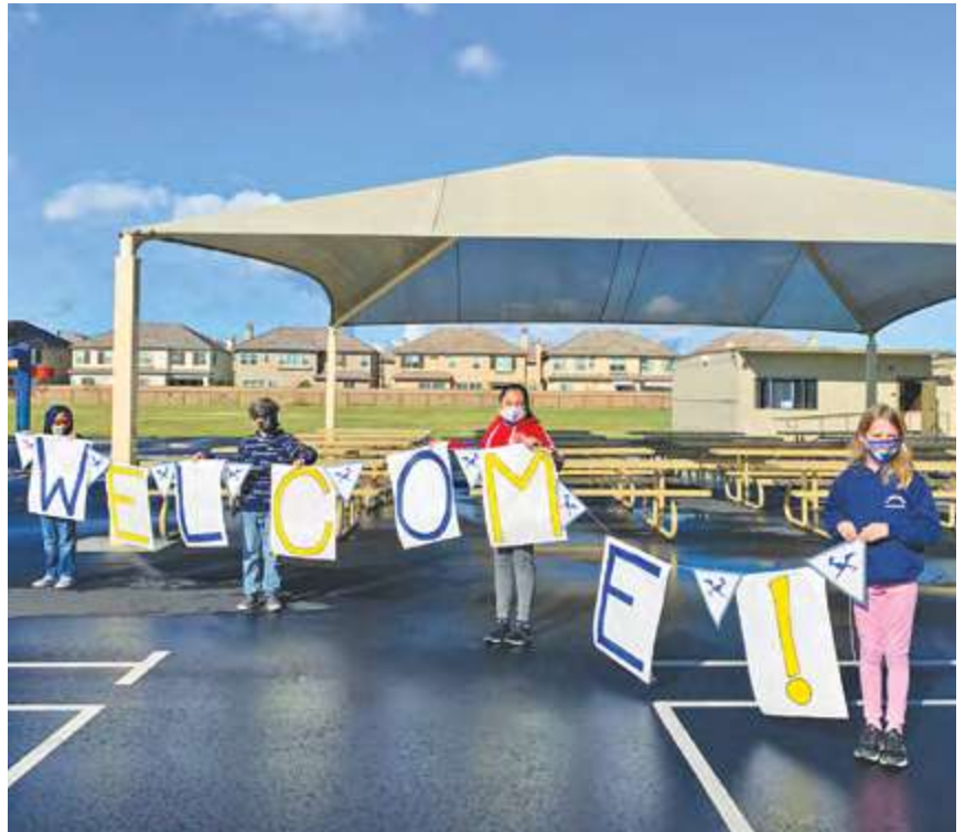
Welcome back, Lawrence Roadrunners!

We were very excited to welcome back our in-person learners at Lawrence Elementary School! Although our students and families did an outstanding job adjusting to the demands and changes that distance learning necessitated, we are thrilled to have our students back on campus. Our Lawrence staff enthusiastically greeted students on their first day back on campus, and we have never seen bigger smiles (even through the masks). In addition to being happy to be back, our students are doing a wonderful job with adhering to safety measures as they engage in in-person learning and enjoy the company of their friends and teachers. Students are enjoying the new look of our campus and are interacting with friends in distanced, structured activities such as rotating physical education circuits with fewer students per station.