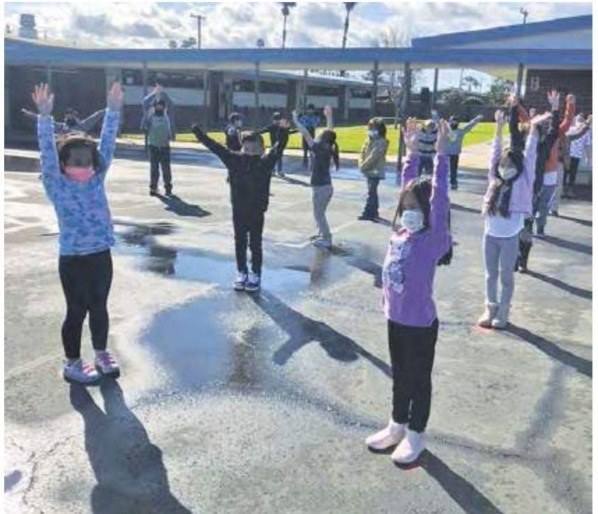
Students are thrilled to be together again on campus and get some exercise outside.

Students at Anthony Elementary School are overjoyed to be back in school. On February 23rd, Anthony School reopened for in-person learning. Teachers and staff members were excited to see the students return, and greeted them as they arrived at school. Even with masks on, it was clear that everyone was all smiles! Students quickly adapted to safety rules, with everyone wearing masks and practicing social distancing. Teachers remain committed to making student learning their first priority. At Anthony Elementary School, every teacher provides targeted intervention to provide extra instruction for those students needing extra learning support. The extra attention and help is just what our students need. At Anthony Elementary School, everyone agrees, it is wonderful to be back for in-person instruction!