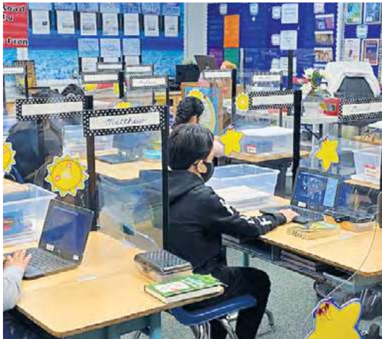
Zeyen scholars remain committed to academic success and are happy to be back for in-person instruction.

At Zeyen Elementary School, we are always looking for the silver lining in everything we do and/or experience. The pandemic was no different. Because of the pandemic, additional funds were made available so that we could purchase Chromebooks for every student who attends our school. Chromebooks and hotspots were made available so that students could actively participate in distance learning during the “stay at home” order. With these new technical devices, students were able to connect with their teachers online, complete a wide variety of curricular assignments, and check out books from the electronic library. Now that we are back in a hybrid schedule, our students have been able to take these devices back and forth between school and their home. Our students demonstrated GRIT throughout this pandemic by committing themselves to doing their best in an online environment. We are all looking forward to the Fall of next year when we plan to be back full time. Way to go Cobras!