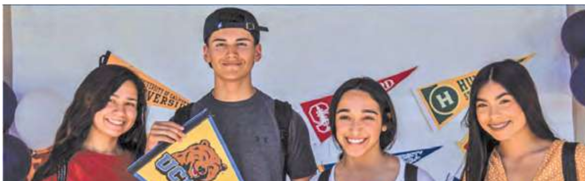
Santiago High School is proud of its success with the Early College Academy program that allows students to earn college credit for free while still in high school.

school students for 2021-2022. The Early College Academy's dual enrollment program allows students to be enrolled at Santiago High School and Santa Ana College. Courses are taught by a Santa Ana College professor and a Santiago High School teacher. Students meet GGUSD graduation requirements and receive Santa Ana college units that are transferrable to UC/CSU and most private universities. Benefits of being a dual enrollment student include no costs on tuition or books and students generate a college transcript of lower division general education courses. Santiago is leading the way!