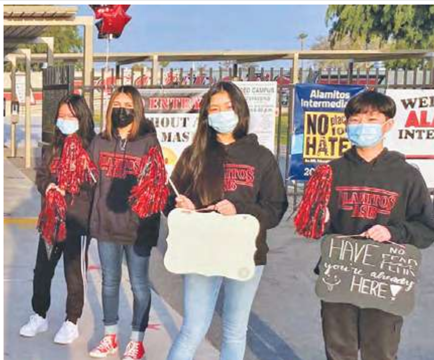
Alamitos Intermediate School's ASB welcomed students back to in-person instruction with cheers, signs and smiles!

This school year started out in distance learning but Alamitos was excited to finally welcome students back to in-person instruction. Our students were met with the ASB students welcoming them with signs and cheers, as well as our staff who were so excited to have students back on campus. Parents stopped to take distanced pictures, honked, and waved happily as they saw their children excited to be back on campus again. As the new principal at Alamitos, I was thrilled to welcome our new seventh graders to our campus and be able to meet our eighth graders who will be leaving us in just a few weeks. We hope all of our students that chose to join us have a great school year and we look forward to the wonderful memories that they will make. Welcome back students and we wish you an amazing end to the 2020-2021 school year!