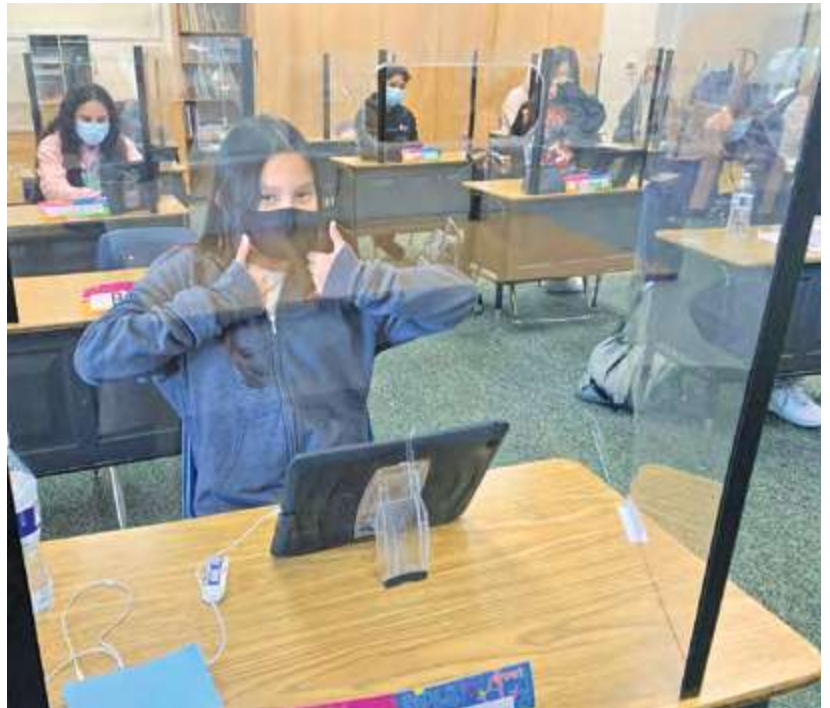
Mitchell Elementary School students are excited to be back on campus, learning in their classrooms.

Apple School one-to-one iPad Program has been integral in transitioning students to Distance Learning and then back into classrooms. Our MTSS (multi-tiered systems of support) work as a pilot school has allowed us to get a head start in addressing the inevitable learning gaps brought on by the pandemic. Many students have been able to participate in an extended day of live instruction as teachers live stream instruction to distance learning students while simultaneously teaching students in class. A big thank you to all of our school stakeholders including parents, teachers, and classified staff! It has truly been a team effort!