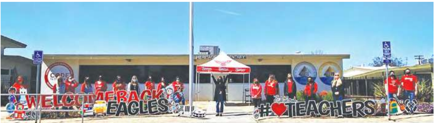
Heritage Computer Science Academy staff welcome students back for in-person instruction.

with how easily everyone has settled into the new routines. Boys and Girls Club has been an important part of our transition back to in person classes. This has allowed many of our students to stay all day under their supervision giving them a more authentic experience. Looking forward to the 2021-2022 school year where we will continue to be the district's first Computer Science Dual Immersion Academy. Our students are ready to start showing off their coding skills once again.