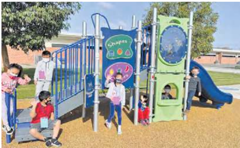
Kindergarten students enjoy the school's new playground equipment.

job following safety guidelines, distancing rules and mask requirements. We are so proud of them! Great news...the final renovations to the NEW kindergarten playground are completed! Both the kindergarten playground and the main playground will have new play equipment for students to enjoy when it is safe. Students and staff are also able to safely distance in brand new restroom facilities on the Peters 4-6 campus. The return of students to campus has also allowed the entire Peters