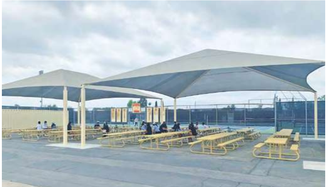
Students are enjoying two new shade structures as a recent upgrade on their campus.

walls, students can stick around after school and do their homework al fresco! Our students are enjoying it already even during our shortened days, but they are really going to love it when we return to a normal schedule next year.