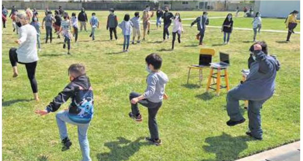
Our distance learners and in-person students motivate each other through movement.

and making those crucial social-emotional connections. From collaborating in classes to exercising outside in their class cohorts, there is excitement within our students and staff as we return to normalcy. Our return to school campus has been an encouragement to all, and we look forward to next year when all students will join us for a traditional school year.