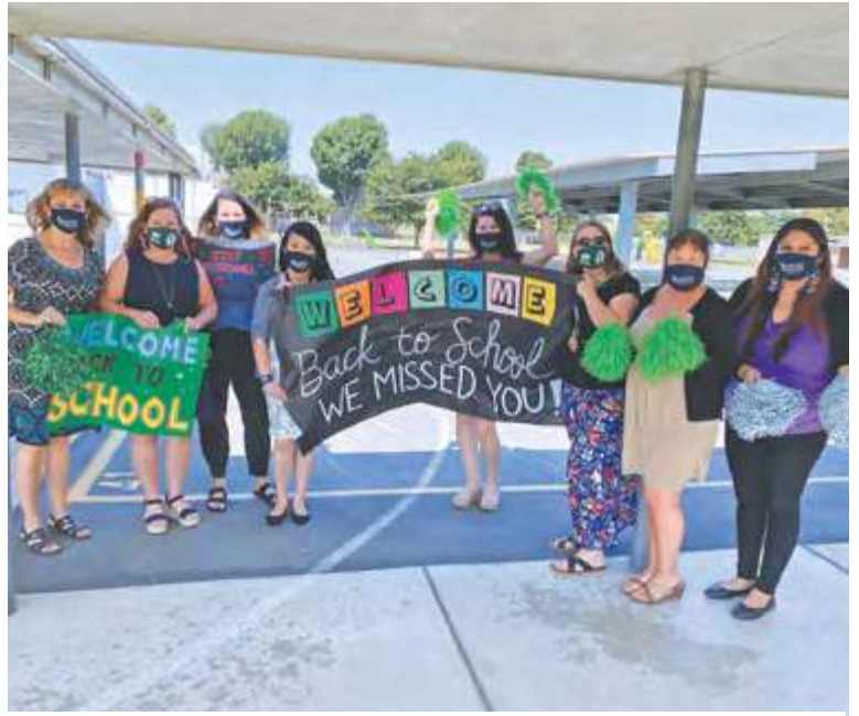
Eisenhower Elementary staff enthusiastically welcomed all students back for full in-person instruction.

Earlier in the school year, staff welcomed back our students to in-person instruction in a hybrid model, while simultaneously offering live-streaming to students at home. Our teachers created a supportive and encouraging environment, consistently delivering a rigorous level of instruction. They enthusiastically collaborated to plan, teach, and progress monitor students. We provided intervention in reading foundational skills to meet student needs, outside of the dedicated instructional minutes. We also partnered with CSU Dominguez Hills for further online tutoring in reading. Families and teachers consistently communicated regarding all aspects of student needs. We look forward to welcoming students back to full-day in-person learning this spring and will be offering students extra support in math and reading over the summer.