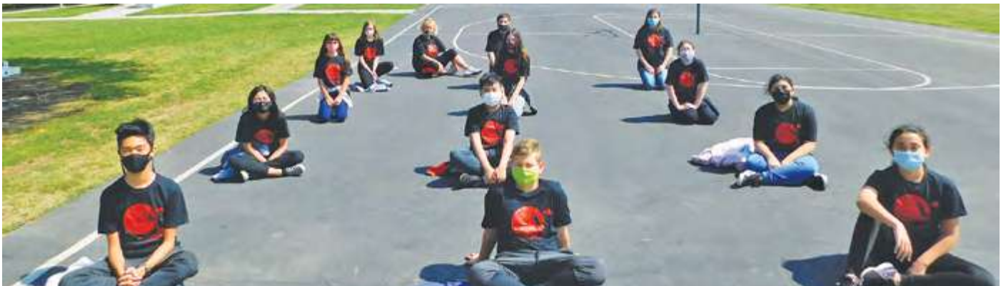
Garden Park sixth graders have been busy studying for the annual Orange County Academic Pentathlon.