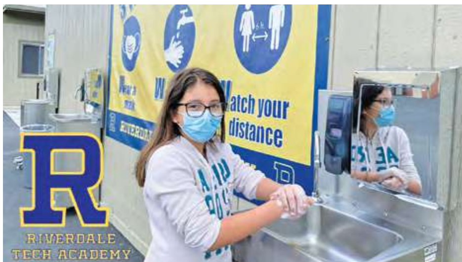
Students at Riverdale Tech Academy practice frequent hand-washing to help prevent the spread of COVID-19.

spread of COVID-19 by practicing the 3W's by Wearing a mask, Washing hands and Watching their distance. These practices have allowed for a safe return to campus. To stay up to date on everything happening at Riverdale Tech Academy please follow us on Instagram, Twitter or Facebook @RiverdaleGGUSD