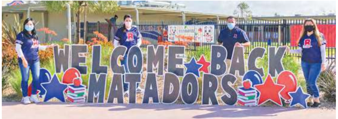
Staff welcomes students back to Bolsa Grande High School for in-person instruction.

We are very eager to see all of our students back in the 2021-2022 school year. Look for upcoming information about a Summer Bridge program.