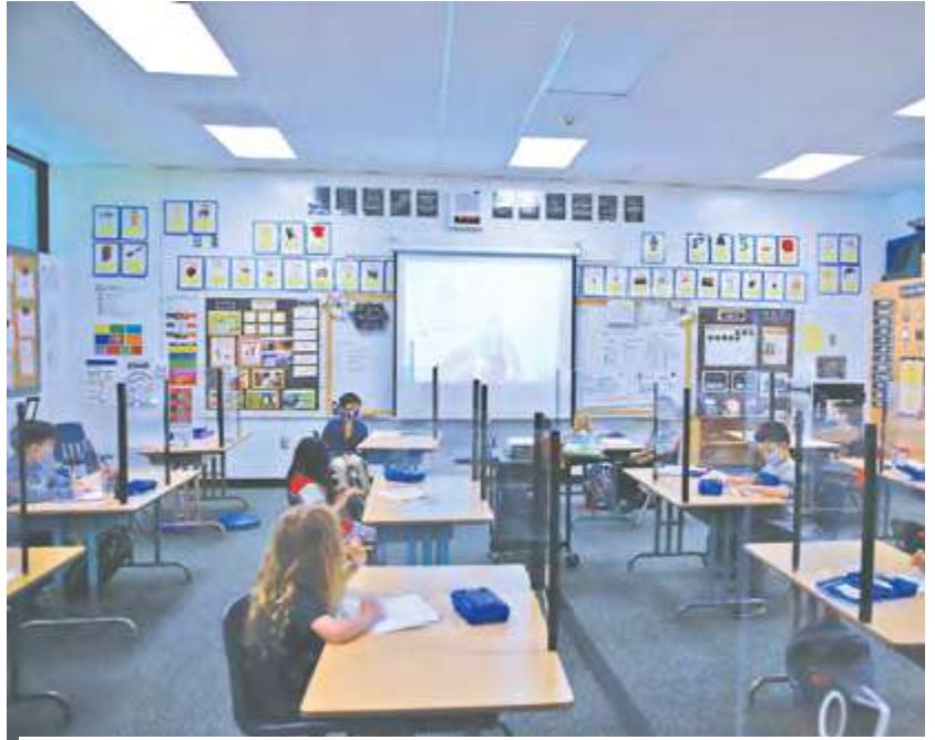
Gilbert Elementary students are thrilled to be back in class learning alongside their classmates.

our students in person again. We are all so proud of how quickly students have adjusted to adhering to all of the safety protocols in place: wearing masks, social distancing around campus, and working at classroom desks equipped with protective student carrels. All of these efforts have achieved the desired result - students are happy to be back on campus and ready to learn! "What I enjoyed most this week was that I got to see friends," said a Gilbert 5th grader. Another student commented, "The sheer enjoyment of seeing people is what I like best." It's looking like a grrrrreat way to end the year for the Gilbert Grizzlies!