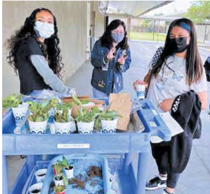
Students enjoyed the recent Earth Day Nature Contest.

including hand washing and sanitation, adhering to mask protocols and maintaining physical distancing. These protocols are keeping staff and students safe as we've had no on campus spread and no positive COVID-19 cases. Students coming to the Ralston campus are benefiting from the high-quality in-person instruction. They are actively engaged in discussions and engaging