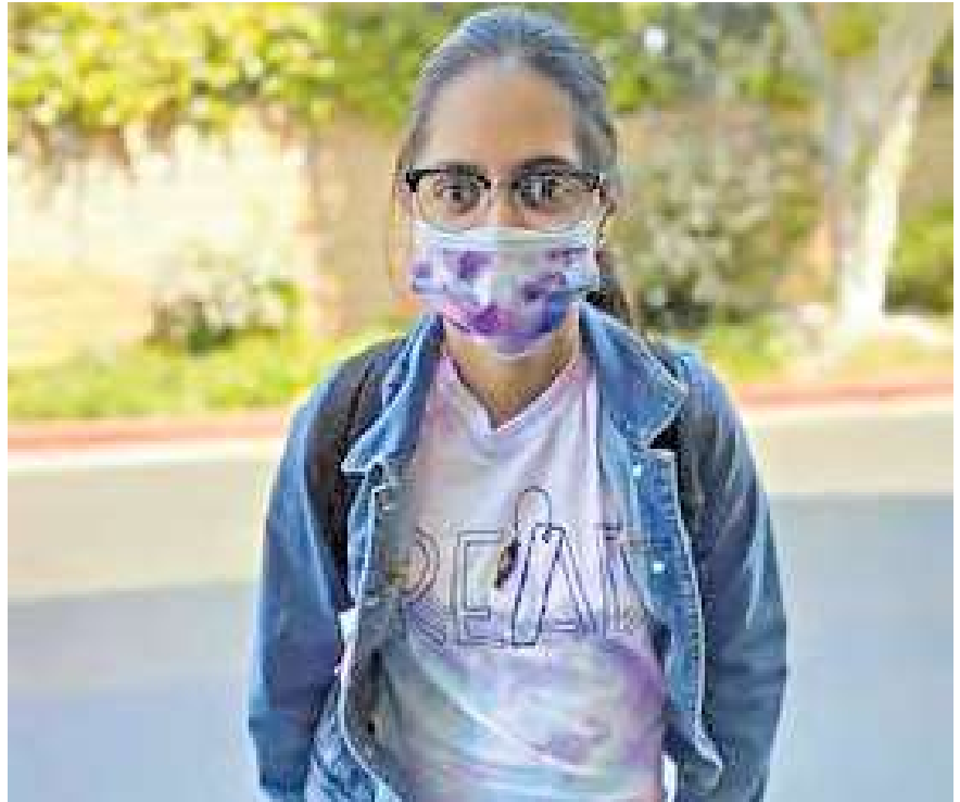
This Spartan scholar shows her school spirit by wearing her tie dye "Read" shirt and mask.

cheer for students in-person. Spirit days included Monday March Madness, Tie Dye Tuesday, Wacky Wednesday, Throwback Thursday, and Fun Friday. Doig students and staff dressed in their favorite sports attire, found their best-dressed pictures from their high school yearbook, and shared baby pictures from ten years ago. Students and staff for the first time in over a year were able to show their school spirit in their classrooms, all over campus, and continue to build the community that all year had only existed online.