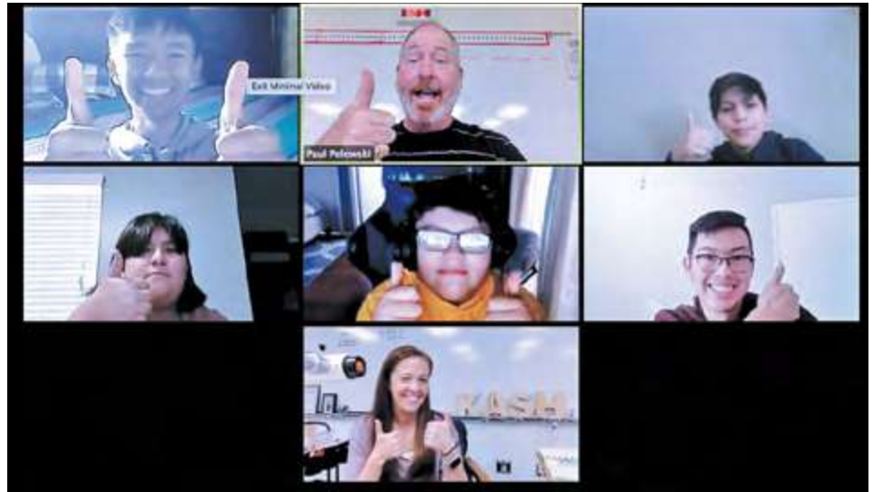
Simmons Elementary School's College and Career Mentoring Program inspires sixth grade students to pursue their goals, following in the footsteps of former Simmons students who currently attend college.

skills and strategies to make choices that will help them become their own best-selves. In addition to sharing stories about personal success and challenges, the mentors teach students how to set their own goals, persevere through challenges, and take charge of building their future.