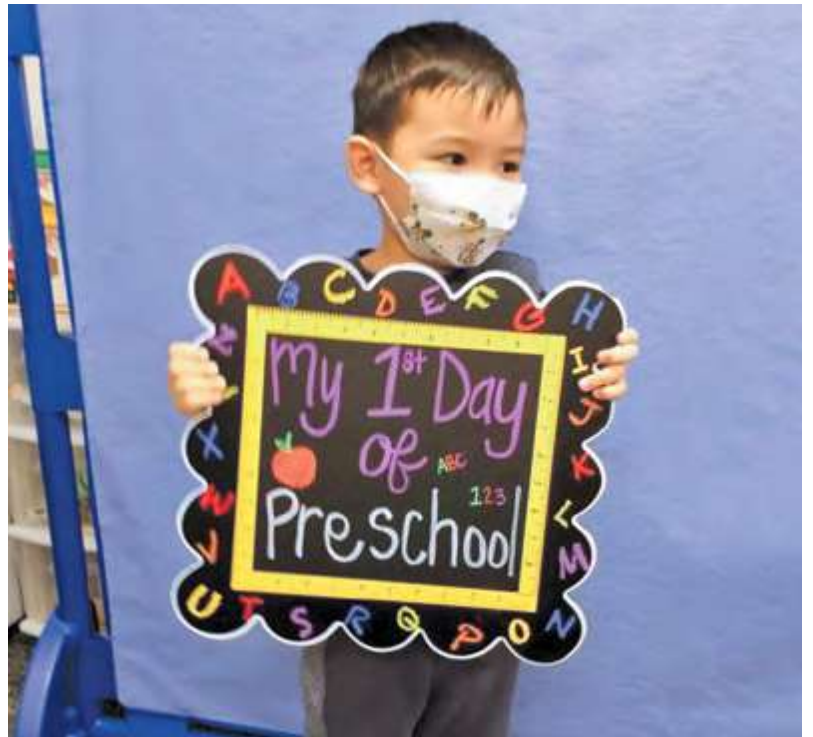
Carver students celebrated the first day of preschool.

instruction! The first day back in-person was like the first day of (pre)school! Smiles, tears, and excitement were everywhere. And even with new guidelines, our students and staff adapted! Moreover, staff is excited to be back with our students and the positive energy and joy from our students and their families being back in-person is evident every day! As the principal of the Early Childhood Education Center (ECEC) at Carver, Heritage, and Skylark, I am truly grateful for all of our students, staff, and families. Everyone's effort, time, resilience, and kindness this year has allowed our ECEC school community to continue to thrive!