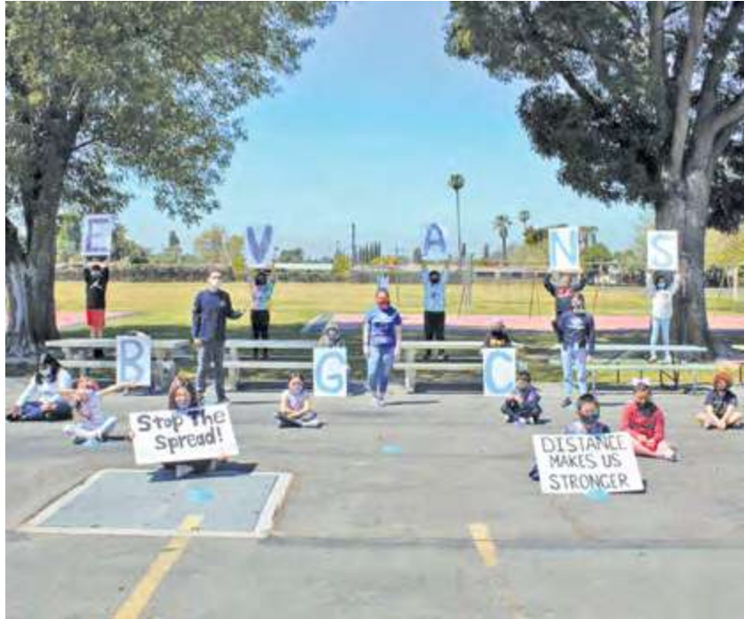
Boys and Girls Club students led the way by helping foster a safe and healthy school campus.

Evans Elementary School students were eager to return for in-person instruction this school year. Students in our Boys and Girls Club led the way when their program welcomed back students in January. These students quickly embraced and followed all of the safety protocols on campus and set the pace for our other students that returned in March. Under the supervision of the Boys and Girls Club staff, these students received assistance with their schoolwork, and enjoyed activities safely. Our collaborative staff efforts at Evans are greatly enhanced by our caring families and supportive community. We look forward to Fall when we will be welcoming all students back for 5 full days of in-person instruction, and Boys and Girls Club will be able to run their afterschool program at full capacity. There is much to be thankful for at Evans Elementary School!