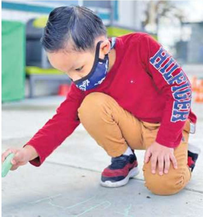
Preschool students enjoy outdoor learning with sidewalk chalk.