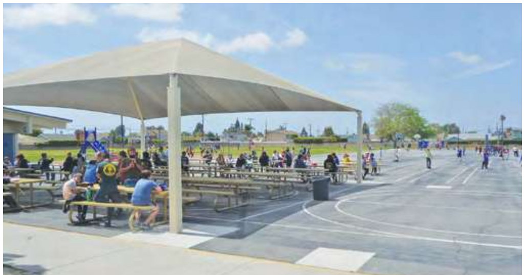
Barker Elementary School has reopened for five full days of in-person instruction for all students.

masks all day, and maintain proper social distancing when possible. Our students are thriving and happy being back at school. We look forward to finishing the school year strong and coming back to school in August with the knowledge that being back to school full-time is safe for all.