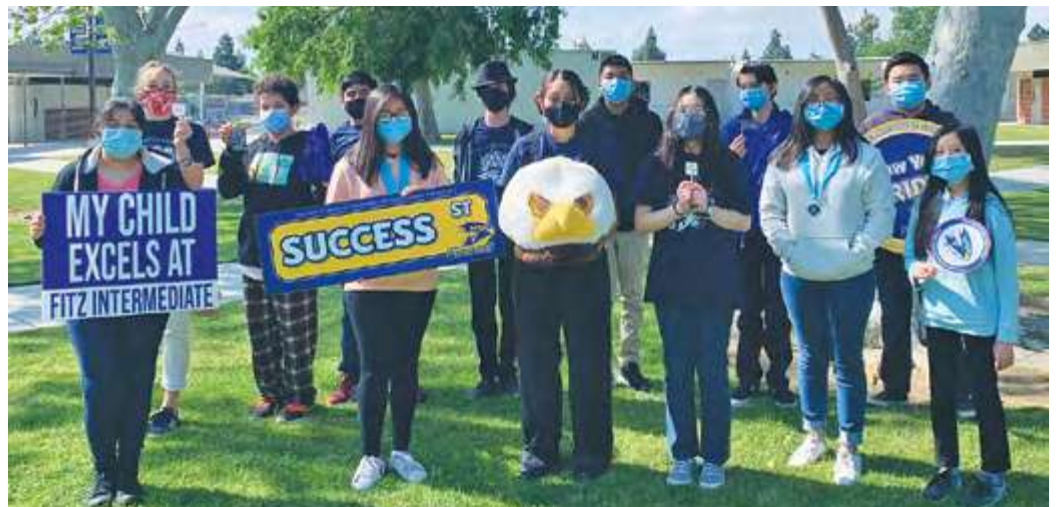
A team of Fitz students prepare for the Orange County 2021 Academic Pentathlon.

and biliterate achievement. Falcons from the Heritage Spanish class as well as select students demonstrate a vast knowledge of Spanish to earn this prestigious achievement. Multiple measures that include persuasive essays in both languages as well as oral presentations qualify students to receive this Bilingual award and medal which benefits students in high school and college.