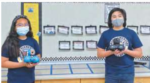
Students enjoy coding and robotics in the school's lab.

Post is a remarkable GATE-cluster school that provides a variety of opportunities for students to grow, thrive, and be innovative. We offer after-school programs for the academic scholar, artist at heart, future scientist, and inquisitive engineer. Post sixth-grade scholars are encouraged to participate in the Academic Pentathlon competition. Our students study, train, and work hard to compete in the subject areas of fine arts, literature, math, science, and social science. Our after school GATE-Plus art program inspires our artists to study the elements and principles of design, as well as experiment with art media. Students use many forms of mediums including chalk, watercolor, tempera, pastels, and mixed media techniques. Art should be experienced and better yet, shared. Post student artists enjoy the opportunity to enter local art shows, county wide and globally. The after-school GATE Science program gives students an opportunity to immerse in hands-on experimental science. Our scientists complete an authentic research project with fellow scientists,