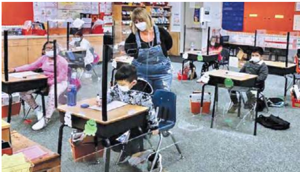
Woodbury Elementary students embraced the opportunity to return to school for in-person instruction.

hybrid, or in-person. We continue to empower students by encouraging collaboration with each other, their teachers, and by creating unique ways to express their learning and understanding. As this school year closes, we are extremely grateful for health and wellbeing of our school community!