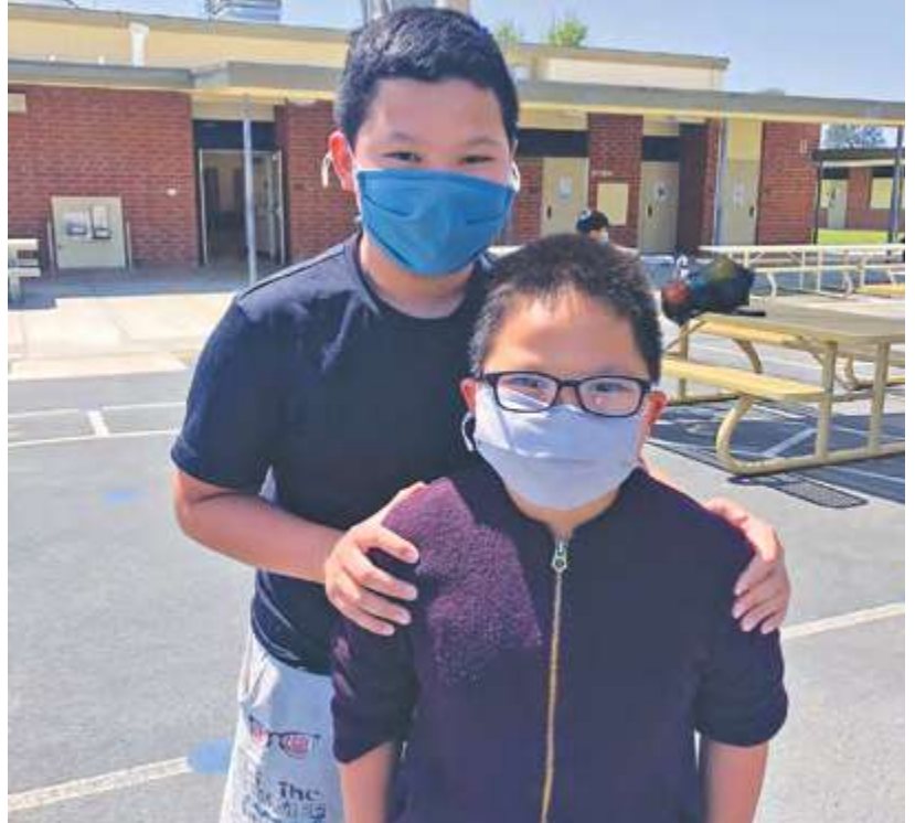
Stanley siblings are excited to be back at school.

To keep students safe, students have access to individual plexiglass desk shields, individual supplies, GGUSD logo masks, new hand washing stations, and automatic hand sanitizers at every gate and classroom entrance. In addition to the new health and safety site upgrades, teachers have been able to incorporate new technology into learning. Every classroom was upgraded with a short throw projector. This allows teachers to go wireless for the first time! The new projectors also support student engagement through interactive white board features and serve as a new way for students to share their work with the whole class.