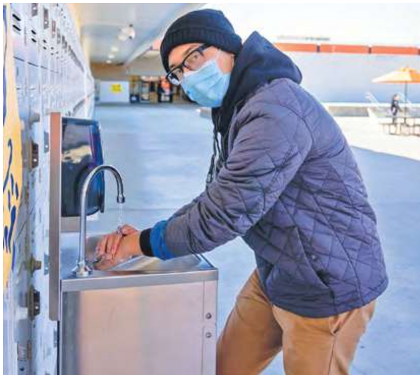
A returning student at Los Amigos uses the exterior hand-washing stations on campus.

This school year has brought many challenges that have highlighted the strength and resiliency of our students and staff. After nearly three academic quarters in distance learning in 2020-2021, our staff returned to their classrooms and took on the challenge of teaching some of our students online and others on campus. Thanks to our wonderful custodial team, our Lobos felt safe coming to campus for classes, for testing, and for athletic practices and competitions. With the support of our school district, Los Amigos was able to provide ample hand-washing stations to complement the daily health screenings, social distancing markers, and staggered bell schedules. Through it all, our students have remained committed to their academic and personal growth and our staff have gone the extra mile to support students' needs. We are stronger together, and "THIS IS MY PACK!"