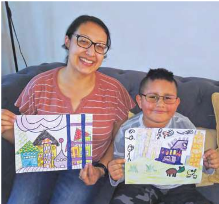
Virtual Learning Academy students enjoy many online learning activities including Family Art Night.

and career. Teachers at the VLA take pride in their ability to provide hands on learning experiences with “grab and go” science and art kits, math tools, and novel studies. In addition to the learning that happens in the online classrooms, VLA students have enjoyed Virtual Field Trips, Kennedy Center Performances, Family Game Night, Family Art Night, and a Book Tasting Event to promote literacy. Designing and testing a Zipline is just one of the many events hosted by the Virtual Learning Academy. Innovation and engagement make the impossible POSSIBLE at the VLA!