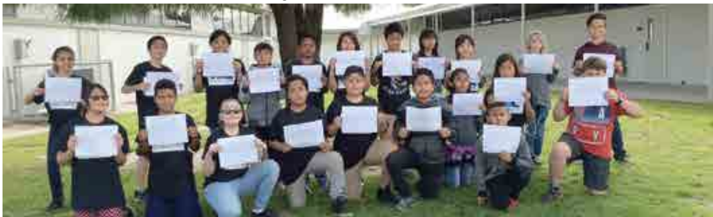
Students showcase Anti-Bullying Campaign.

climate by implementing a school-wide PBIS (Positive Behavior Intervention Support) and have newly added PAL (Peer Assistance Leadership). PAL peer leaders, in grades 5-6, help build a positive school climate through youth leadership, mentoring, conflict resolution, peer helping, service learning, and prevention activities. In February, the PAL students organized a month long anti-bullying campaign that was launched alongside the We Tip pilot which provides students and parents with an anonymous hotline to report bullying and other issues.