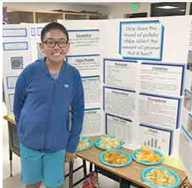
Students utilized critical thinking skills in the school's Science Fest.

Jordan Intermediate is a school that buzzes with activities and interesting courses for all students. Jordan opened a state-of-the-art STEAM lab this year, using Action Labs to allow students to experience a variety of career opportunities from robotics, engineering, and aerospace technology to forensic science, video production, and ecological sciences. The STEAM Lab is the first of its kind at the GGUSD intermediate level. Other diverse course options include digital photography, guitar, and Vietnamese Language. Jordan students are participating in the Endologix Science Fest, Academic Pentathlon, and Spelling Bee. They are taking after-school classes in computer coding, game design and production, keyboarding, culinary arts, and math. There are several new clubs this year including, Latinos Unidos, Vietnamese Student Association, Jordan Dance Club, Jordan Buddies, Math Mentors, and PAL. Jordan is a place where all students are provided with new opportunities and where we practice Respect, Responsibility and Kindness.