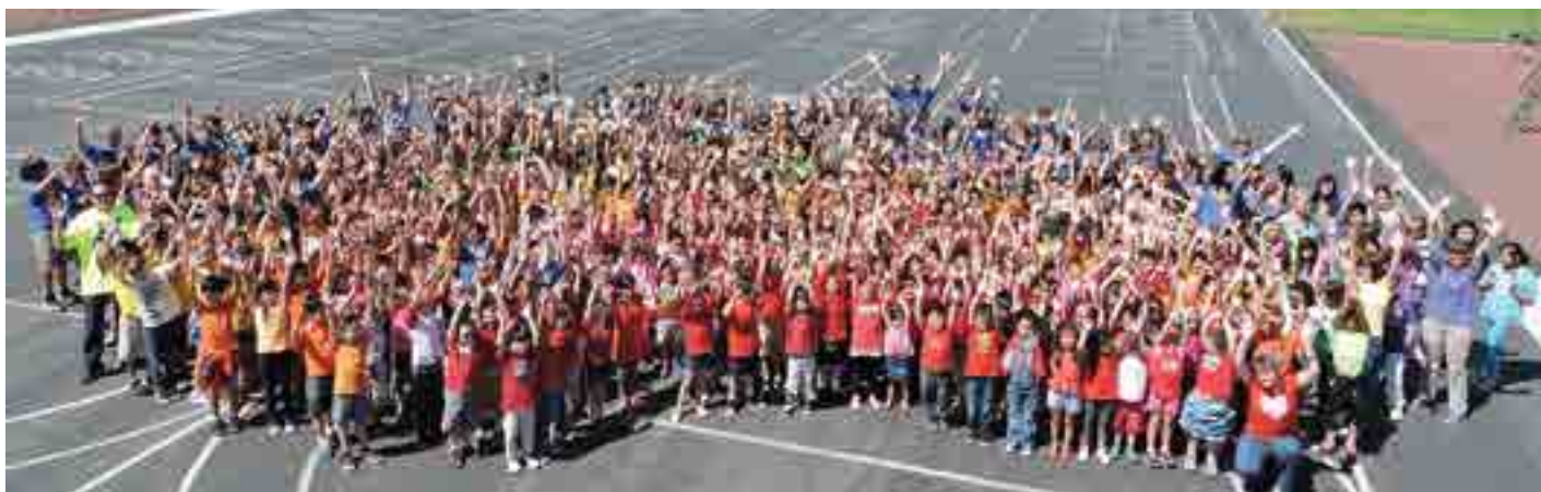
Barker students enjoy wearing colorful shirts for Rainbow Day.

are recognized each month for their hard work. Through our character awareness program, students focus on being responsible citizens and contributors to our school and community. We are fortunate to have active parent volunteers in the classrooms on a regular basis as well as for special events and activities. Recently, we installed a wrought iron fence around our school to ensure the safety of all students.