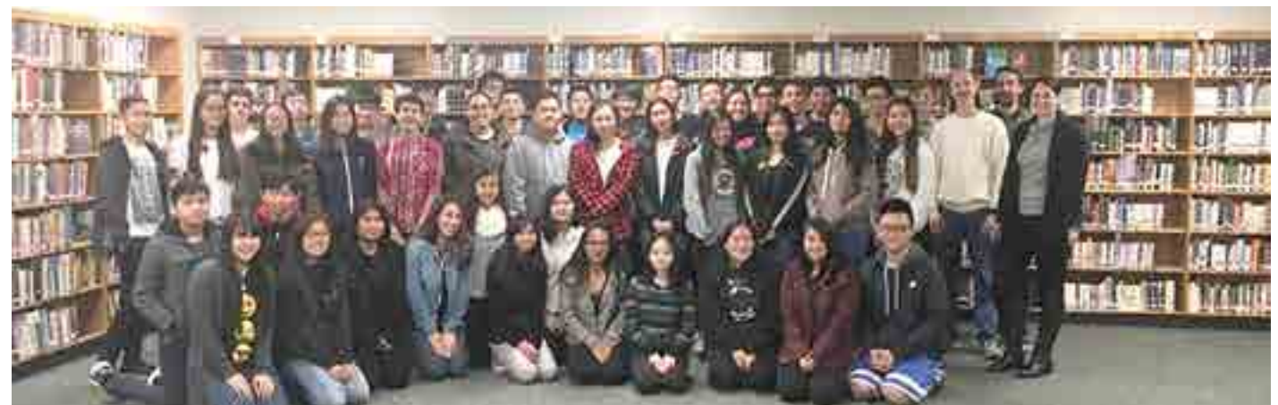
Rancho Alamitos High School freshmen enjoy earning college credit in the school's unique FACT program.

travel together through a portion of their day. In 2016, we added Advanced Placement Human Geography to the program. This is a college level course in which students learn about how and why cultural patterns differ across the globe. The science and English teachers used this new, challenging class as a focal point for their integration and support. In Spring 2016, over 85% of the students passed the AP exam, earning college credit their freshmen year and we expect a higher pass rate this year!