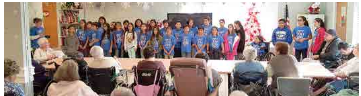
Crosby Elementary School students sing for the residents at the Chapman Care Center to brighten their day.

for working diligently all year to serve our community. They coordinated our annual Canned Food Drive and assisted the Elks Lodge in distributing the food and made donations to The Friends & Helpers Organization, which provides support for domestic violence victims. They hold regular beach cleanups and have visited the Chapman Care Center several times this year, bringing cards and singing songs to the residents. They fundraised for several years to purchase two Buddy Benches which provide a safe space for students feeling lonely or needing a friend to play with on the playground.