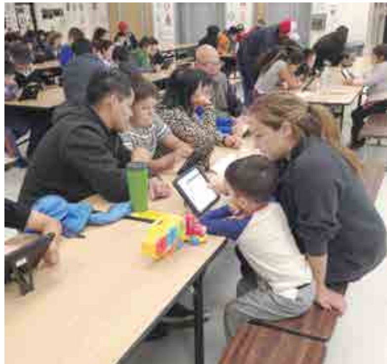
More than 40 families participated in the Faylane Family Night of Coding.

Faylane Elementary School is offering students new opportunities to gain 21st century computer science skills. With support from the Department of Instructional Technology, all students participated in the national Hour of Code activities in their classrooms. We extended the opportunity for EVERY Faylane student to have multiple experiences in this exciting computer skill by offering a Family Night of Coding. Over 40 families had a great time learning together how to code. With the idea that “every student should have the opportunity to learn computer science,” students participated in extended day coding classes, and students with interest moved beyond by attending a multi-week robotics training. Our robotics students demonstrated what they learned at a morning parent meeting, and everyone was amazed! Students continue to develop their coding skills by attending an optional Friday Coding Club, which is available to all students.