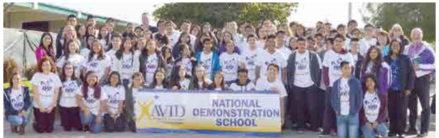
Santiago High School students and staff celebrate being named an AVID National Demonstration School.