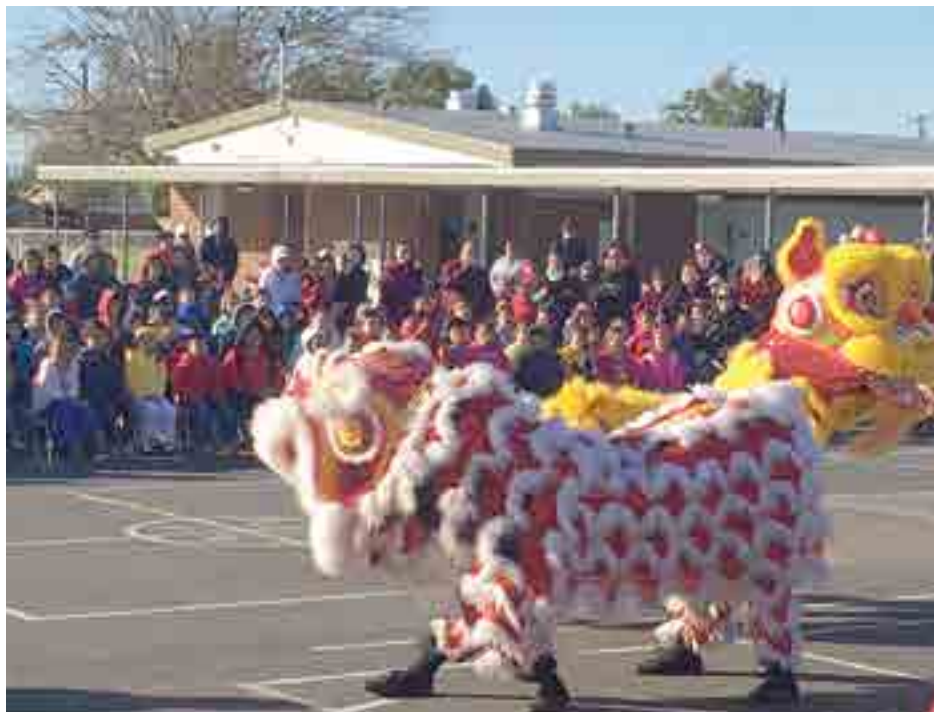
Post Elementary School hosted a school-wide celebration to honor the Lunar New Year.

What has Post Elementary School been up to during the 2016-2017 school year? Our modernization has been completed and we are enjoying our "new" school. We are really excited that by the end of this school year we will have a ratio of one computer to every student in grades 3-6 so that students and teachers will be able to access technology whenever needed. We have had our first very successful Multi-Cultural Week where we celebrated cultures from around the world. Family Fun Nights has also been a focus at Post where our families are able to enjoy fun evenings together and build relationships with other families while watching movies and enjoying our "Fun Runs."