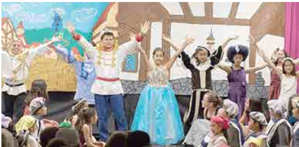
Eisenhower Elementary School students ignited the magic of fairytales with the school's production of Cinderella .

Please follow our activities by liking us on Facebook at https://www.facebook.com/EisenhowerGGUSD/