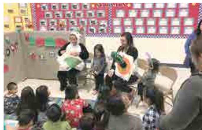
Peters K-3 staff makes storytime fun.

and problem solving skills across curriculums and also in activities such as Hour of Code, Coding and Robotics, and the Young Einsteins: STEM Lab. Students also participated in a Tet celebration in honor of the Lunar New Year, a pumpkin decorating contest, math and science night, literacy night, and a color-a-thon. Please be sure to stay up-to-date on our accomplishments by liking us on Facebook at Peters K-3 Elementary School.