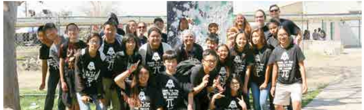
Ralston scholars celebrate their love of math with Pi Day.

our academic focus, scholars participate in activities, like our recent Pi Day Celebration, and school spirit days. Monthly advisements support our school-wide focus of promoting a growth mindset, scholarly habits, respect, study skills, and much more. Our scholars also attend our after school academic program called A.S.P. to complete assignments, receive support from teachers and college tutors, study, and collaborate. Ralston Scholars are having a fantastic year! Thank you to staff and parents for their continued support.