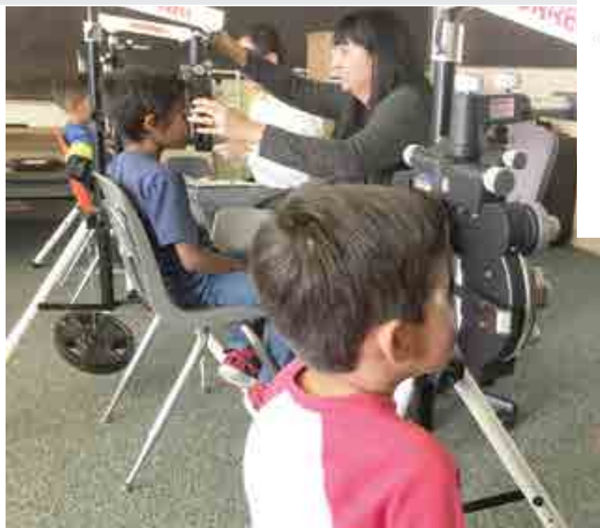
Woodbury scholars receive free eye exams.

Woodbury scholars have been part of many exciting accomplishments and healthy programs this year. Students gained 21st century technology skills in a new after-school program where they learned computer science coding while applying mathematical algorithms to program robots. Additionally, our sixth grade scholars are participating in a six-week college career mentor program. This year, every scholar received a free dental check-up and dental work with Healthy Smiles, as well as a free eye examination and glasses through the generosity of the Essilor Vision Foundation-Kids Vision for Life. All scholars take part in the 100 Mile Club and Harvest of the Month, trying a new fruit and vegetable and exercise class each month. Woodbury scholars enjoy giving back through our annual food drive and we donated over 1,200 pairs of socks to the homeless.