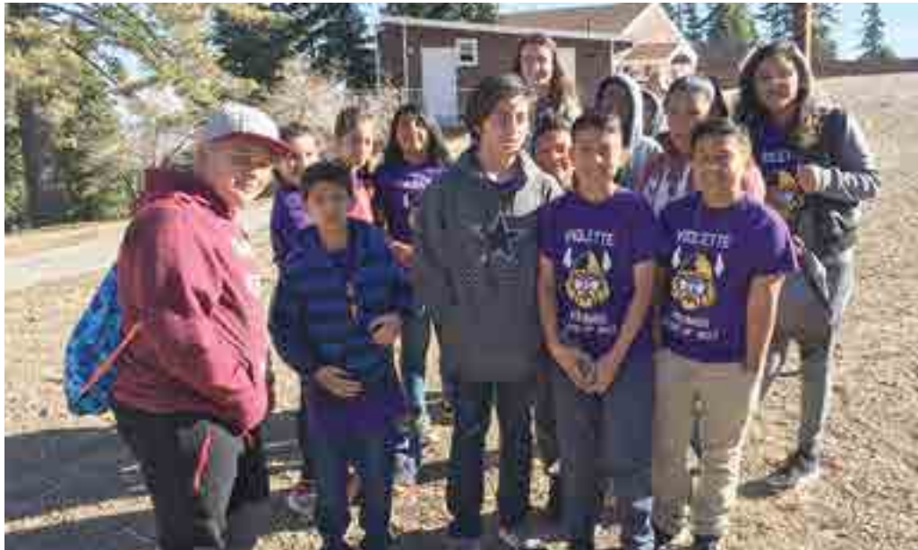
At Science Camp, students enjoyed learning about the environment, habitats, astronomy, and making lasting memories with friends.

very proud of our sixth graders and their families for their fundraising efforts which allowed our sixth graders to go to The Pali Institute for science camp.