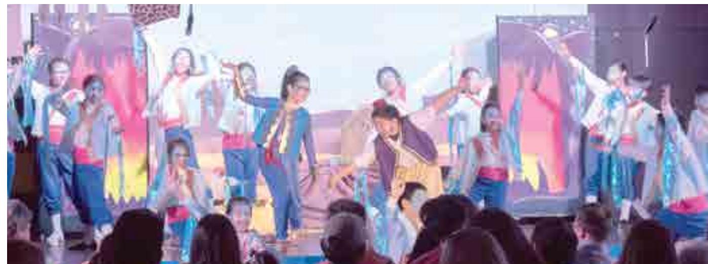
Students wowed audiences with their production of Disney's "Aladdin."

honors in the Orange County Academic Pentathlon for the past four years. The Allen community also takes great pride in providing our students with a foundation in the arts and local culture. Allen students and their families participated in our annual Lunar New Year celebration, and we just finished our second year of Disney Musicals in Schools with our production of "Aladdin."