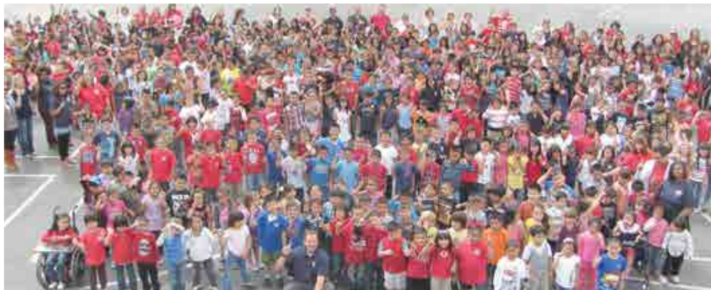
Parkview Elementary School offers a supportive and nurturing culture to equip all students for success.

efficacy and proficiency. Our school has been named a California Business for Educational Excellence Honor Roll School for two years. Thanks to more than $140,000 in grants, Parkview offers one-to-one technology to ensure that all students from first through sixth grade, including general education and special education students, have access to technology devices to support 21st century learning. Our parents actively support our school to give students a positive educational experience and help pave the way to a bright future.