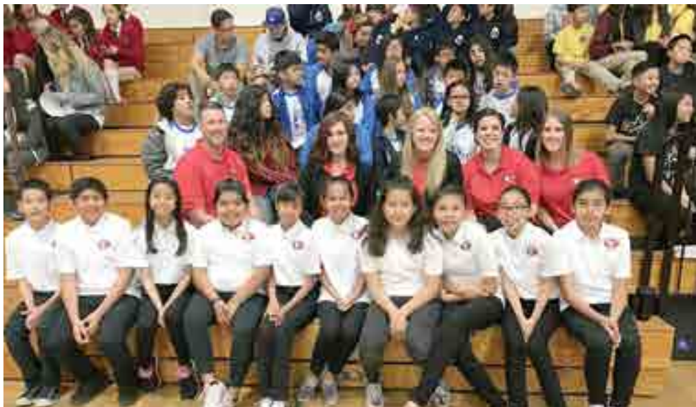
Heritage Elementary School students enjoyed competing in the county's academic Pentathlon.

We are also proud to have our first pentathlon team with members who are shining examples of the character strengths of our school.