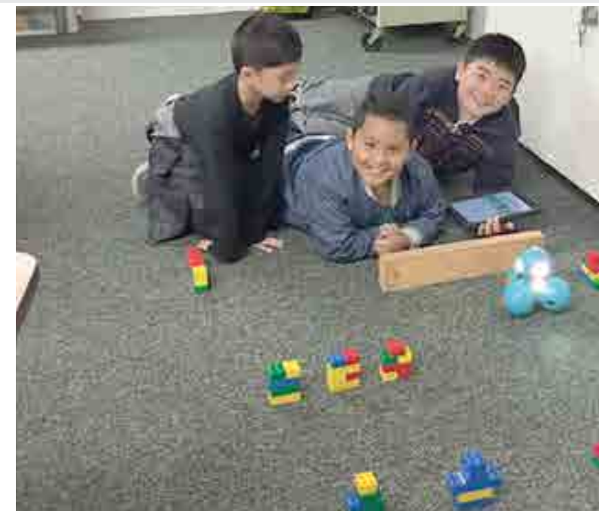
Evans students enjoy problem solving in the after-school Robotics Club.

Evans Elementary School students are working to meet their academic and personal goals, learning what it means to have a growth mindset, and encouraging one another as they work through academic challenges. Teachers are working hard developing lessons that challenge and inspire critical thinking. One of our most popular activities this year has been our after-school Coding and Robotics classes. Students get hands-on experience coding while working on the skills of teamwork, communication, and problem solving. Our annual Spring Math & Science Night is also popular. This year, the event featured Orange County Astronomers who brought high-powered telescopes for viewing of distant planets and stars. These are just a few reasons why Evans is a great place to learn!