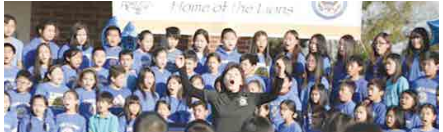
The Cook choir performed at the school's national blue ribbon celebration.

Stay in touch with the Cook community through our website.