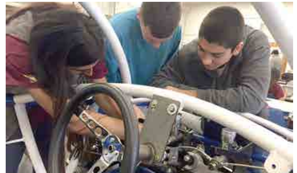
Bolsa Grande engineering students assemble an electric vehicle.

Students are demonstrating innovation, critical thinking skills, and teamwork, proving themselves to be career ready.