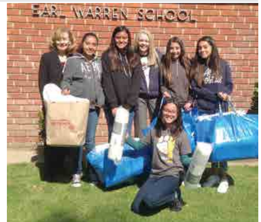
Warren Elementary School students collect pillows to donate to families in need.

Warren Elementary School staff and parents united for a program called P.I.E. (Partners in Education). Parents spend time learning content, observing instructional strategies, and gaining resources to help support their child's academic growth at home.