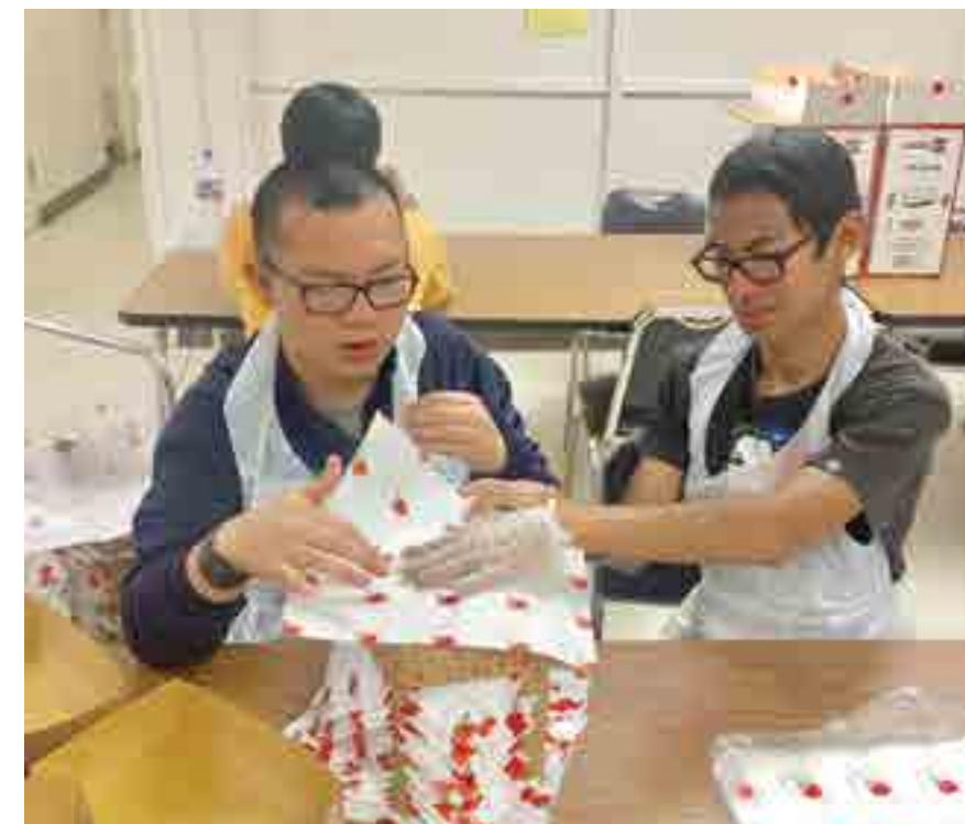
Jordan ATP students learn vocational skills by volunteering in our school kitchens.

The Adult Transition Program at Jordan utilizes community based instruction to build our students' functional independence skills with the goal for them to have a successful transition to life after school. We pride ourselves on the positive relationships we have built with local outside agencies to ensure the individual needs of our students are met when placement decisions are made upon exiting the public school system. A couple of our most popular student activities include accessing the community on the OCTA public transportation system and gaining valuable vocational skills volunteering throughout the district's intermediate school kitchens. Our students strive to learn new work skills, plan bus routes, and manage money to build on their future opportunities to gain employment and live as independent as possible.