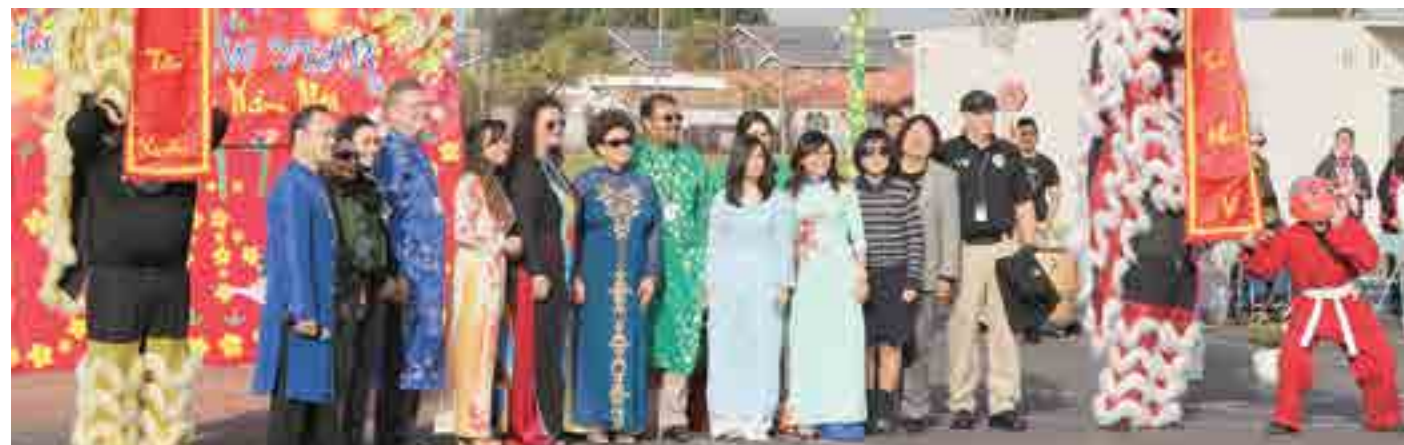
Lawrence Elementary School held a special event to celebrate the Lunar New Year.