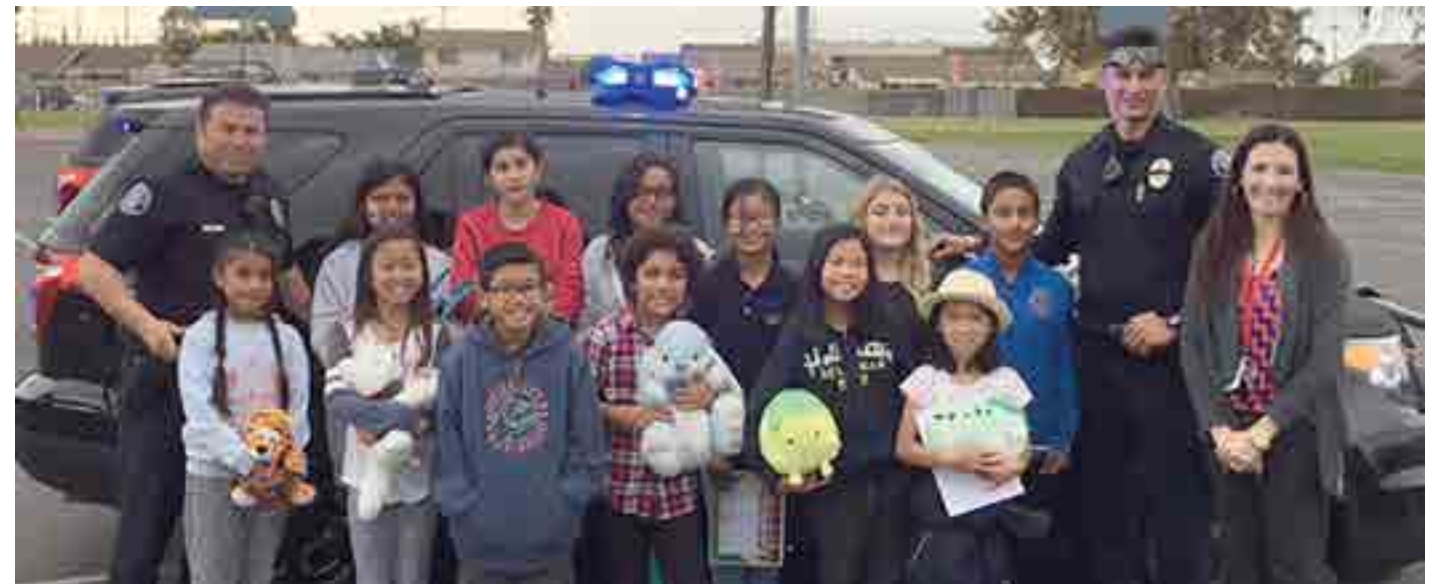
Marshall Elementary School enjoys a wonderful partnership with the area police department.

with morning announcements, school events, Friday Flag ceremonies, school sales, and student leaders share ideas on how to improve the school experience for all students. Our Yearbook Committee works hard all year long taking pictures of school events and formatting our annual yearbook. Our sixth graders are practicing their softball skills to compete against Allen, Carrillo, and Murdy schools in our annual softball tournament. Students enjoy programming, coding, and science experiments in an after-school club called BrainstormSTEM.