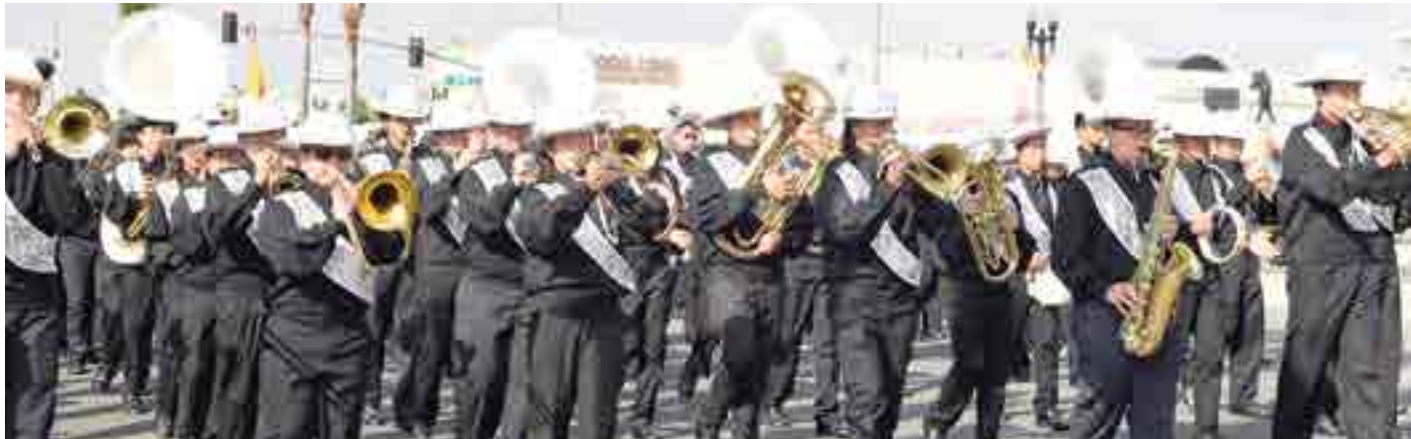
McGarvin Intermediate School's marching band celebrates the Lunar New Year in the community Tet parade.

to an outstanding art program with many of our artists receiving awards and recognitions. We are in our first year of offering STEAM (Science, Technology, Engineering, Art, and Math) courses and developing the infrastructure to support these classes. McGarvin students stay busy and have many opportunities to participate in extracurricular activities such as intramural sports, 3D Printing Club, Hip Hop Club, Cooking Club, Yoga Club, Writing Club, App & Game Development Club, and Craft Club.