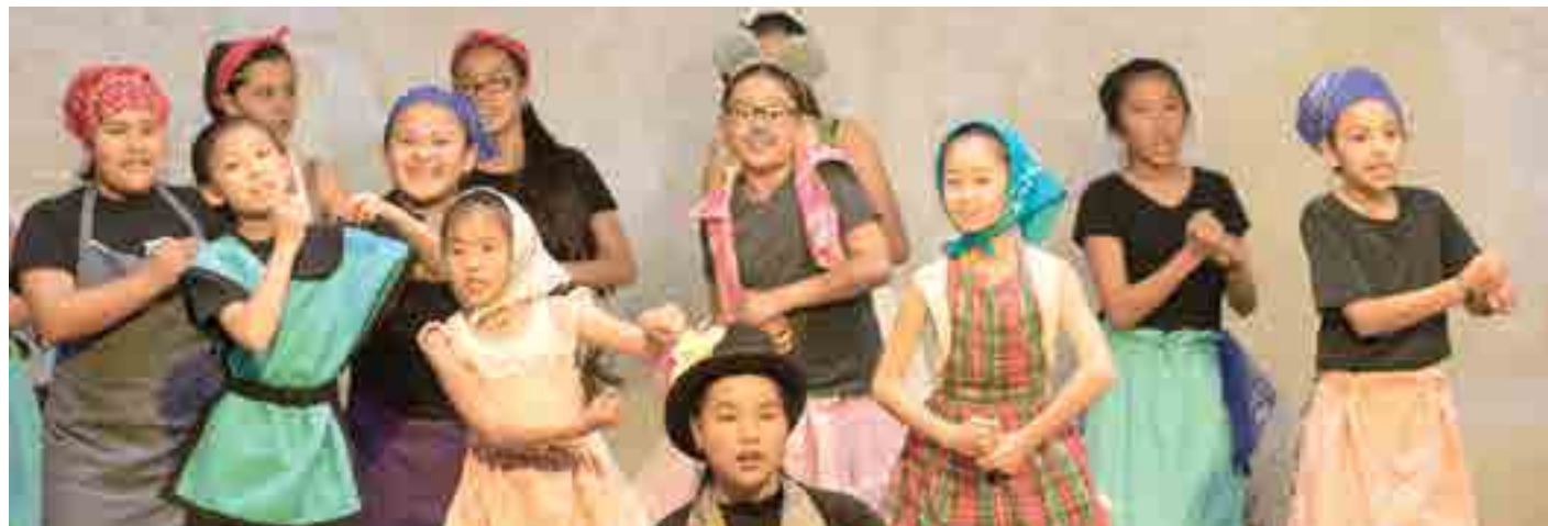
Hill Elementary School students recreated the magic of Disney with the school's production of Cinderella .

before or after school to make an impact on the progress of struggling learners. The special and general education teachers are celebrating their strong collaboration with fifteen students changing placement to a less restrictive teaching environment. Students and staff are keeping our positive school climate by implementing a character program this year. Stay up to date by liking us on Facebook @HillHoundsGGUSD.