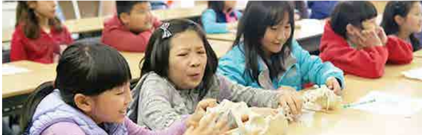
Excelsior Elementary School students enjoyed hearing from real-world professionals during Career Day, including a chiropractor who brought in props to help explain the chiropractic practice.

Students were able to hear about the skills and schooling requirements for each career. Each presenter also shared about how they had to persevere or solve problems in their career. A few other enjoyable activities this year were our sing-a-long where all classes performed, and our PTA jog-a-thon where students were encouraged to practice perseverance. I’m proud of our students’ hard work and success and thankful for our supportive staff and parents.