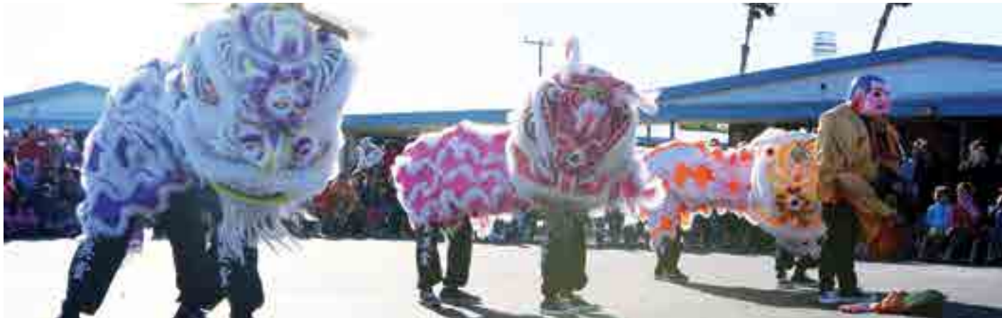
The school hosted a festive Tet Celebration in honor of the Lunar New Year.

In addition, as a school, we have celebrated the diversity of our community with a wonderful Tet and Cinco de Mayo celebrations for our students and families. Thank you to our Anthony parents for your fundraising efforts to make Anthony a fun place to learn and grow. We appreciate and enjoy your parental presence at our Friday Flag Deck where we celebrate our school and student successes and reinforce positive behavior, scholarly habits, character traits, and much more.