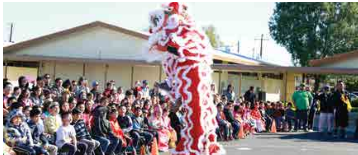
Stanford Elementary School students enjoy the dragon dances at the school's Lunar New Year celebration.

academic discourse with an emphasis on listening and speaking skills. Well done to our sixth grade students and coaches for having two teams participating in the countywide Pentathlon. Our students enjoyed cultural school activities such as a Tet Festival of Friendship in honor of the Lunar New Year and a Cinco de Mayo celebration with dances of the Aztecs. For the second year, we have successfully implemented the school-wide Positive Behavioral and Intervention Support (PBIS) program. A special thank you to our Stanford PTA and parents for all of their fundraising efforts and support. Congratulations to all staff and students for their hard work, accomplishments, and caring attitude.