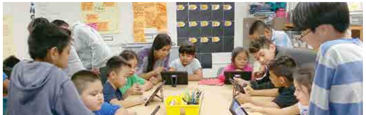
Hazard sixth graders teach younger students about computer science.

Engineering and Project-Based Learning in Math and Science prorams. Monthly parent meetings are designed as opportunities for parents to learn the uses of technology along with the curriculum and instructional practices occurring in the classroom. Students provide testimonials and training for parents during these meetings. We are proud to share that Hazard fosters a community of learners that includes staff, parents, and students!