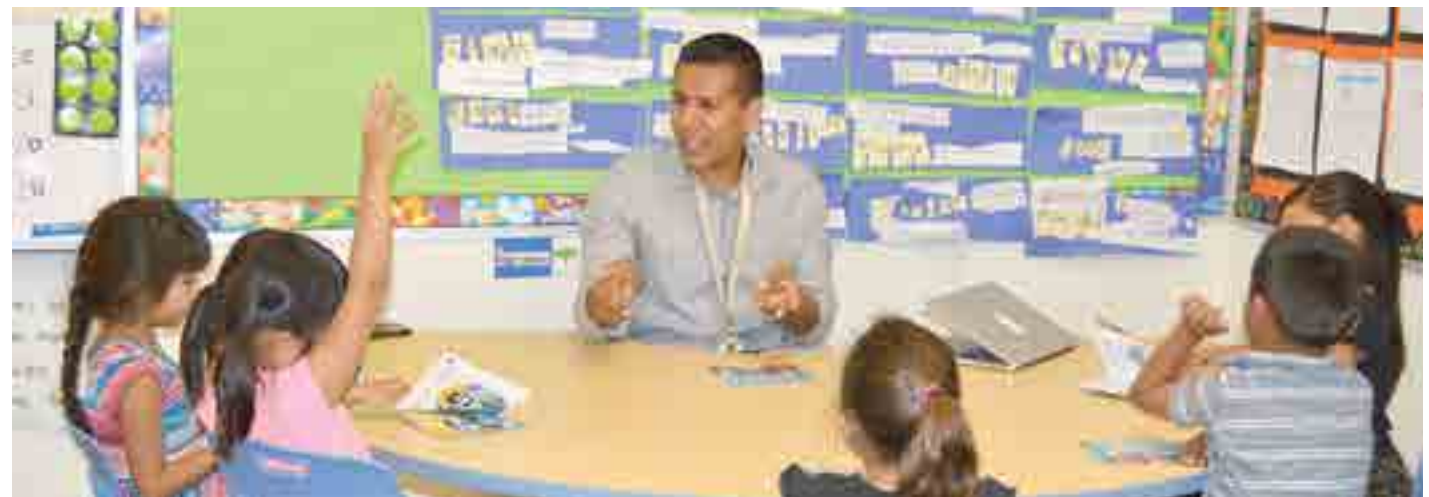
Students at the Monroe Language Academy are making great strides on their pathway to biliteracy.

have an opportunity to receive their "Pathway Towards Biliteracy" award this year by meeting certain criteria set forth by the OC Department of Education. These benchmark, or pathway, awards are designed to recognize students and encourage the pursuit of language skills in two or more languages. Further, the Pathways to Biliteracy Awards affirm positive attitudes towards biliteracy, and validate the use of multiple languages for all students.