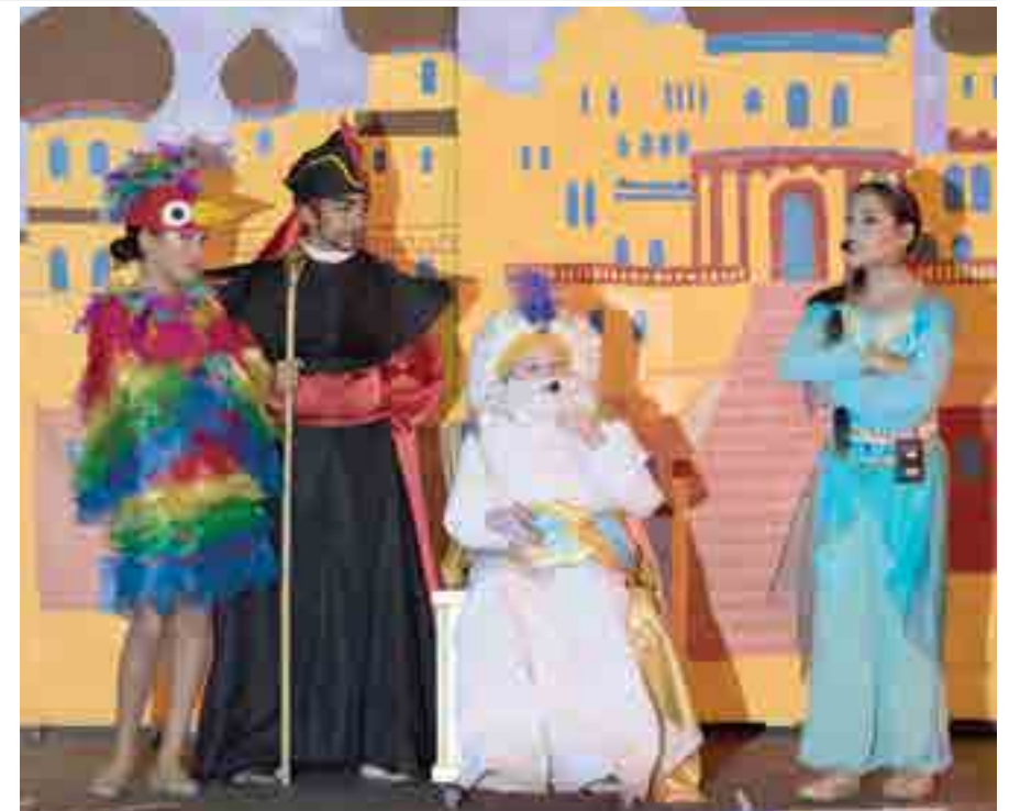
Stanley students wowed audiences with the school's production of Aladdin.

the infrastructure, which includes air conditioning every classroom, and moving the classrooms towards 21st century learning. For the second year Stanley students had the opportunity to work with Disney Musical in Schools to continue the journey towards a sustainable music theater program. The students, with the support of teachers and parents, engaged the audience in the wonderful world of Aladdin Weeks spent at the TGP lab and the Irvine Ranch Outdoor Education Center gave Stanley scholars the opportunity to engage in hands-on scientific exploration. Students at Stanley continue to demonstrate that they are proud, respectful, responsible scholars.