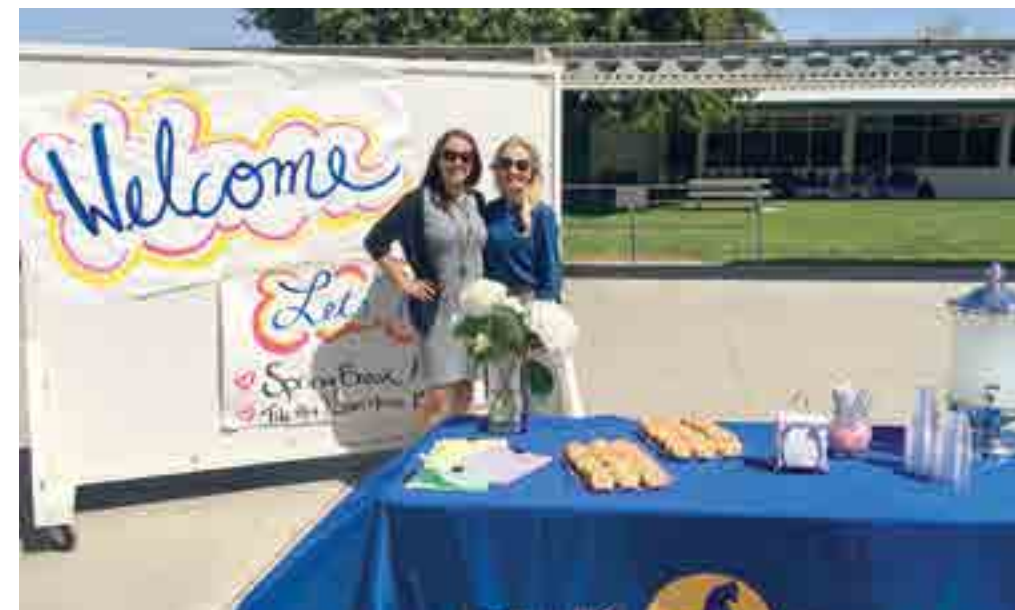
Enders Elementary School encourages parent engagement in school activities.

enrichment activities. Enders students and staff enjoyed participating in our campus beautification project. Our most recent endeavor is our tile art, fostering school pride and a positive culture.