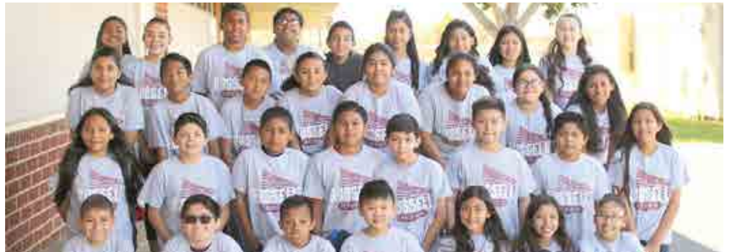
Russell Elementary School sixth graders look forward to putting their academic skills to the test.

math, science, and social science. Prior teams from Russell have earned first place overall for their division while also earning 48 individual medals. This year's Pentathlon team has been guided by our dedicated teachers and our student scholars have demonstrated excellent commitment to prepare for this year's competition. We are proud of their hard work and wish them all the best in this year's competition!