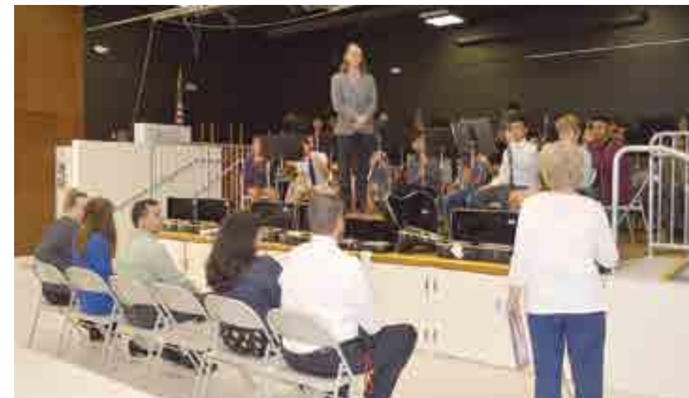
Lake Intermediate School received a generous donation for new instruments from the Orange County Philharmonic Society.

County Philharmonic Society chose Lake to be the recipient of their "Strike-Up the Band" grant. This program is designed to invest in schools that are doing great work, but could use more resources. Lake received $9,400.00 in musical instruments.