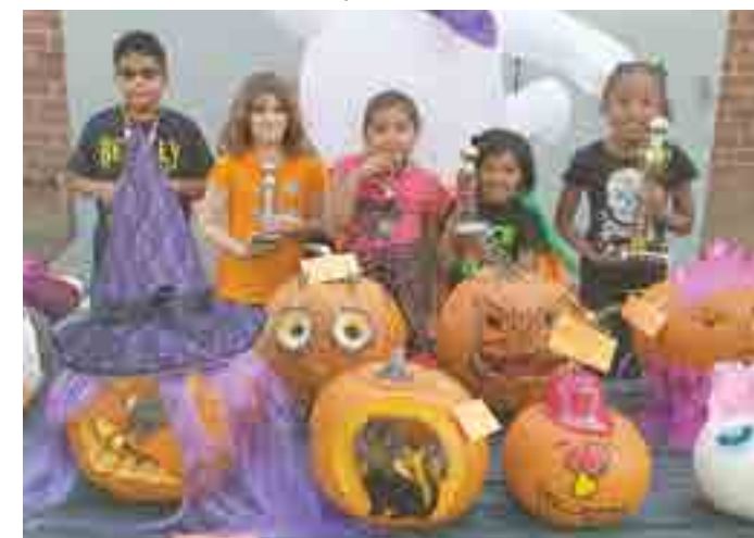
Students get creative in pumpkin decorating contest.