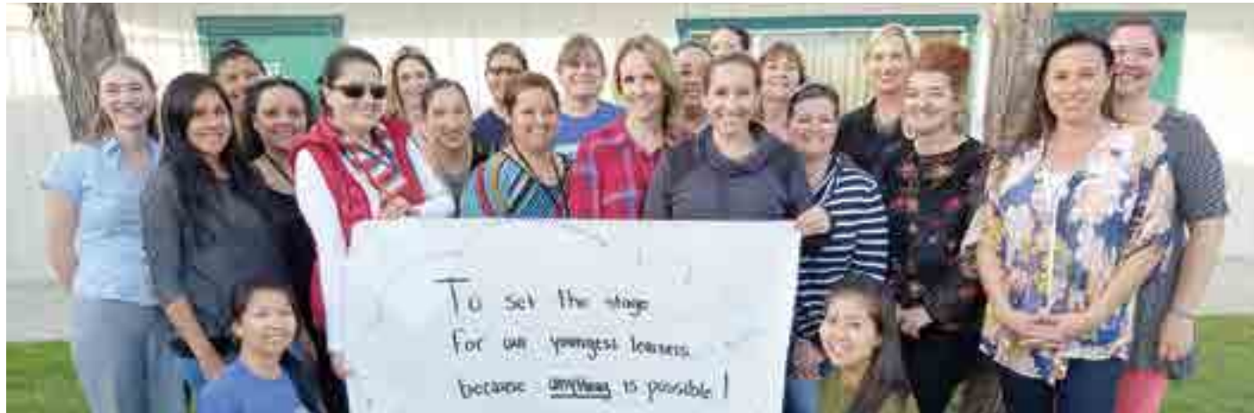
Preschool teachers share their love of teaching.

quality program! Our teachers have had the opportunity to participate in Early Childhood Education conferences and trainings, as well as an ECE STEM Symposium. They have implemented many of the wonderful ideas from these workshops into our classrooms. With our QRIS funds we have purchased STEM materials to enhance our curriculum. All of the wonderful things happening in our classrooms are ensuring that our students are ready for TK and Kindergarten next year!