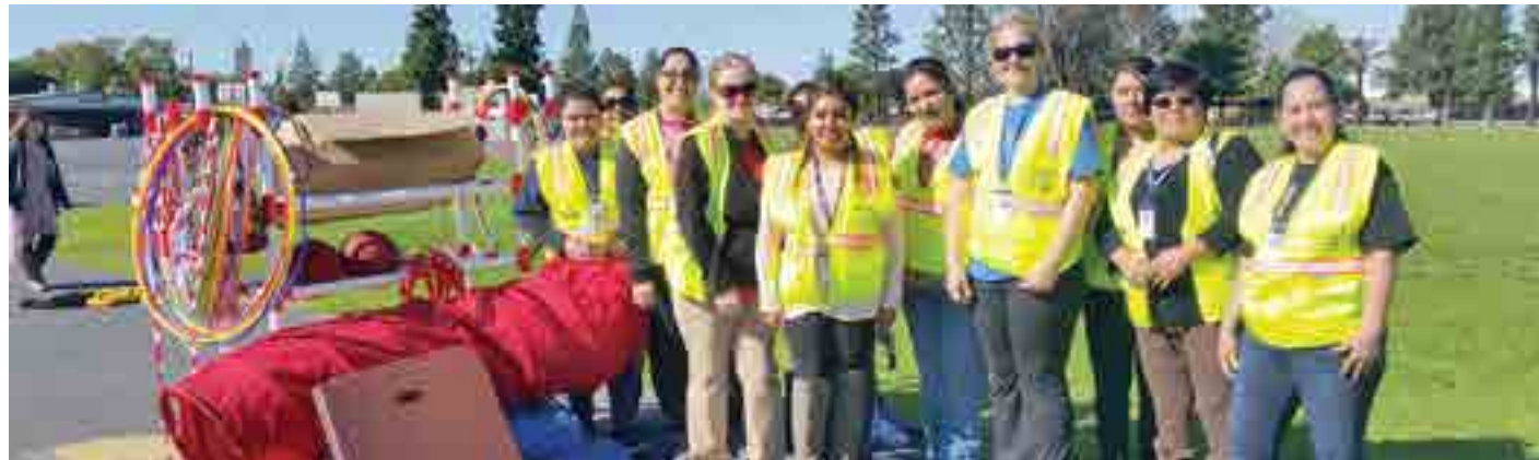
Parent volunteers offer fun activities to students during lunch and recess.

Many teachers remain in contact with students into their adult years and have seen that well-rounded students become responsible citizens. We are so proud of our current and past students who are out in the world making great choices!