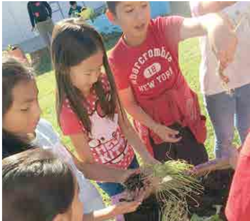
Students learn about nutrition with the school's Teaching Garden.

Peters 4-6 students and staff continue to celebrate our recent achievement of being recognized as both a California Gold Ribbon school and a Title I Academic Achievement school in May 2016. Students are engaged in a variety of exciting activities, including Coding and Robotics and Spanish Language Enrichment. We will have 30 students compete in Division 1 at the county's Academic Pentathlon. Students, teachers, and parents joined together to raise funds for 220 sixth grade students to attend Science Camp. Lastly, our Teaching Garden, supported by the American Heart Association and Whole Foods, continues to be a great resource for students to learn about health and nutrition. Our entire school community has come together to plant and care for the garden, harvesting the vegetables for a farmers market!