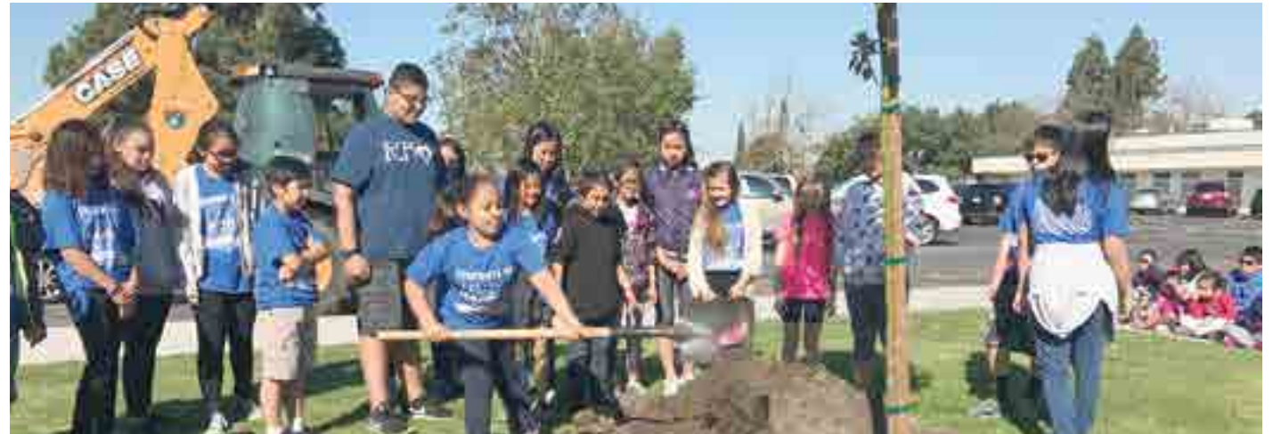
Morningside students enjoy planting their new community garden.

teaching staff has done a wonderful job with our new curriculum and students are enjoying the stories and working online in the classroom and at home. The new year has brought on many great activities by our PTA and our families have enjoyed our annual winter nights and movie nights. We will be planning our end of the year activities to say goodbye to our wonderful sixth graders as we help them prepare for intermediate school and beyond.