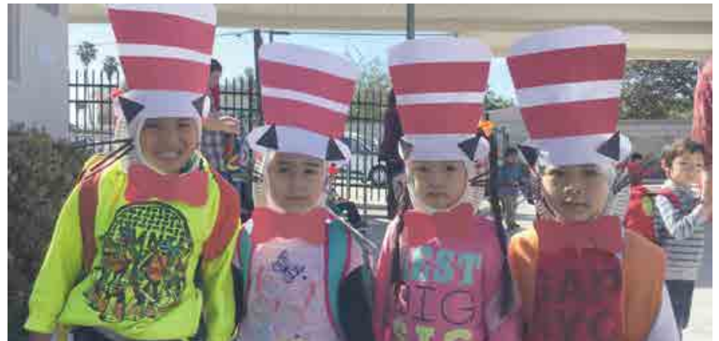
Students explore their love of reading by playing the part of Dr. Seuss.

needs in a fun, safe, and nurturing environment. We have enjoyed some fantastic family events, including our second annual Halloween parade, winter concert, and movie nights. We look forward to planning many more opportunities for our families to participate in during the upcoming school year.