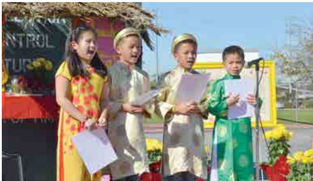
Zeyen held a special school-wide assembly to celebrate the school's rich cultural diversity.

Family Nights and Hour of Code are popular events. The Zeyen community celebrates its diversity through our Heritage Language programs, Tet Celebration, and annual Mother's Day Festival. Student athletes have many opportunities to participate at Zeyen with Kids Run the OC, Reebok's BOKS Kids program, and Parents in Action. Our cadre of parent volunteers lead recess games, conduct fundraisers, and host engaging family events.