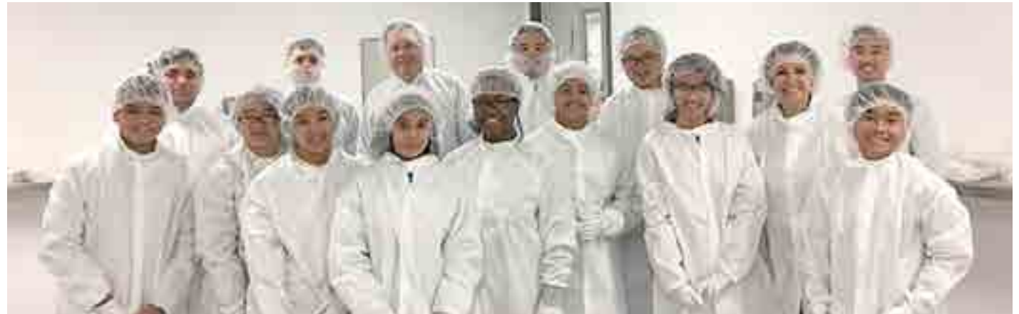
Fitz Intermediate School students tour Endologix, a biomedical engineering company headquartered in Irvine.