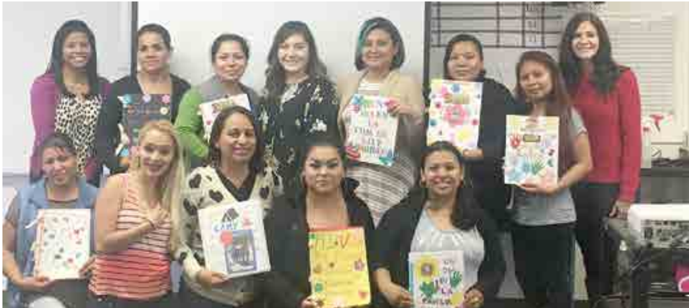
Parents create memory books in the Latino Family Literacy Project

teaches and encourages parents to read with their children in English and/or Spanish and establishes a successful family reading schedule at home. Parents create a memory book aligned with the themes of the books read. The celebration included a sharing of the family memory books created, a brunch, and guests from the GGUSD Community Outreach Center.