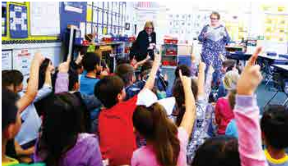
Students celebrated the birthday of Dr. Seuss for Read Across America Day.

Technology Engineering and Math) activities, and sharpening their presentation skills through the use of instructional technology tools like Google classroom. We were fortunate to receive grant money, which was used to purchase additional classroom technology. Our dedicated staff and PTA provided a variety of student activities: Art Masters; Million Word Club; Dance Through the Decades; a kindergarten and first grade Thanksgiving performance; sixth grade volcanoes & chicken mummification; Be Brave, Be Safe; Read Across America; Pentathlon; Reflections; and First Impressions Art Show.