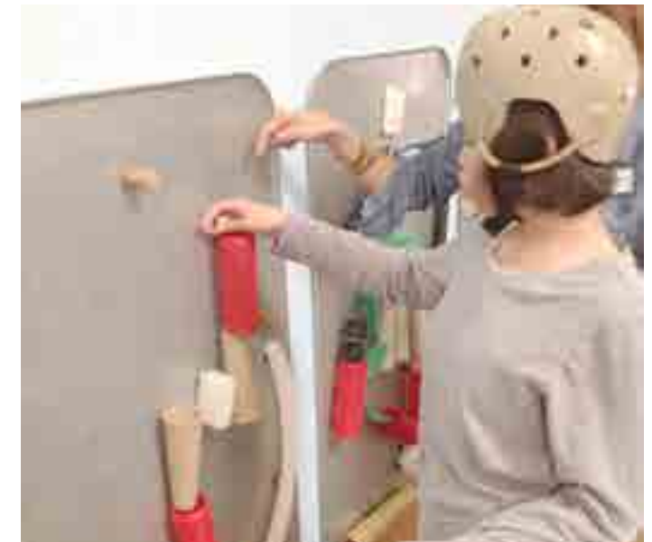
Students work on gross motor skills and problem solving.

The Special Education Center at Mark Twain serves students ranging from kindergarten through Adult Transition. Our students have severe to profound disabilities with multiple eligibilities for special education services. We emphasize instruction and piloted curriculum that has now been adopted by our school board for all moderate/severe disabled student classrooms district wide. Our staff is thoroughly trained by our nursing team, which includes a full time licensed vocational nurse, to best support our medically fragile students. We strive to identify students' strengths and areas of needs and have implemented numerous assessment tools. We believe that behavior is communication. Through listening to behavior and introducing innovative technology, our students have been given a voice by making choices.