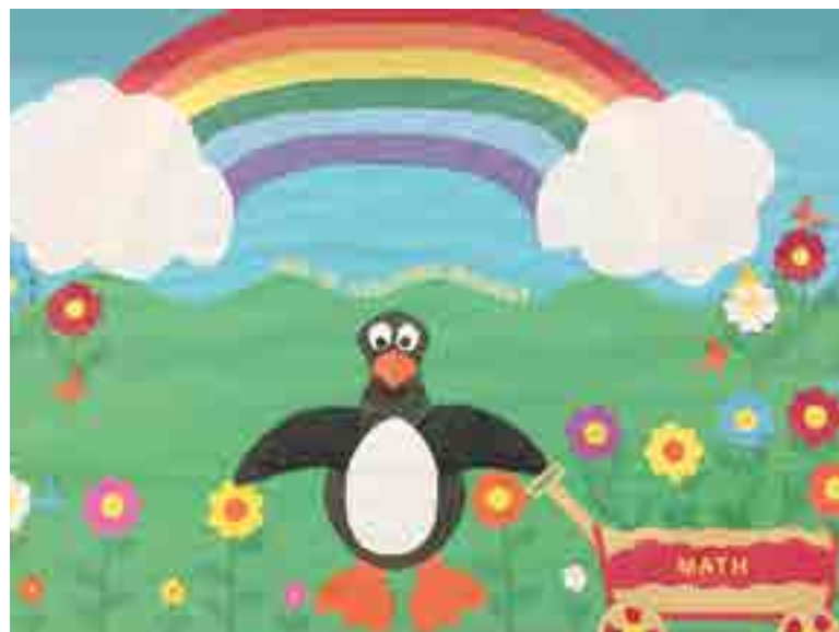
Jiji the penguin reminds students about the importance of math.

Bryant Elementary School has made exciting progress toward building a positive Math Mindset. This year, all Bryant teachers participated in Irvine Math Project ( http://sites.uci.edu/irvinemathproject ) lesson studies to refine their understanding of the new standards and reflect on their delivery of the research-based, hands-on lessons. Additionally, Bryant has partnered with ST Math to extend math learning beyond the school day with game-based instructional software designed to boost math comprehension and proficiency through visual learning. Bryant's PTO has embraced our school's math focus by creating a beautiful ST Math bulletin board in our MPR celebrating Spring with Jiji the Penguin, the star of ST Math. Please be sure to stay up to date on our accomplishments by following @BryantGGUSD on Twitter.