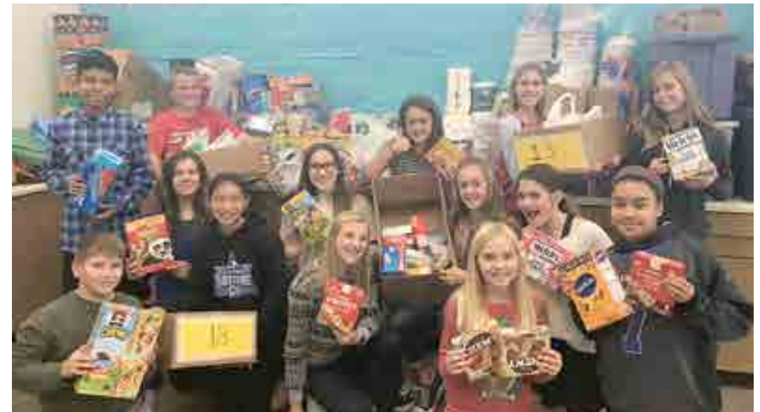
Bell students collect food for the Ronald McDonald House.

cards for senior citizens living at our neighborhood retirement home, and making special blankets for children battling cancer. We are proud of our students becoming well-rounded individuals and learners.