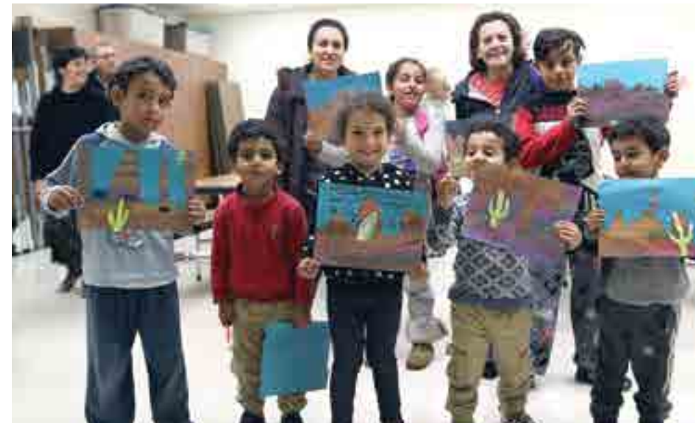
Northcutt students and parents enjoy Family Art Night.

the most correct answers are recognized during one of our assemblies. These activities and many more are geared towards connecting our parents to our school and building school spirit.