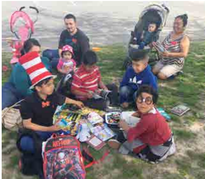
Mitchell Elementary School students celebrate Read Across America Day.

Mitchell became a Positive Behavioral Interventions and Supports (PBIS) school this year. Teachers have created instructional strategies around positive behavior skills, just as we teach academic skills, and developed a school-wide incentive program. In addition to PBIS, Mitchell has also created monthly Character Awards and "Music Fridays". These efforts combined with engaging classroom instruction have made Mitchell a "fun" place to be!