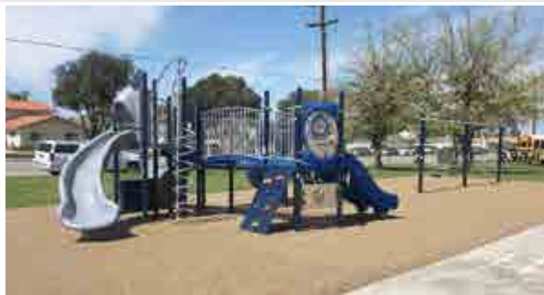
In April, Paine Elementary School held a ribbon-cutting for its brand new playground equipment.

It has been a wonderful year for students, staff, and parents at Thomas Paine Elementary. After a year at a temporary site, we returned back to a completely modernized campus. Our classrooms are now equipped with new technology, fixtures, and air conditioning. We also have a new kindergarten playground. The Paine staff is proud of our new campus and takes every opportunity to welcome the community to our regular music performances, parent meetings, and student events. Thomas Paine continues to provide the best possible academic opportunities to all students. We take pride in our outstanding overall state assessment scores. We offer academic interventions to give students