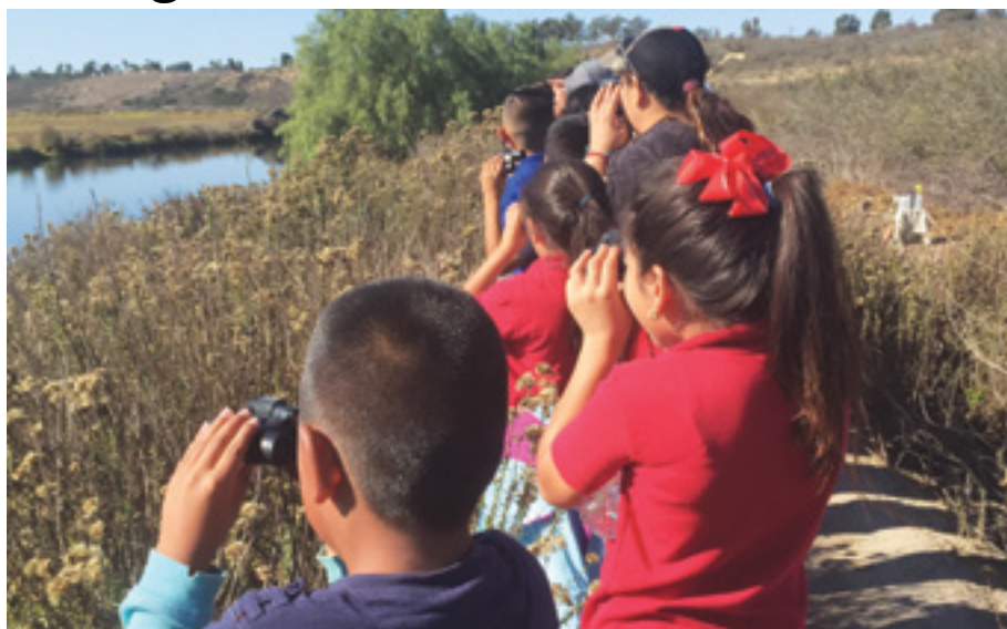
Third-grade students enrolled in the Inside the Outdoors' Wild Wetlands program.

Today, technology has emerged as a primary frontier of childhood exploration. But while there are