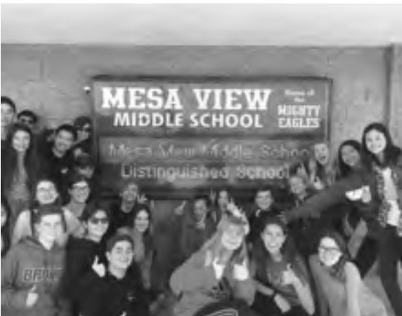
Mesa View students help celebrate their school's designation as a 2019 California Distinguished School.