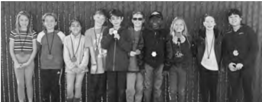
Fourth and fifth grade student winners of the Lake View Science Fair

We are so proud of our Lions' fearless drive to succeed!