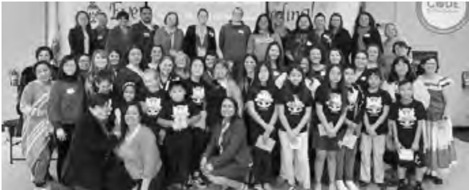
CABE Site visit to Willmore

Thank you to our amazing PTA and parents for planning and organizing a memorable, cultural experience for our visitors. We are proud to offer our students, families, and community the opportunity to become multi-literate, multilingual, and multicultural, giving our students the advantages they need in today’s competitive global society!