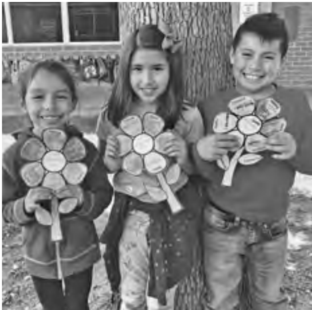
2nd graders with their Mindful Strategies

Golden Elementary sixth-graders attended Emerald Cove Outdoor Science School in April. It was an incredible week in the San Bernardino Mountains at Green Valley Lake, with all of our sixth-grade teachers in attendance! Students participated in daily hikes, science lessons and team-building activities with their cabin mates. In addition, sixth-grade campers worked together to ensure that the camp was left in better condition than when they arrived. Students