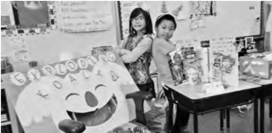
3rd grade Boomtown Business Owners setup shop prior to rush of customers arrival.