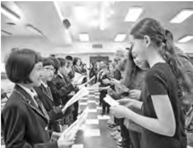
Eader and International School Letter Exchange

Following the performances, the Tianjin students visited our second- through fifth-grade classrooms to participate in an interactive activity with our Eader students. The students all truly enjoyed getting to know each other and sharing their cultures.