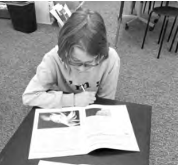
Golden View students learn California EEI curriculum as part of environmental science program.

The California Education and the Environment Initiative (EEI) Curriculum is a powerful, state Board of Education-approved instructional resource that helps educators teach to state standards in science, history-social science, and English language arts using the environment as context.