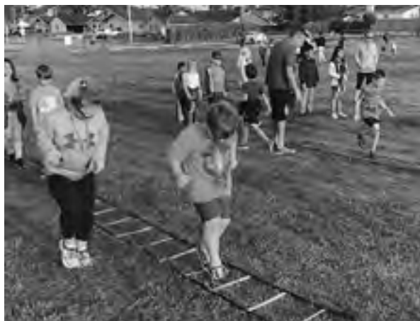
Hope View Athletes training for the Kids Run the OC Marathon

Fourth- and fifth-grade Gifted And Talented Education (GATE) students participated in an experiment to measure gravity and force, led by a retired University of California, Los Angeles professor and volunteer. Our students predicted and calculated the force of gravity by measuring the fall of projectiles launched by parent volunteers.