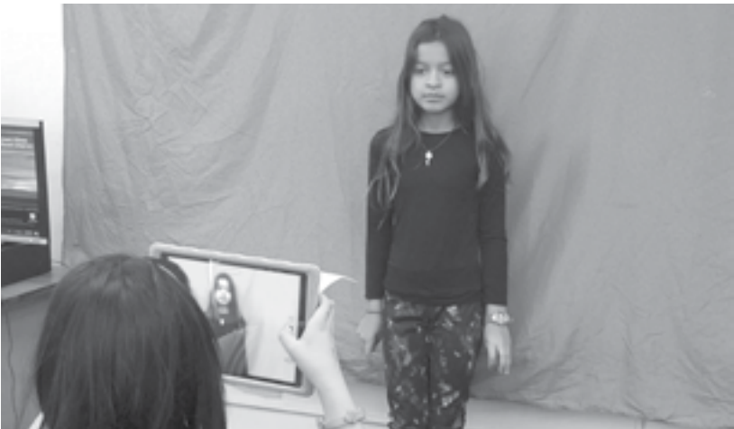
A Westmont student demonstrates the use of green screen technology in presenting video reports.

Actors or presenters stand in front of a green screen that magically transports them over a projected image or animation using specialized software.