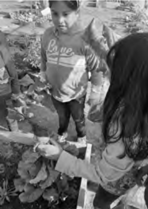
Look at the size of this radish!

No matter what the season, the Learning Garden is always a busy and beautiful place!