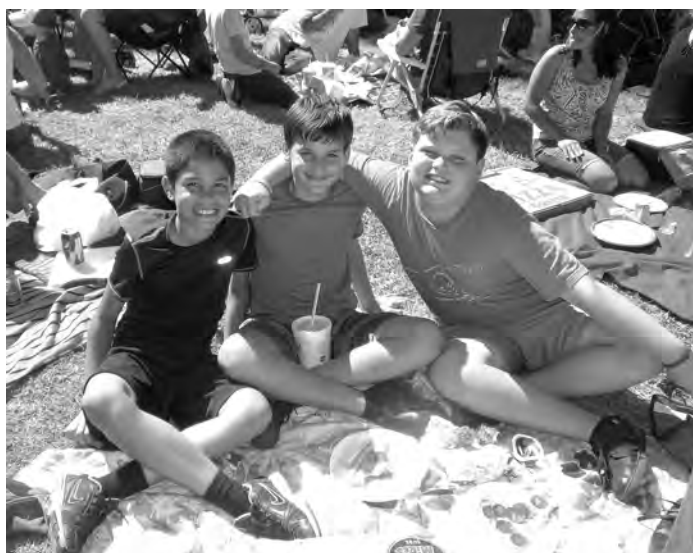
Lunch on the lawn.

and staff to improve education by supporting staff, encouraging students and creating a sense of community.” It’s a win, win for everybody—parents, families, staff and most importantly, the children. It’s not too late to join PTA—you can become a member today!