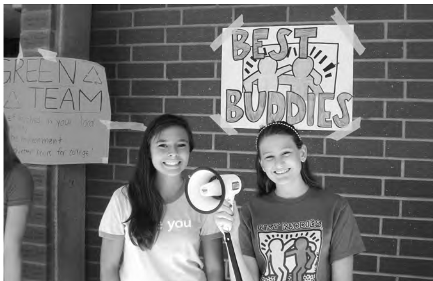
Join Best Buddies

Edison students involved in more than academic studies are happier and more community-service oriented. Year after year, our most successful students pride themselves in being a part of school clubs and access groups. This is a proud tradition we carry on for the 2012–13 school year.