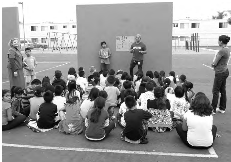
DeMille 3rd graders learn how to be S.M.A.R.T. on the playground!

The PRIDE staff and students did a wonderful job of showing our DeMille students how to be S.M.A.R.T.!