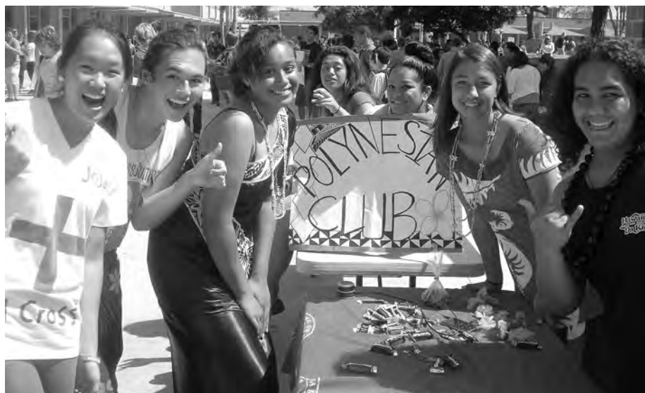
Join a Club