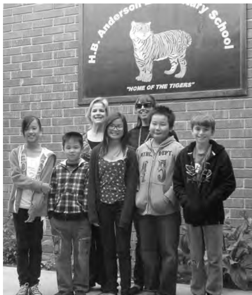
Anderson Student Council 2012/13

At the same meeting they also voted to work with the staff and PTA to host the school's first Trunk or Treat Event. This successful happening provided a space for Halloween fun for the children to laugh together and celebrate the fall holiday. Anderson students showed up with their parents and siblings to ring in the season and say "Goodbye" to the summer.