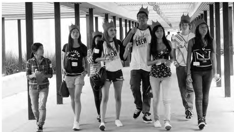
Link Crew leaders giving freshman students a tour of the campus.

Link Crew Leaders provided a list of what they believe every freshman needs to know at WHS before going on a tour of the campus. Food and refreshments were provided for every freshman and Link Crew Leader at the end of orientation, and freshmen were invited to return in the evening for a carnival and dance. ASB and Link Crew collaborated closely to bring Lions in the Making, a carnival where clubs, athletics and other student organizations gathered outside the WHS Gym with fun activities, information and the opportunity for freshmen to sign up to join clubs before the school year started. There was a bounce house for students, and there was a dance in the gym following the carnival. Link Crew Leaders also gave every freshman who attended Lions in the Making a free ticket to attend the first home varsity football game against Marina High School at Boswell Stadium.