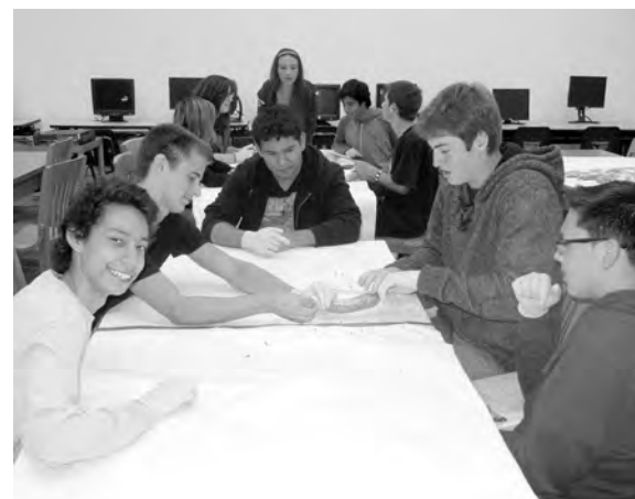
Student participation in meat packing simulation.

The last step was to bring the lesson into the present. The teachers used the current documentary Food, Inc. and class discussions about the role of government, especially regulation and control of the food industry, to engage the students and solicit their opinions. Caitlin's reaction to the lesson was typical: "It's so sad that the immigrants were so excited about coming to America and then forced into such poor working conditions to feed their families." The students