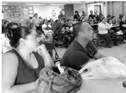
Finley Parents viewed public service announcements on the different types of bullying that exist.