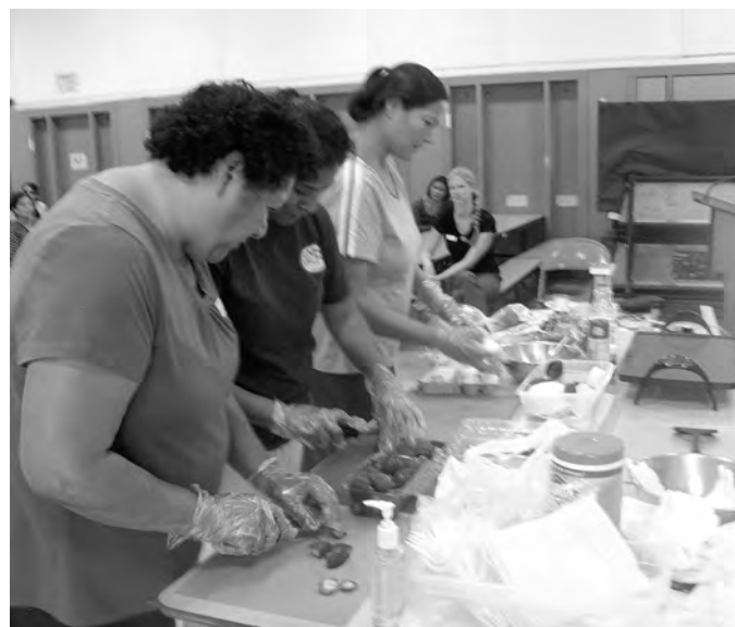
Meairs Moms preparing a healthier version of French Toast.

The series ended with a graduation ceremony. Each parent received a certificate of completion and some gifts to help them continue on their path to healthier eating. Some great food was shared!