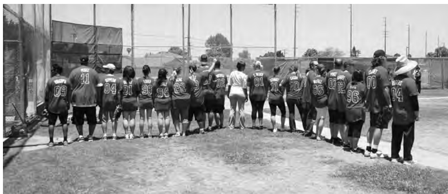
The Johnson staff works and plays as a team.

Thank you all for your commitment to our school, our students, and our community. You guys are awesome!