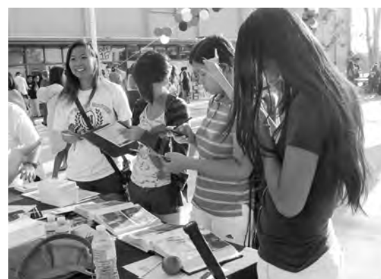
Freshman students applying to join Upward Bound.

Parents of freshman students were also invited to the carnival and were provided an orientation of their own while students were at the dance. Parents received general information about the school, including schedules and graduation requirements. Parents in attendance also received a free football game ticket so that they could attend the varsity game with their son or daughter.