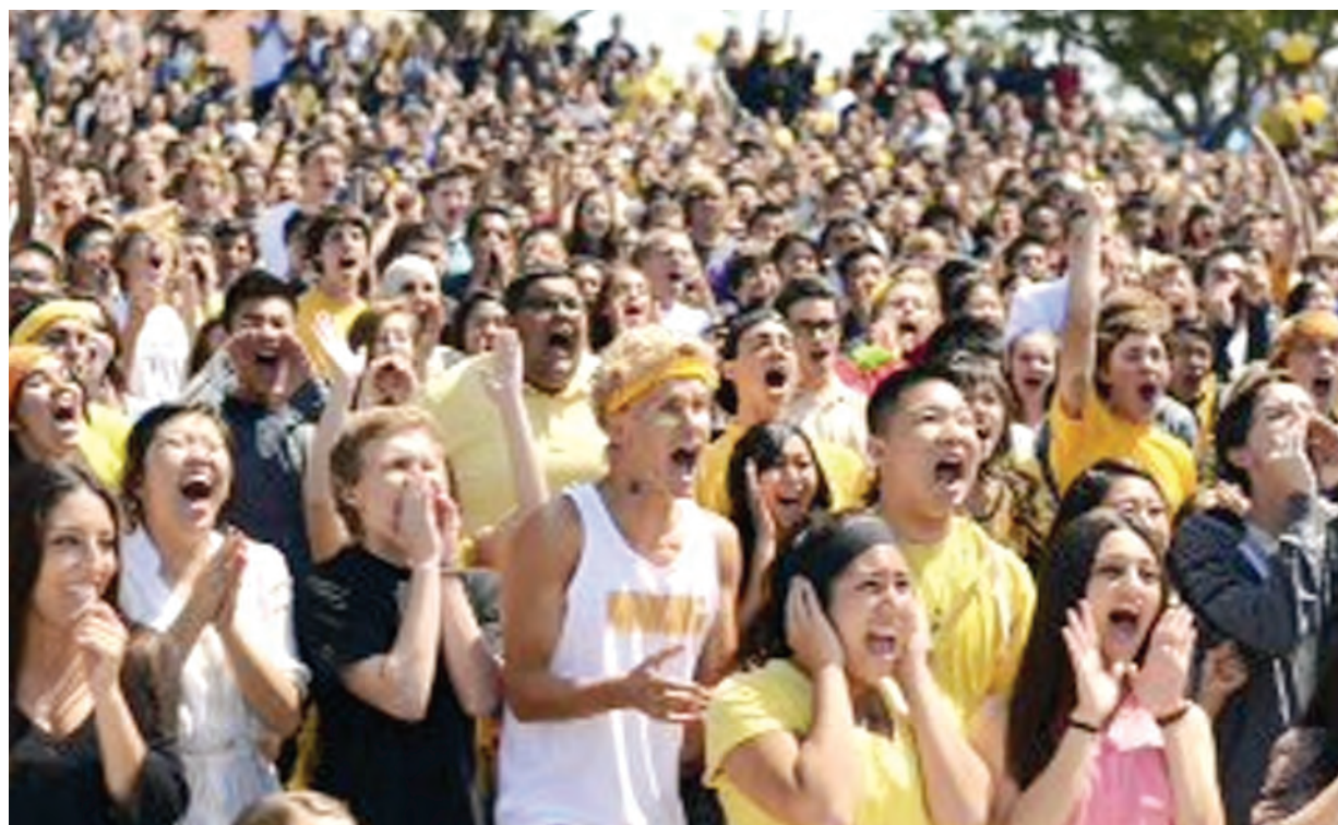
Fountain Valley High School students show school spirit.