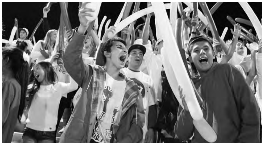
The Baron student section shows their pride vs. Huntington Beach.

At FVHS, we are committed to developing a culture in which students are making a connection to school through a wide variety of activities. Our hope and expectation is that by providing an environment that engages students, we improve the students' overall attitude toward being at school; develop deeper connections to the school, adults and peers; and thus develop opportunities to teach students how to treat one another.