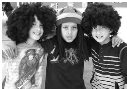
We have CRAZY hair.

To the wonderful Sequoia team and its fabulous families, I have to express my deepest respect and admiration for a job well done. This year you have taken some of the most challenging situations, and yet still continue to work diligently for all of our students. Your "can do" attitude is refreshing, and it is appreciated more than words can ever express.