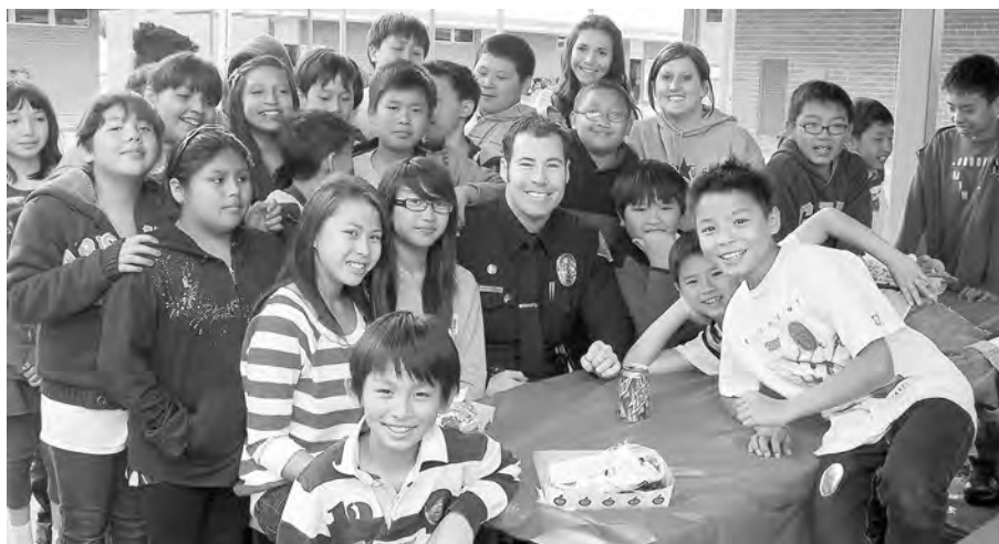
Police Memorial Luncheon

The caring students at Anderson believe in giving back. Listen for their ROARS!