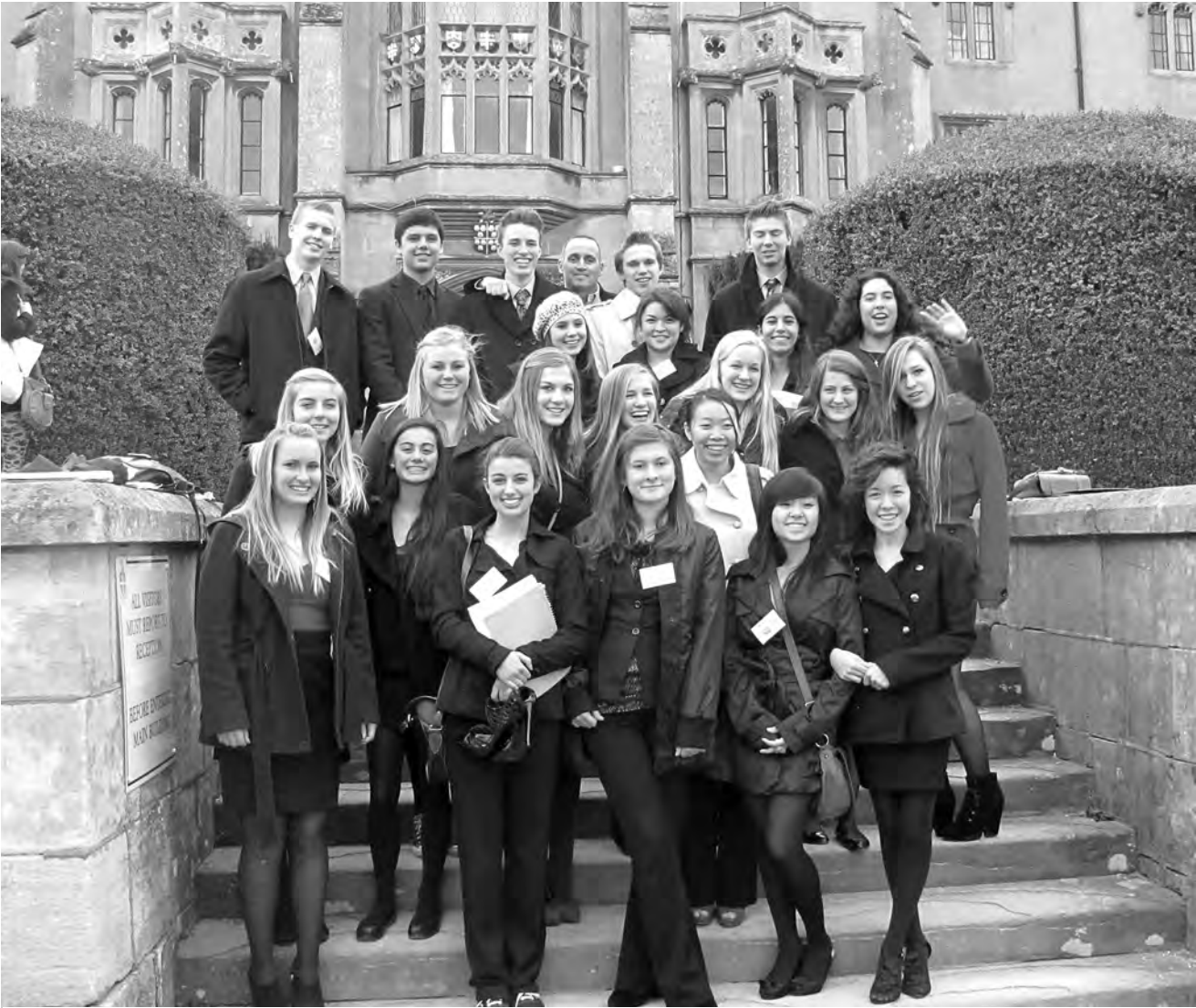
Students compete in Bath, United Kingdom

We took the Eurostar to Paris, a train that travels underwater. The first night, we enjoyed the famous Parisian cuisine and took a night tour down the Seine River. The Eiffel Tower literally sparkled under the moonlight, and it felt so surreal. In Paris, we visited many major French landmarks, including Notre Dame, Le Musée d'Orsay and Le Louvre, which is home to the iconic Mona Lisa. Of course, it wouldn't be Paris if we didn't visit the Eiffel Tower, which many students bravely climbed all the way to the top. On the last day in Paris, we visited the Château du Versailles, which was the extravagant summer home of King Louis XVI and Marie Antoinette. Everything—the art, architecture and beautiful gardens—was absolutely magnificent. We also took a bike ride through the wonderful gardens of Versailles, which was an excellent way to end the trip. It was truly a once-in-a-lifetime experience that the junior students of MUN will never forget.