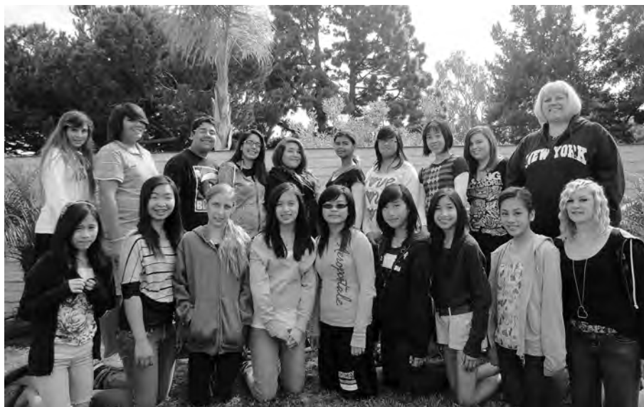
Stacey choir having fun

The Stacey choir will also be performing at the upcoming PTA Honorary Service Awards evening and the groundbreaking ceremony for Measure O on the Stacey campus.