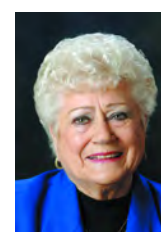
Margie Rice Mayor

Are you planning to go to the beach this summer? You can go online at www.huntingtonbeachca.gov to check the water conditions or call Beach Operations at (714) 536-5281. Whatever you do, make sure you stay safe in the water this summer.