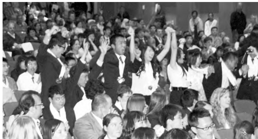
A winning moment!