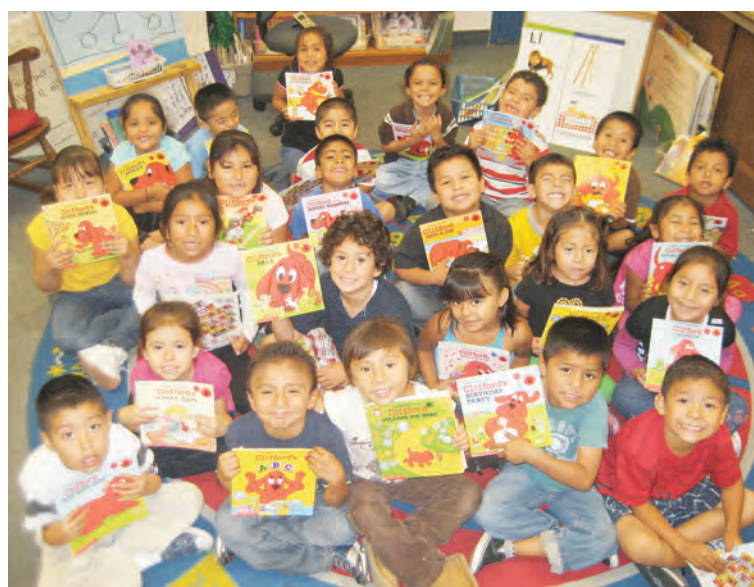
Oak View Elementary School students practicing their English and learning new vocabulary words.

By Joyce Horowitz, Principal Oak View, Ocean View School District