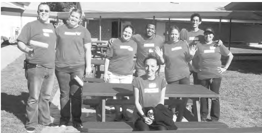
The Volunteers and Johnson students proud of their hard work.