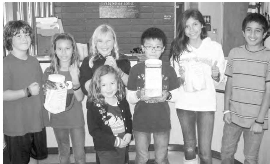
Students wearing the bracelets they received for being Responsible, Respectful and Safe.

Earlier this year we received a grant to participate in a school-wide Positive Behavioral Interventions and Supports (PBIS). This program is an evidence based practice for building a positive social culture that will promote both social and academic success. Students are working hard to be Responsible, Respectful, and Safe. When they are “caught” showing these characteristics they receive a certificate that gets turned into the office for a weekly drawing. When they turn this slip in, they also receive a bracelet: red for responsible, black for respectful, and white for safe.