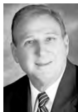
Joe Carchio Mayor

As the weather turns warmer, Huntington Beach comes alive with activities and energy. There are events and activities that will interest residents of all ages.