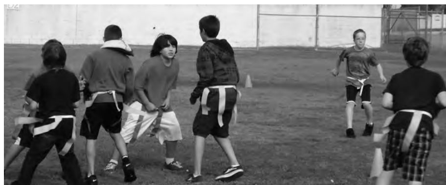
Monarchs in action during noon league flag football.

soccer, basketball, softball, & track and field, our students at Masuda have numerous opportunities to participate in organized sports noon leagues such as basketball, flag football, and dodgeball. With high demands of academics and other competing influences, students often ignore this very important aspect of their lives. Because of these factors, it is so wonderful to observe our students get involved and be active in our sports teams and leagues. Live Healthy and Have Fun. Go Monarch!