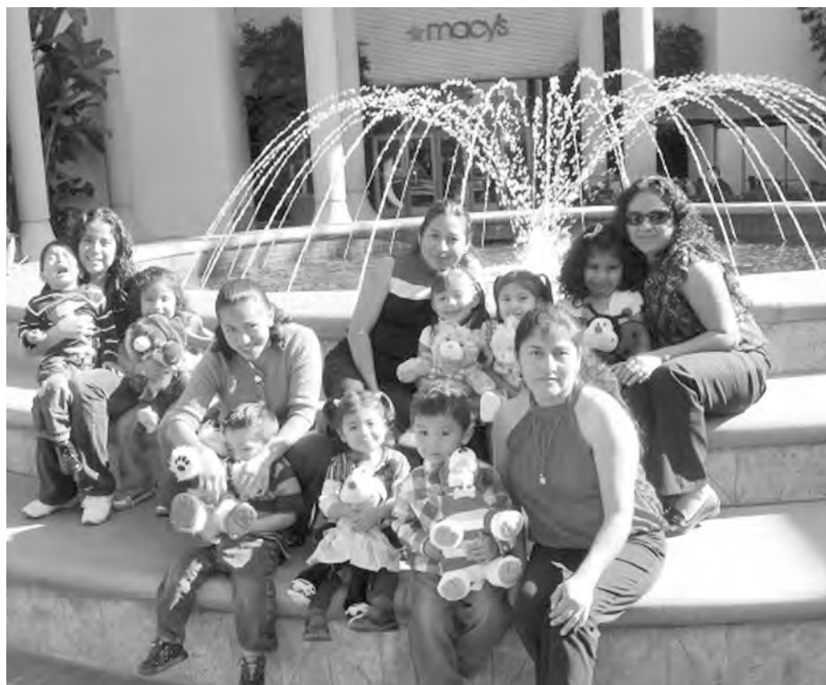
Family literacy perfect attendance winners.