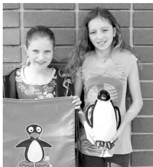
Oka Students love Jiji—the mascot students use to identify the MIND program mascot.

Spatial/Temporal math is an on-line math program which helps students to visualize math concepts. Born out of neuroscience research at the University of California, Irvine, MIND's unique approach accesses the brain's innate “spatial temporal” reasoning ability. This ability allows the brain to hold visual, mental representations in short-term memory and to evolve them in both space and time, thinking multiple steps ahead. MIND's approach consists of language-independent, animated representations of math concepts delivered via computer software games.