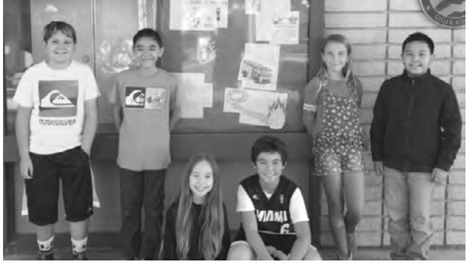
Gisler Executive Board in front of the Dime Drive poster to raise money for the Red Cross.

themselves and we raised a little over $1,800!! Thank you to everyone that