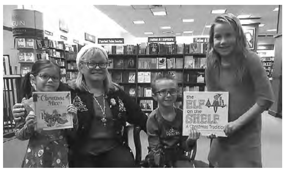
Eagle Pride! Eagle Accomplishment! Eagles SoarEagles Unite!

Congratulations to all Circle View Eagles for an amazing end of 2018!