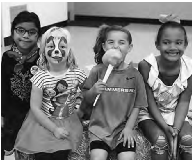
Students having fun at our first annual Fall Festival

Students were able to play games at various booths and engage in activities such as ring toss, lollipop tree toss, pie walk, and button making. Students had the opportunity to get their faces