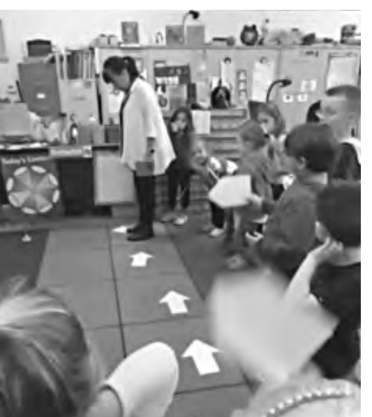
Mrs. Miner follows the coding path her students formed.

Using different symbol arrows such as a yellow arrow, a green pointer or a red square, students plot out a coding sequence