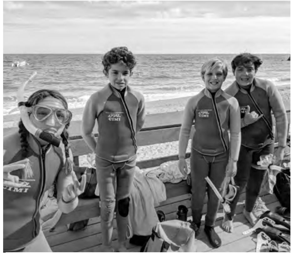
Students suited up for one of the snorkels in Toyon Bay, Catalina Island

Students had the opportunity to snorkel three different times during the trip, including at night. Students conquered their fears to see bioluminescent plankton in complete darkness. It is an experience they will never forget!