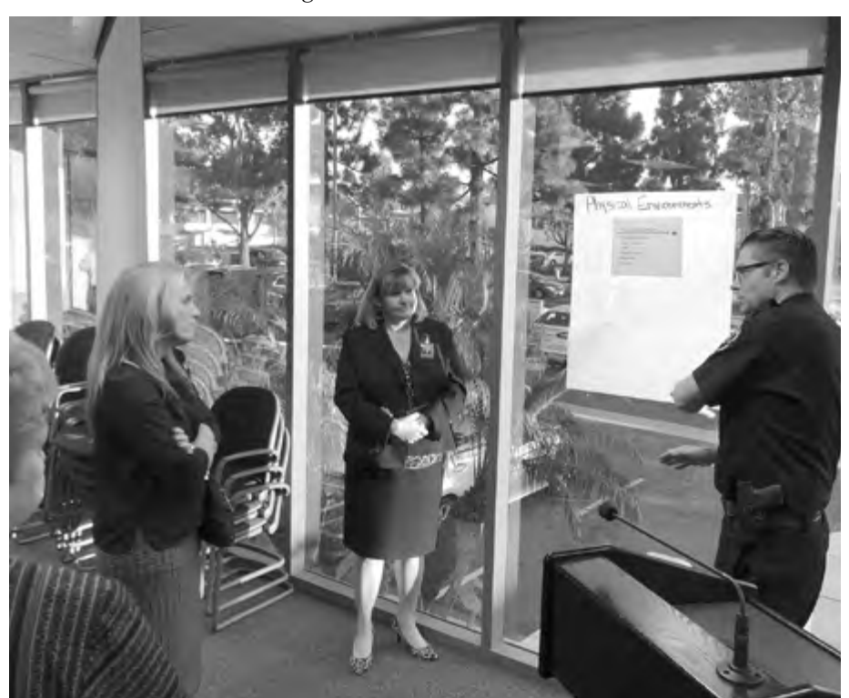
Members of Safe Schools Task Force meet to study, research and discuss key facets of school safety at all FVSD schools.

Before sharing more on our SSTF, I would like to capture some of our most recent enhancements or improvements related to school safety. This fall, we purchased new backpacks and resource guides for every classroom. We also implemented a new visitor management system that requires visitors to scan a government issued ID, which is run through the Megan's Law background check. This system also allows our site administrators to know exactly who is on campus during an emergency. In addition, all staff members wear an ID badge at all times, clearly indicating who is allowed to be on our campuses. One of my favorite changes is the addition of counseling services at each of our seven elementary schools, as we know that many mental health issues begin at these ages. And, we have increased our level of training for all staff members throughout the District.