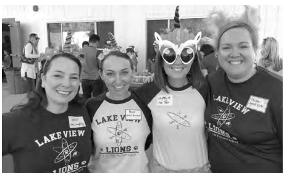
PTO is gearing up for Lake View's Second Annual Color Run, and as you can imagine, it is going to be a rainbow of fun and joy.

Every year, the events get bigger, better and more exciting. For example, the theme for this year's book fair was "Enchanted Forest." The PTO book fair committee transformed the Lake View multi-purpose room into a purple, pink, and blue glittering forest of fantasy dreams, complete with giant trees, twinkling lights, gnomes, and fairies. The book fair was a wonderful escape for our students and a place where they wanted to buy books.