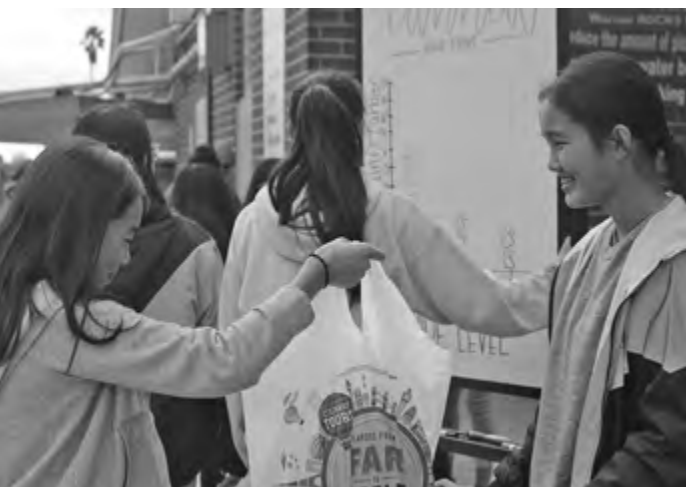
Wildcats participating in the canned food drive.

is bright. As part of this commitment, our Wildcats recently partnered with Westminster High School to collect canned food in an effort to support local families in need.