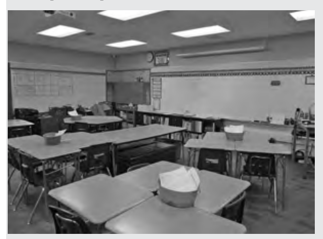
A completed classroom at Masuda Middle School boasts new paint, flooring, ceiling, and most importantly, air conditioning!

In addition, Phase IA and IB are complete at Courreges School, which included modernized classrooms in their kindergarten core, and updates to their administrative offices, staff lounge and restrooms. We are also thrilled to report that Phase II is set to finish in the coming weeks. Phase II involves newly modernized classrooms for many of their upper grade teachers on the northeast side of campus. Work at both Courreges and Masuda continues to move along at an impressive pace!!