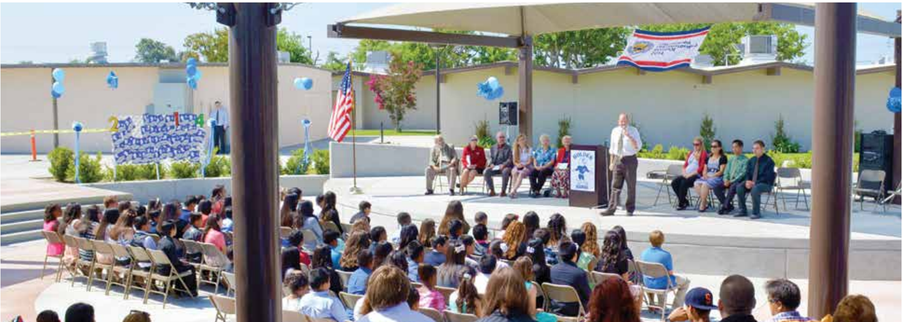
Holder School’s sixth grade class of 2014 promotion was the first to use their new Outdoor Learning Center.