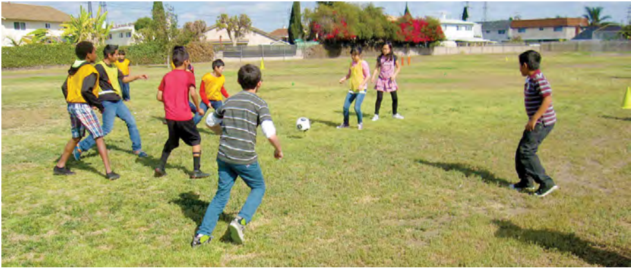
Luther students compete in team sports during lunchtime.

But the learning goes beyond the game—students learn and work as a team alongside peers with whom they might not otherwise interact, including students from special-day classes who are integrated onto the teams. There are stringent guidelines regarding accountability, sportsmanship and conduct for all students. Additionally, students learn how to track their team's rankings and calculate averages. These activities teach students planning and organization as they prepare for their playoff games. Members of the staff report that with the organized sports taking place during lunchtimes, there are fewer negative incidents on the playground and the climate is very positive, contributing to overall student growth.