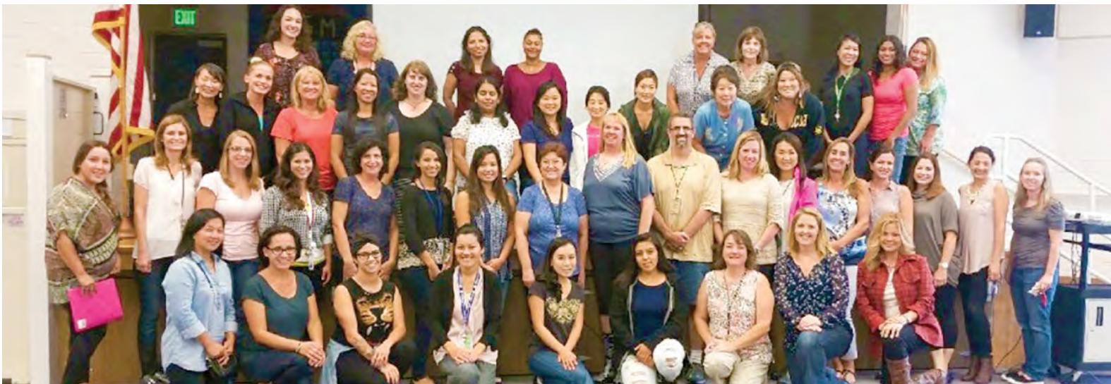
Parents and teachers working together. That's Los Coyotes!

There is a continual on-campus parental presence that makes our school a hub of the community, and a very nice place to be.