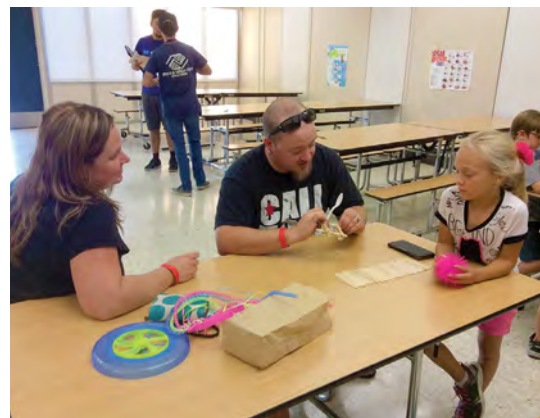
Family STEM catapult project at King's campout.