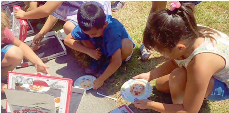
Landell's third grade solar pizzeria.

We are all eagerly anticipating the first batch of salsa, too!