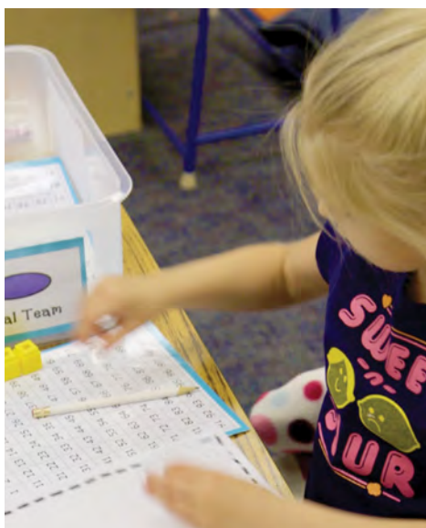
Kindergarten students use a variety of tools and strategies to solve problems.

No longer do we say, "I'm just not good at math." We know that all of our students can master math concepts given the appropriate instruction and support. Our goal is for them to enjoy math, and feel confident in their ability to use it in their everyday lives.