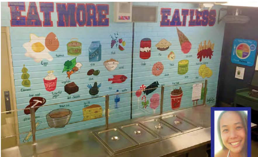
Vessels Cafeteria mural by Emily Lu.

Emily painted colorful anime-style foods separated into two groups—those that should be included in a child's diet and those that should be consumed in moderation. Vessels students are thrilled with the new mural, and they are excited to learn about new kinds of food they should try. The outcome is definitely "food for thought" for students as they line up and select their choice of lunch for the day.