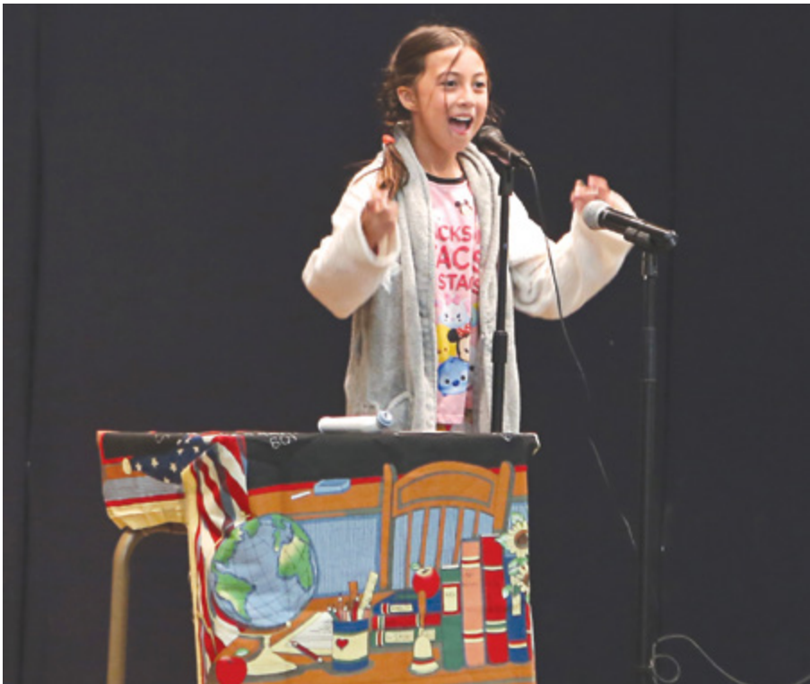
Third grade student performing Sick by Shel Silverstein.