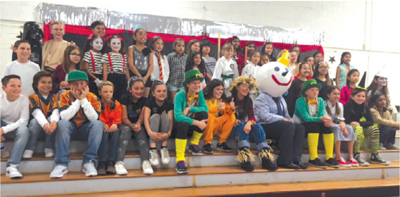
Students with a wide variety of talents performed on stage at the annual talent show.