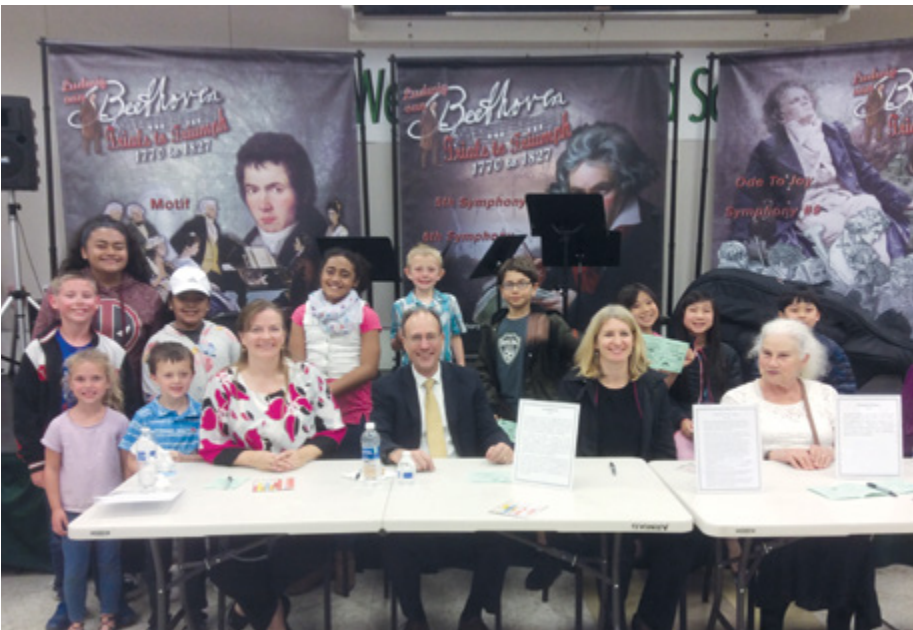
Musicians signing student “passports” at the meet-and-greet following the performance

Parents, students and staff members were able to not only enjoy one another’s company but also share their love for music and meet other musicians from a professional symphony orchestra. Students were able to identify instruments, music, patterns and history and share with their parents what they learned about the composer of the year.