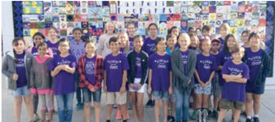
Landell's 2016/17 Student Council

The student council has done an amazing job of helping us make a difference in the lives of others.