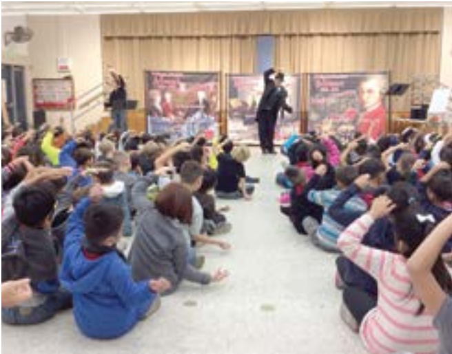
Students learn about the life and journeys of Mozart during their Class Act Prelude Assembly.

This year's theme is "Magical Journeys," and the composer is Wolfgang Amadeus Mozart. All students have the opportunity to participate in an interactive assembly with "their" musician, classroom lessons, a free family night, and a student-led assembly showcasing art, dance, song and music centered on the theme and composer.