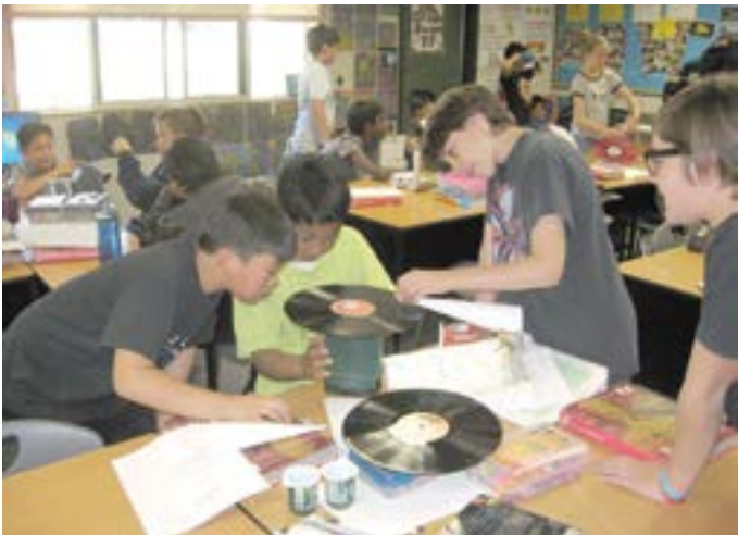
Sixth graders build a phonograph to learn about sound.

In another activity, students were challenged to build a phonograph using a vinyl album, a straight pin, and a cone formed from a sheet