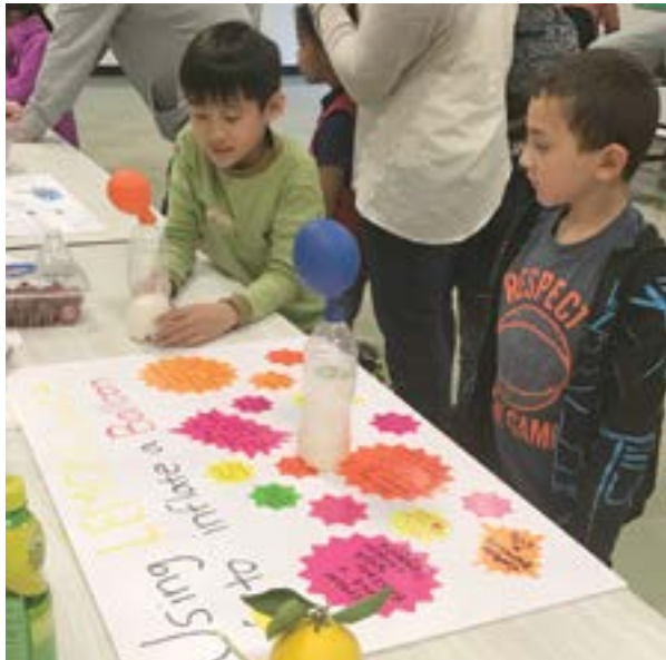
Luther students explore properties of gasses at a recent Family Science Night.

In addition to the district's newly launched STEM program, our students have been visited by "Traveling Scientists" from the Inside the Outdoors program. These lessons have given our students real-life problems to solve, and taught them how to reduce waste at home and at school.