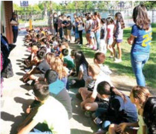
Students learn appropriate behavior during our PBIS Tier I Implementation Day.

The multitiered structure focuses on teaching appropriate behavior and reinforcing positive behavior, and includes involvement of all stakeholders: teachers, staff, students, parents, families and community members. Tier I interventions are schoolwide and apply to all students, Tier II focuses on small