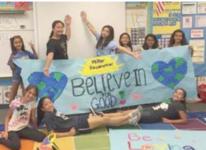
Student Council led activities for the Great Kindness Challenge to encourage kindness and a positive school culture at G. B. Miller.

Students, staff, and parents are empowered to work together to ensure opportunities for all students, providing input to strengthen the school's plans and to organize and lead many of our activities, including flag ceremonies, Fun-Filled Fridays, RACE carts, student