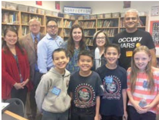
Student Ambassadors and Career Day presenters.

The presenters, who included an architect, physical therapist, exotic car restorer, attorney, real estate agent, SpaceX engineer, NASA consultant, Disney cast member, Cypress City Council member, and our very own district superintendent, all visited the classrooms and shared information about their fields and the journeys which led them to that career. This event provided our students with an opportunity to connect their curriculum-based instruction to real world applications.