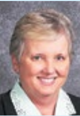
Dr. Sue Johnson