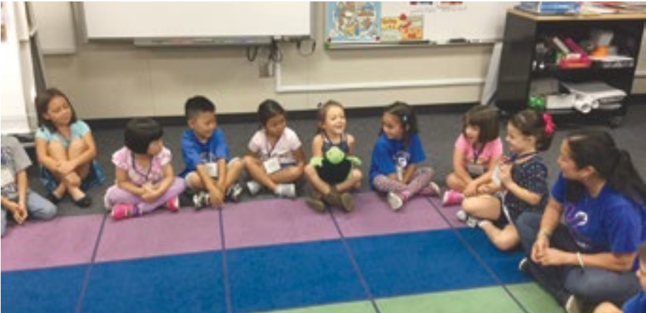
King kindergartners learn about emotion regulation with some help from Twiggles the Turtle.

applying what they have learned to help monitor their feelings, and they are responding to situations that arise during the school day in a more appropriate manner. We are excited observe their continued growth as we support their social/emotional development.