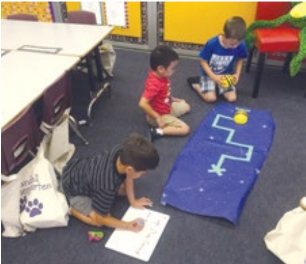
Our youngest leopards coding their Bee-Bots

Our Leopards are developing important career skills, and having fun while doing it!