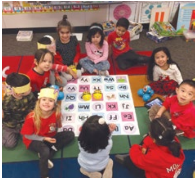
Morris transitional kindergarten students are coding to practice letter sounds.

Students are learning the essential components of coding while also reinforcing basic reading, math and collaboration skills. Robots have been an exciting addition for the eager TK students.