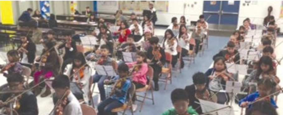
Our scholars in the Music Strings Program engage in weekly lessons to play the violin, viola, or cello during the school day.

In addition to a strong academic program, we are excited that our young scholars are able to experience the arts during the school day. Students will have the opportunity to showcase what they learned at upcoming school-wide events.