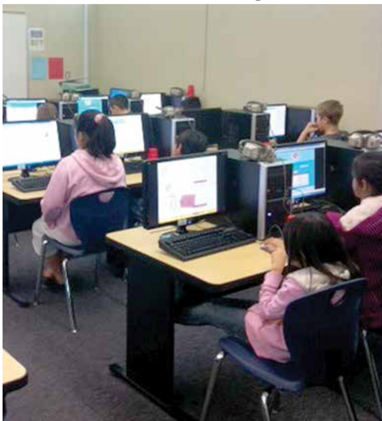
Students engaged in group work in newly modernized computer lab

The mission of the Foundation is to promote and support the educational programs of the Cypress School District and its schools. CEF has accomplished this by leasing, managing, and developing surplus properties of the District, for programs that benefit both the District and the students it serves. These surplus properties are the result of declining student enrollment that resulted as schools were closed. The District understands that education is a community endeavor. Below is a review of the District's rich history of surplus property use for the benefit of the citizens of the City of Cypress: