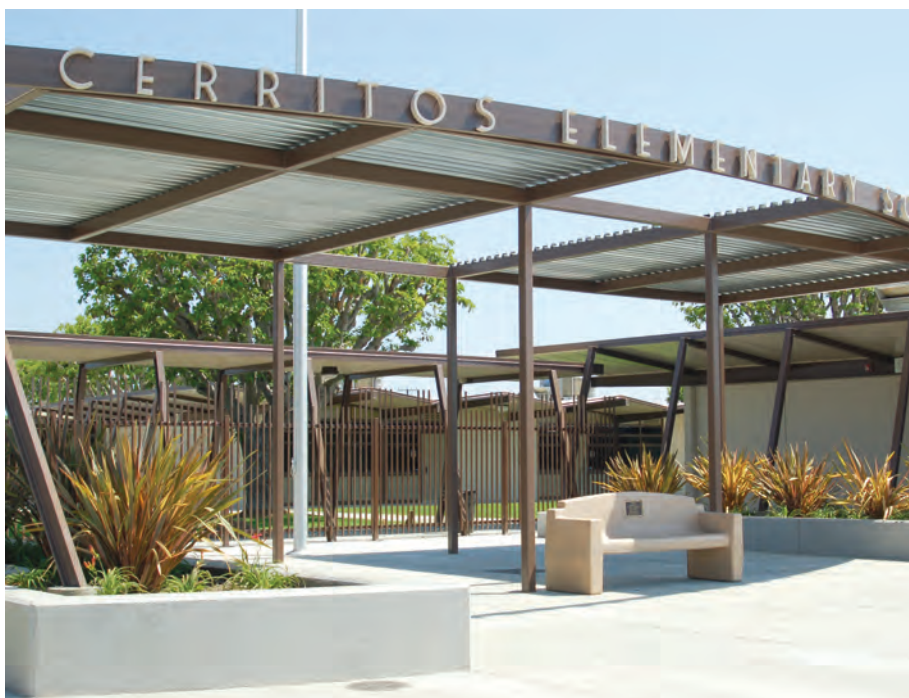
The new front entrance to Cerritos School.