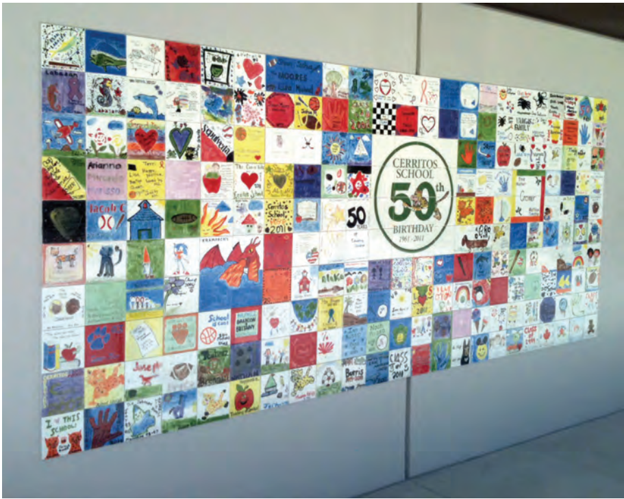
The new Cerritos School tile wall.

The remodeled student restrooms are now environmentally friendly, with installed hand dryers replacing the use of paper towels. In addition, enhanced lighting and a comprehensive security system were added to the campus to ensure the safety of our students and staff. The school kitchen received an upgrade, too. This includes a “speed line” with both hot food and a salad bar available on a daily basis. Last, but not least, an enlarged and separate staff parking lot was also added to free up much-needed parking spaces for parents and visitors.