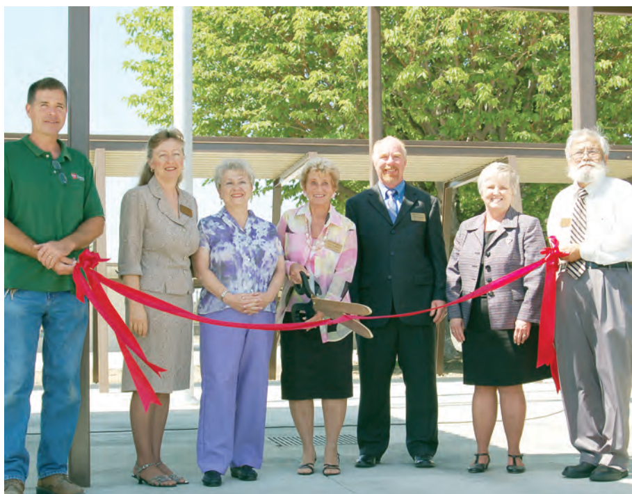
Cerritos School Ribbon Cutting