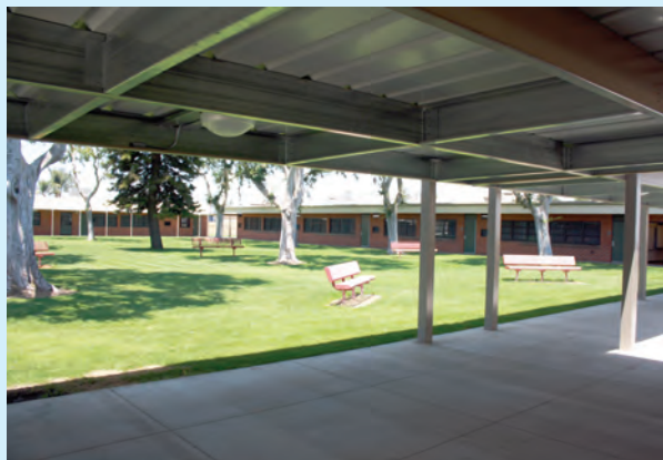
Newly Modernized Morris School.

Every moment of every day presents an opportunity to grow and improve and to succeed and achieve. This could not be truer than right here in Cypress School District, where we will continue to place emphasis on enriching the instructional program and making every classroom a place for 21st-century learning for every student. Together, teachers and parents will foster an environment that embraces technology and integrates the four Cs (critical thinking and problem solving; communication; collaboration; and creativity and innovation) into all academic core content taught in our classrooms.