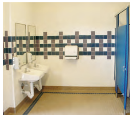
Modernized Restroom at Vessels School.