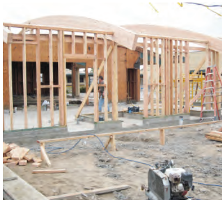
Construction in Progress at King School.

In support for the District, in 2008 residents in the Cypress School District passed the Measure M facilities bond measure to upgrade the 40 year old schools in our District. On May 5, 2009 the initial series of the authorized general obligation bonds and bond anticipation notes were sold. The sale was very successful, as there were more investors ready to purchase than there were securities available to sell. In January 2011, the District received notification from the California Department of Education that we would be receiving an allocation of Qualified School Construction Bonds (QSCB), which have been made available to California school districts under federal legislation. At the March meeting, the Board of Trustees authorized the issuance and sale of the second series of general obligation bonds in order to continue financing identified school facilities projects. The allocation of QSCBs will lower the overall cost of borrowing to the District's taxpayers.