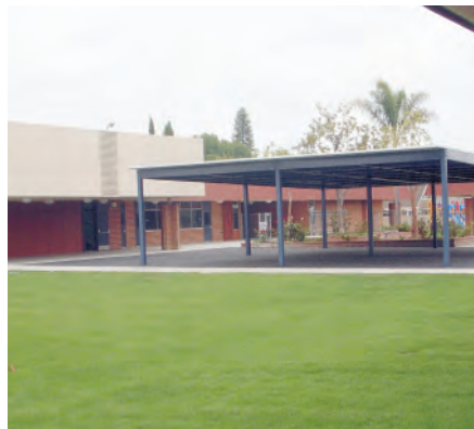
Newly Modernized Vessels School at Opening.