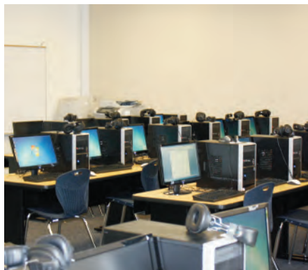
Vessels Modernized Computer Lab.