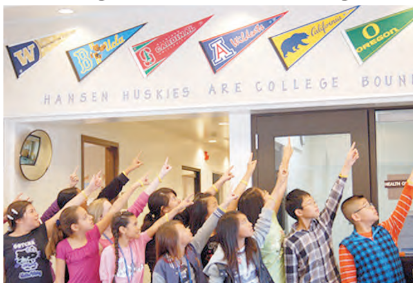
Emphasis is on students being college-bound.

Throughout the 2011-12 school year, schools will continue to focus on reading fluency, comprehension, and student engagement. Teachers will continue to utilize frequent assessments in reading and language arts at all grade levels during the 2011-12 school year to ensure that the instructional program is appropriate to students' needs. These assessments will