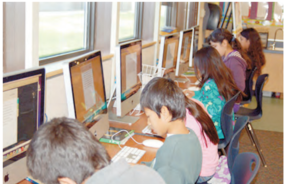
Hansen students using the new computers.