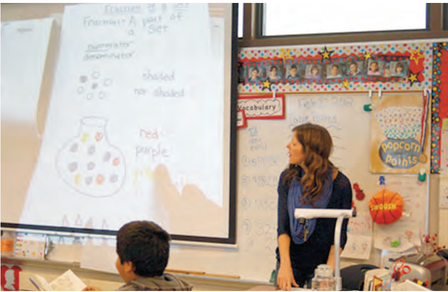
The teacher using the document camera and how well it displays on the classroom

We are extremely proud of the work that's been done so far. Improvements and new technology in our 50-year-old school sites is making a real difference in student achievement and our teachers' ability to bring the best out of our kids. We look forward to continuing the much-needed improvements, repairs and upgrades in the sites that haven't yet been modernized. Unfortunately, delays in expected state funding and other external economic factors threaten to slow down ongoing repairs, upgrades and improvements to our remaining 50-year-old elementary schools. The School Board is considering a ballot measure to generate local funds that can't be taken or cut by the State so that we will be able to complete much-needed needed improvements, ensure all students have equal access to modernized sites with 21st Century instructional technology, and free up additional resources to support academic instruction in math, science, reading and writing. It is the goal of the Savanna School District to provide the most exemplary educational opportunities for children both now and into the future. We know that the community agrees that our children deserve no less.