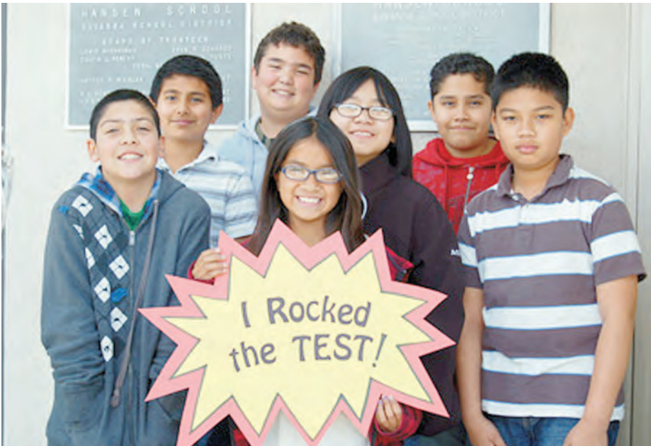
Hansen Superstart students who achieved a perfect score in both reading and math on last spring's state test

Measure N funding has enabled the Savanna School District not only to infuse technology into every classroom, it will help us ensure a safe, secure, environment where teachers can continue to focus on providing students with the highest caliber learning experience possible. The Hansen School modernization