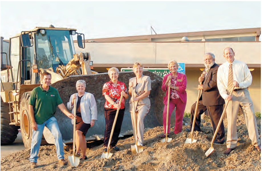
Cerritos School groundbreaking.

project was completed in only nine months – much faster than many districts are able to upgrade 50-year-old school sites. Cerritos School students, teachers and staff are excited that their school's comprehensive modernization will be completed during the 2011-12 school year. In addition to enhanced classrooms with new plumbing, roofing, electrical, fire alarm systems and energy efficient heating and air conditioning units, each classroom will be equipped with upgraded instructional technology and emergency communications systems. Newly remodeled student restrooms will 'go green' to save energy, water and scarce resources that can be used for academic programs. In addition, enhanced lighting and a comprehensive security system will be added to each campus to ensure safety of our students and staff. These capital improvements will affect our children's education and our community for generations to come.