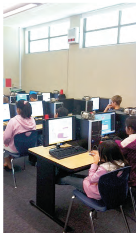
King School students using lap top computers in new library and new computer lab.