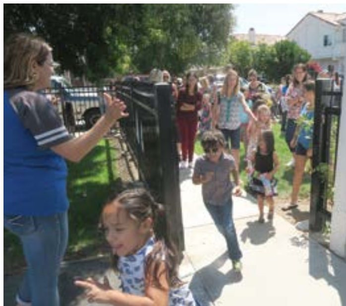
Back to School Kickoff

easy, and it's events like this that help ensure a successful transition. Both the school and the PTA need your help and involvement to continue to provide engaging opportunities for our students at Lincoln. I urge you to find your niche and volunteer on campus. Also, please mark your calendars and plan to attend our Back to School Night on September 14. Welcome back!