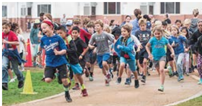
The Jefferson Running Club kicks-off September 25.

Thank you in advance for your partnership and support of our school, and again, welcome back! Team Jefferson is looking forward to a fantastic school year!