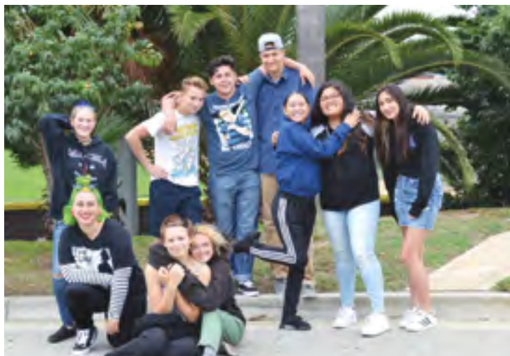
Redondo Shores students beginning the journey of a new school year.