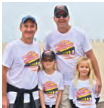
Members of Team Jefferson at the Pier to Pier Walk

The first event is the Pier to Pier Walk which takes place on Sunday, October 28. Registration dollars from the event go directly to Jefferson through the RBEF, and to our special needs students. The second event is the Jefferson PTA's Jog-a-Thon, which will be held on Friday, November 2.