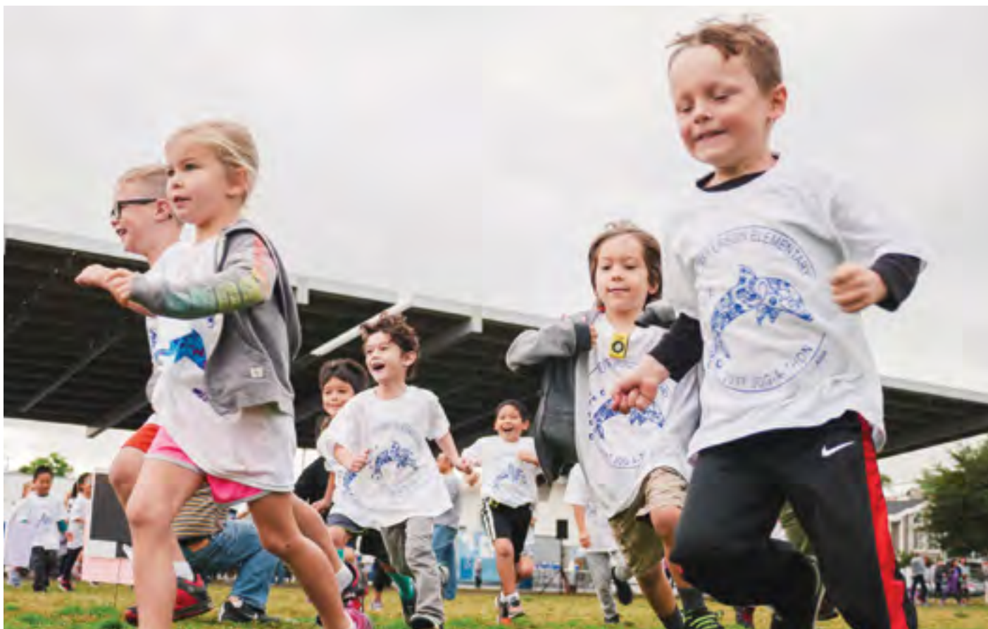
Jefferson Students at the Jog-a-Thon (please see page 12).