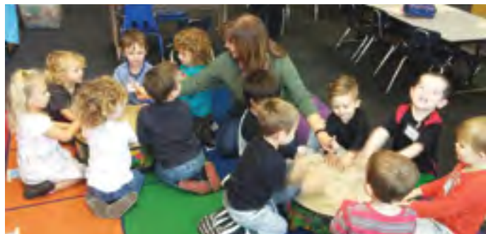
Group interaction with the drums!