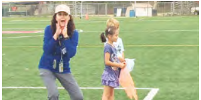
First graders getting set to play “Capture the Flag.”

Why are coaches important to athletes? Coaches provide the instruction and support that allow athletes to develop to their fullest potential. In addition, for parents and teachers, coaches are meaningful people in an athlete's life who play a vital role in the athletic experience. Coaches help our student athletes to develop healthy lifestyles,