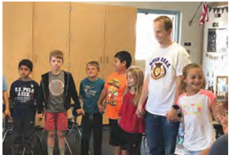
A Watch DOG joins a morning meeting in a second grade classroom.

Birney will once again embrace this wonderful program on campus in our continuing effort to realize greatness. We will have a breakfast kick-off event followed by valuable information about this program when dads and other father figures will get to hear all about the research behind