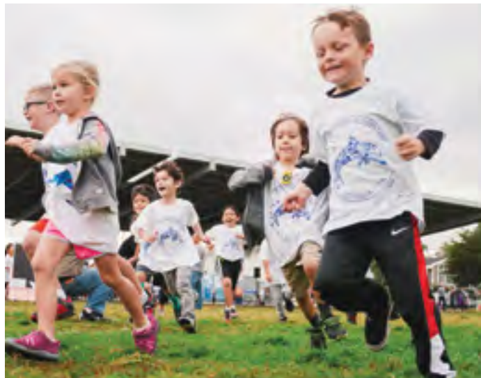
Jefferson Students at the Jog-a-Thon

The Jog-a-Thon is our PTA's marquee fundraiser of the year. While both of these events are close together, supporting each of them is important for Jefferson, as they provide resources for our school and opportunities for our students.