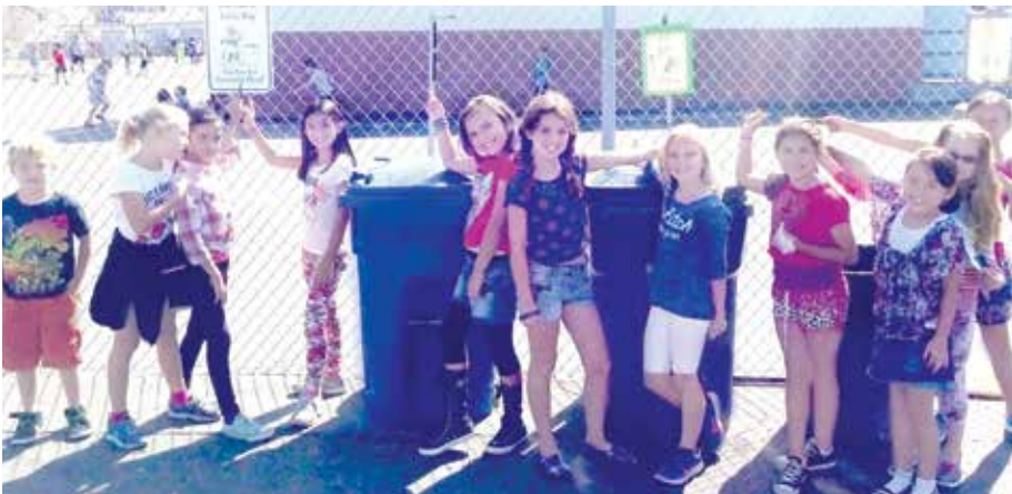
Jefferson students recycle!

At Jefferson, we believe it is important to raise our children to take care of themselves and maintain a healthy lifestyle. We also believe in guiding our children to think beyond themselves, and take care of our planet. These ideals often go hand in hand! At Jefferson, our PTA sponsors a Green Committee and our students lead a Green Ambassador program. Jefferson is in the 4th year of promoting health for our individual students, and health for our planet. On Tuesdays, we encourage 'Trash Free Tuesdays' and hope that our children will bring their food in reusable containers and generate no trash. On Wednesdays we promote 'Walk to School Wednesdays' which lowers the amount of emissions from cars as well as increasing the amount of physical activity for our children and encourages a healthy lifestyle. We hope these activities are just the beginning of raising healthy and eco-conscious children.