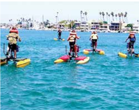
Hydro biking at the Venice Canals in Long Beach.

We are all looking forward to next summer's adventures at the Zone, and we hope your middle school student can join us.