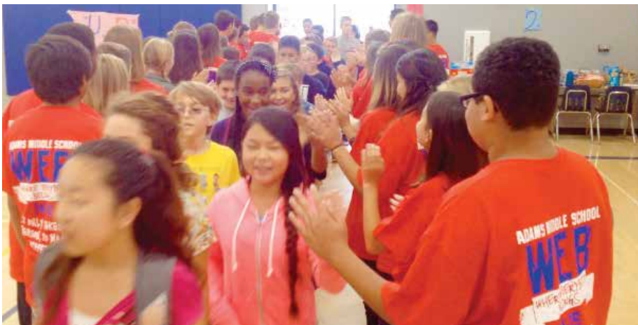
WEB Leaders welcoming new students to Adams Middle School.

Often, being “in the middle” gets a bad rap. Middle school is a time of change for students; people get taller, they have new interests, and their social lives change. The transition to middle school is an adjustment for students and parents alike. However, research indicates that if students have a positive experience in the first year of middle school, their opportunities for success are greater. Adams Middle School is now in its third year of implementing the student-led initiative called WEB, which stands for “Where Everybody Belongs,” to assist students in their move to middle school.