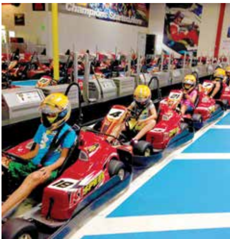
Go Kart racing at K1 Speed.