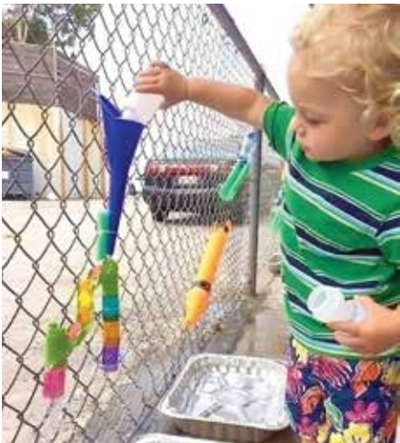
Water Wonders fun.

parent-participation program where parents can learn along with their children. South Bay Family Tree: where families nurture and grow together.