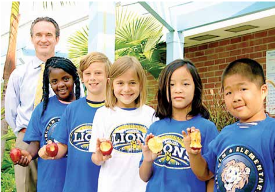
Lincoln in getting to the Core of Common Core.

Common Core State Standards provide a clear understanding of what students are expected to learn from kindergarten to 12th grade in English language arts and mathematics. They have been aligned to college and career readiness expectations, with the goal being to ensure students are properly prepared for college and beyond. As California moves into fully implementing the Common Core, the Lincoln Elementary School staff has been committed to clearly understanding what the standards are and how to best deliver them.