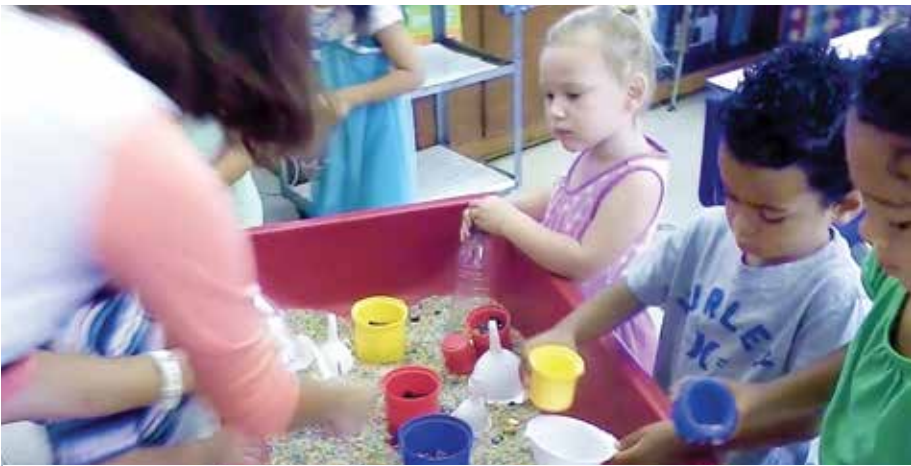
Playing in the sand table with bird seed.