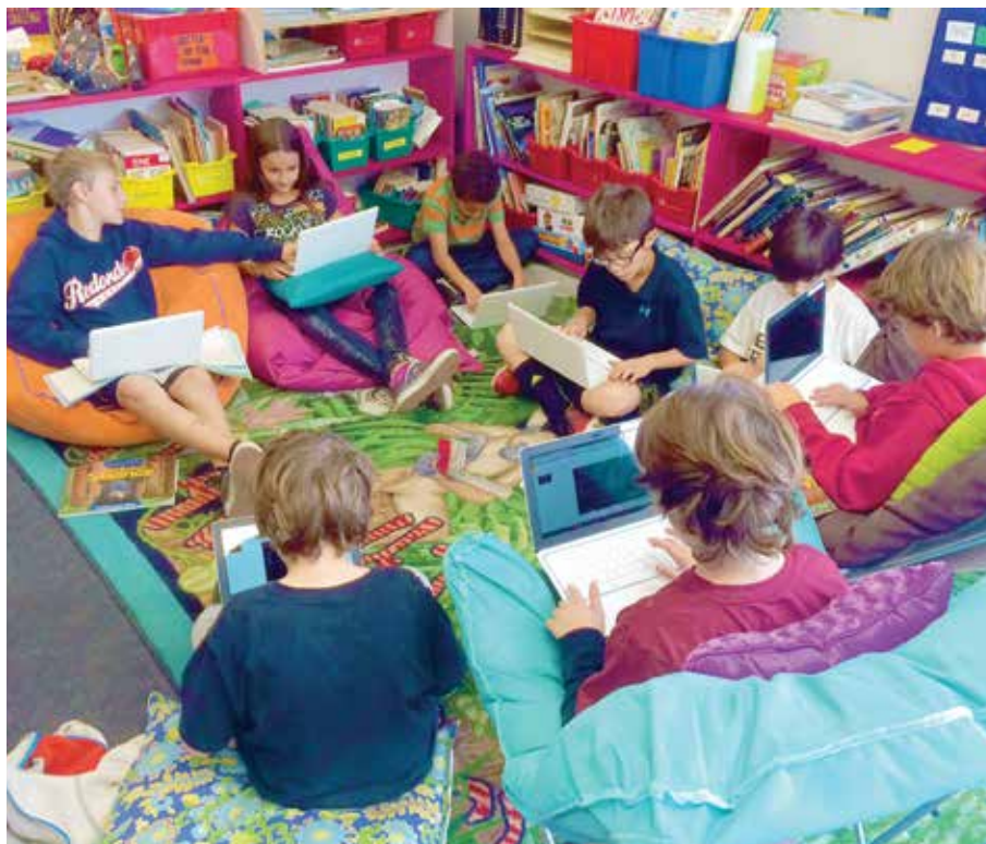
Fourth grade students from Alta Vista Elementary collaborating on a writing project.