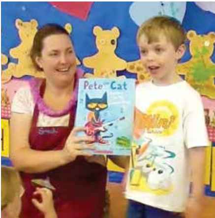
A Parent Ed mom shares a book.

We believe that parents are a child's first and most important teacher. This might seem obvious, but it is a very important statement to us here at South Bay Adult School-SBFT. Come and visit a classroom and you will see parents leading activities at tables, supervising outdoor play, serving snack, reading to a small group of children, or sitting with the teacher in a discussion group.