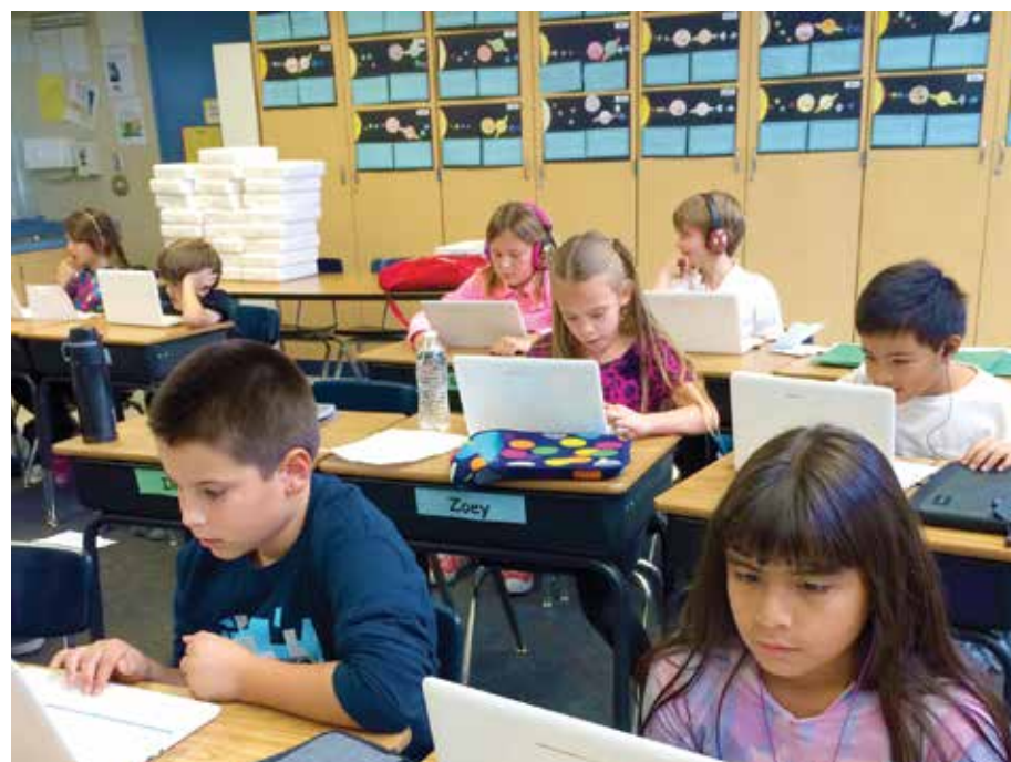
Third grade students from Washington Elementary working on math practice skills.

Coming up next: student tablets for the transitional kindergarten through second-grade classroom!