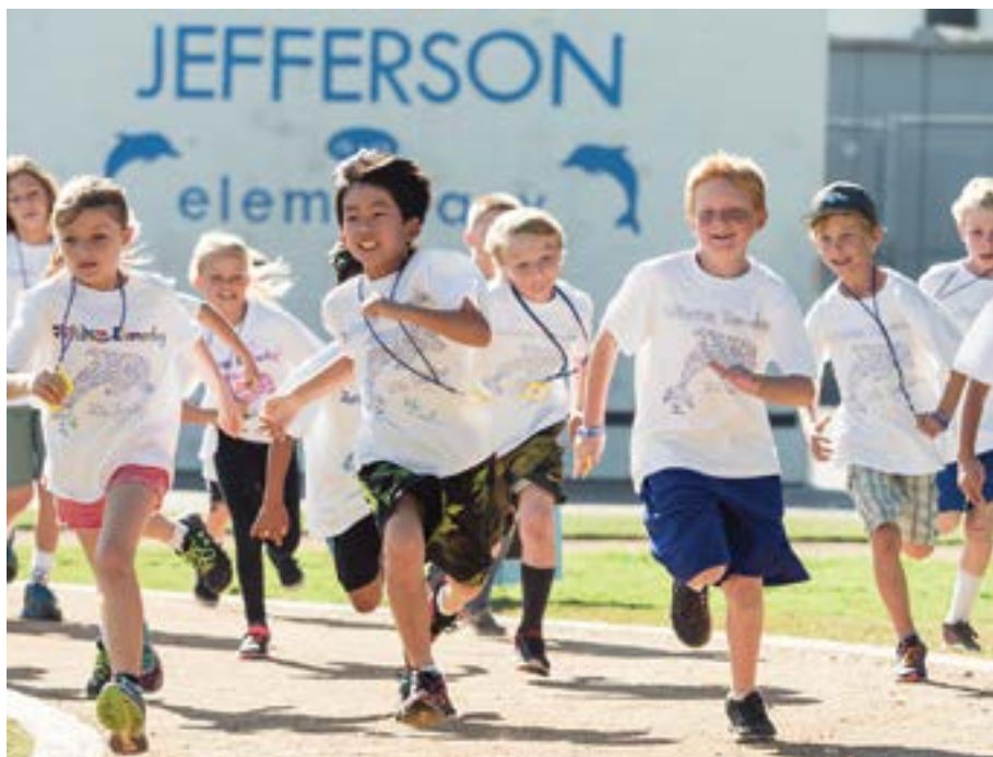
Jefferson students hit the track for the Jog-A-Thon

With the arrival of November comes one of Jefferson's signature events of the school year. The PTA's Jog-a-Thon is a fun filled day for students, staff and families. It represents not only the PTA's most significant fundraiser of the year, but a day that students at Jefferson at always remember. This year the Jog-a-Thon is on Friday, November 3rd. Beyond jogging and having fun, the aim of the event is to raise funds for opportunities for our students such as field trips, Hands On Art, assemblies and more. Because of everyone's collective efforts Jefferson is wonderfully supported by the work that goes into making this event a success. So now that November is here and it's time for all of Jefferson job dolphins to get out and jog.