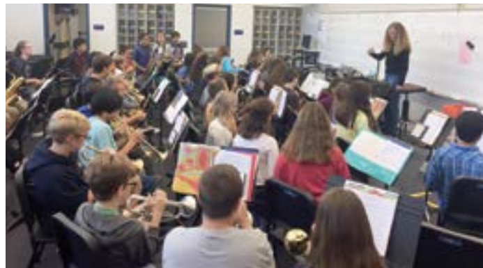
A Parras student leads the band

Parras's music course offerings include four levels of concert wind ensembles and a jazz ensemble. We also offer low-commitment extracurricular ensembles that include an after-school drumline and pep band as well as a student-led wind ensemble that meets at lunchtime. These ensembles will perform throughout Southern California at festivals and campus and community events, and will soon start exploring the world of technology-assisted music learning—because even some of the world's best musicians would rather be playing a video game than being forced to practice!