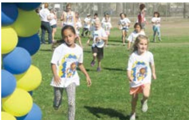
Lincoln students run for a healthy cause.

This PTA fundraiser is an opportunity for our students to experience an association between exercise, accomplishment, and community. I wish every event had a crack at that. This year we would like to go a little bigger and further their sense of accomplishment. Top runners