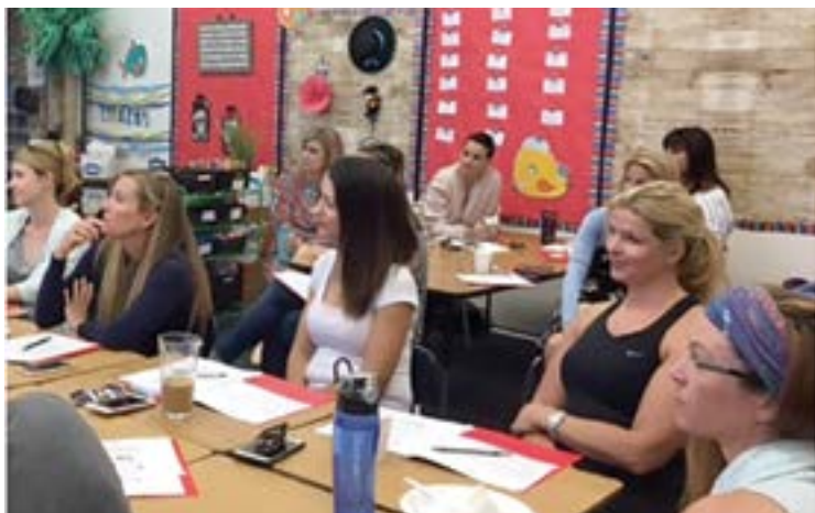
Hands on Art Docents are engaging in a training to get ready to kick off another fantastic school year.

Students in the first and second grades will enjoy this same vocal music experience during the second half of the school year. The fifth-grade students are also engaging in a band activity a couple of times per week, with two wonderful band teachers funded by the Redondo Beach Education Foundation.