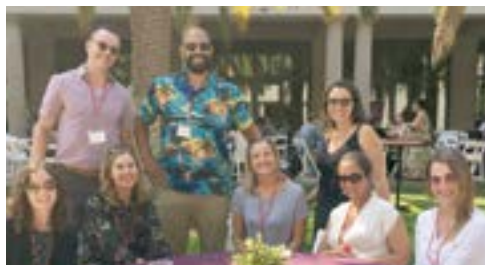
The RUHS Challenge Success team at Stanford University for a weekend training.

This past month, a team of four teachers, a counselor, a parent, and two administrators joined schools from across the US for a weekend at Stanford University. Working with Challenge Success, we engaged in round-table discussions