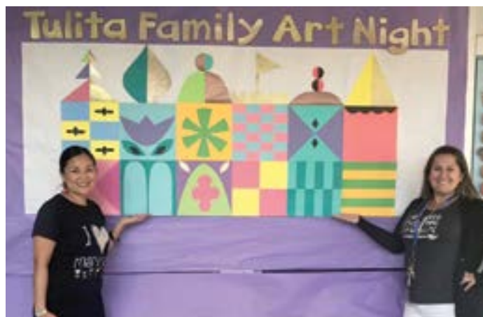
Tulita family and staff engaged in Family Art Night.

Family Art Night was a success, with each participant walking out with their own masterpiece after hearing about how art can impact their lives.