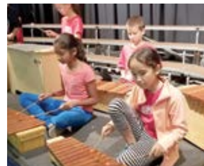
Madison Elementary students participating in an Orff Schulwerk lesson.