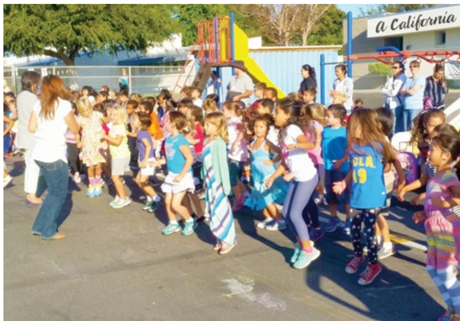
Washington students are jumping for a healthy heart during morning exercises.

up a grand total of 18,764 laps. That is approximately 3,753 miles, only a few miles short of a complete trek to the North Pole! This year we are already 200 runners strong! Keep running, Explorers!