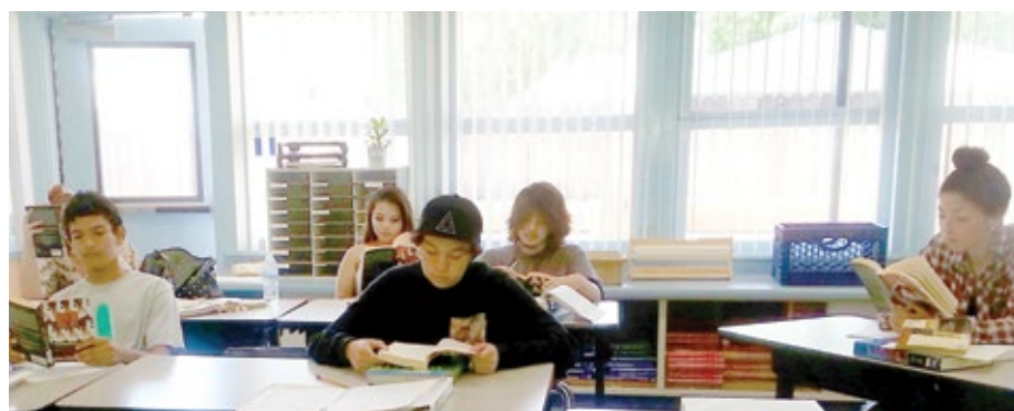
RBLA students reading a novel.