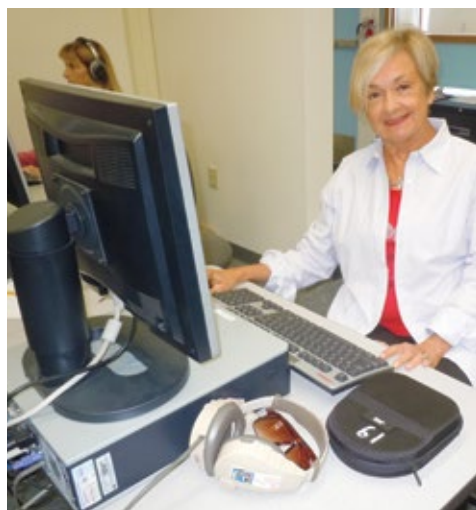
Brain HQ class helps with memory.