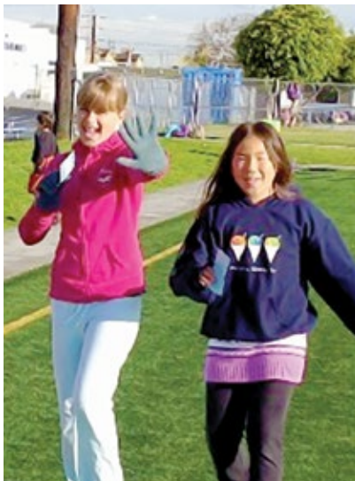
Washington students dancing the Cha Cha Slide together.

Our wonderful PTA also plays a part in keeping our students active. You can find them every Wednesday and Friday out on our field with our Washington Elementary Running Club. It provides a positive and healthy opportunity for our students to develop a routine of physical exercise. Students, parents, teachers, and siblings run or walk as many laps as they can and earn “feet” to add to their running club necklaces. Last year, runners (not including parents, of course) tallied