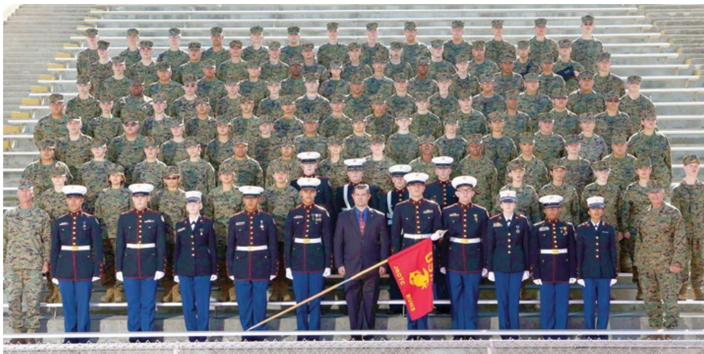
The proud Redondo Union High School MCJROTC Battalion. The cadets gain a sense of pride, dedication to duty, and unit cohesiveness. MCJROTC has received national recognition as a Naval Honor School for the fifth consecutive year. (please see page 12)