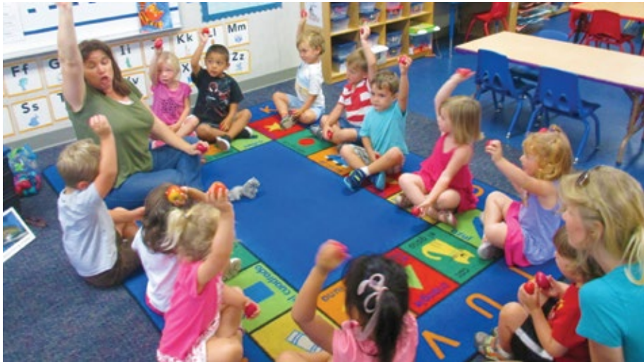
Singing using egg shakers.