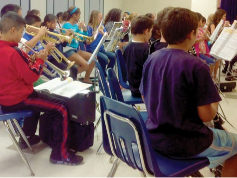
Fifth grade students receive instrumental instruction.

Thanks to the support of Redondo Beach Unified School District and the Redondo Beach Educational Foundation, our first- through fifth-grade students have access to additional music and art education. First- and second-grade students are enjoying visual and performing arts lessons presented by artists in residence from the music center. Tulita third- and fourth-grade students will receive weekly music instruction from a credentialed music teacher. Fifth-grade students have the opportunity to participate in instrumental music; over 70 percent of our fifth-grade students have chosen to learn to play an instrument this year.