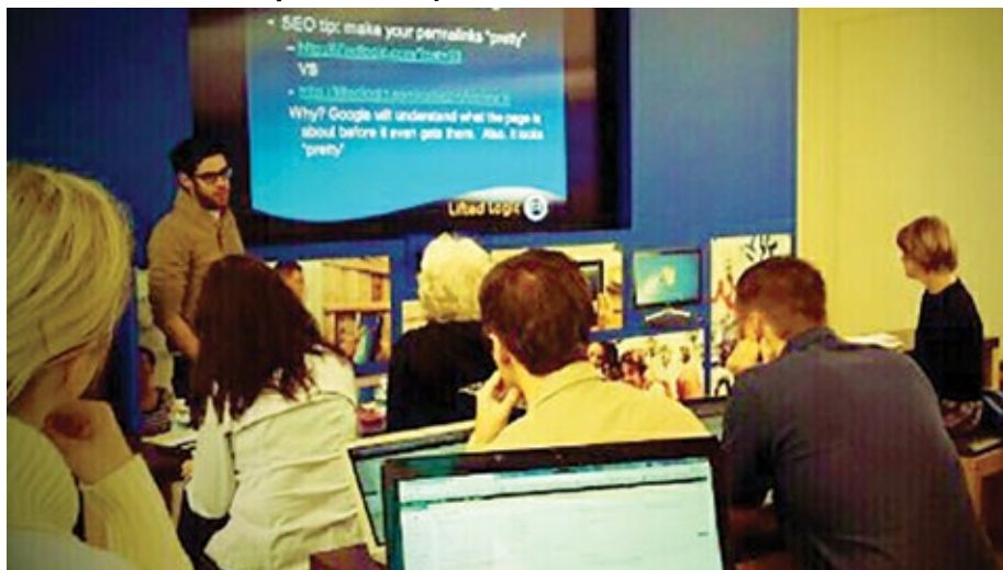
Learning how to use wordpress websites.