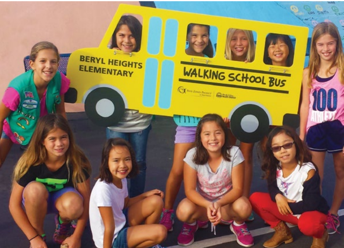
Beryl's Walking School Bus students.

We believe that incorporating these practices into our daily routines will help our students become more active and will encourage them to participate in their own nutrition and healthy living. We want all 478 of our students to get moving, get involved in exercise, and make healthy choices for the rest of their lives.