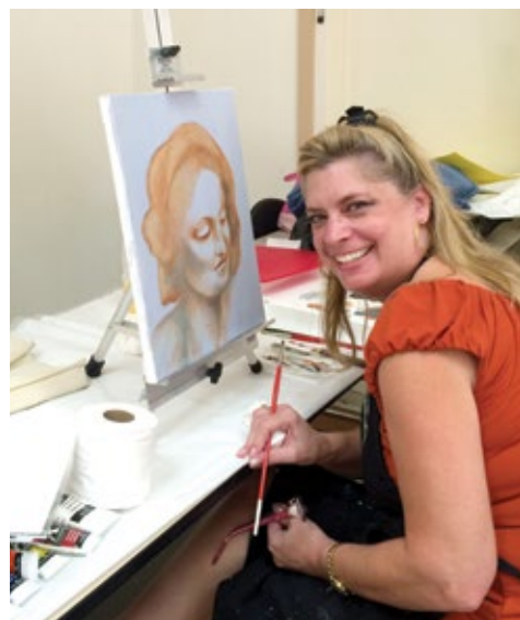
Art Class at SBAS!

Registration for any old favorites or new additions is easy. Just log on to www.southbayadult.org and sign up. Like us on Facebook at www.facebook.com/SouthBayAdultSchool and receive early updates or special offers about classes. The winter term starts on January 5, 2015.