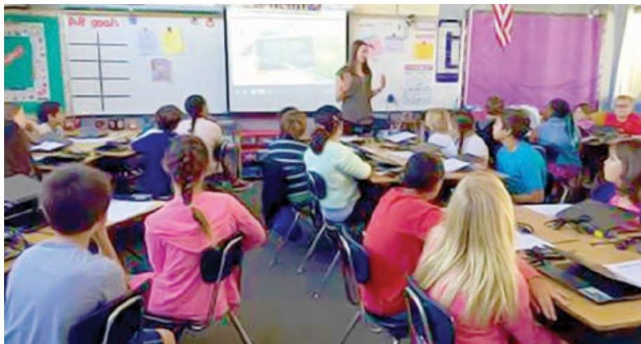
Lincoln 5th graders receive their first Chromebook lesson.

During the initial rollout period, students received their own Chromebook, which was checked-out to them much as with a book from the library. Following checkout, students were immediately given their first Chromebook lesson on digital citizenship and responsible use. From there, students were able to log in for the first time and begin getting acquainted with what will be one of many tools that will be used to engage our new Common Core Standards and better prepare students to be 21st-century learners.