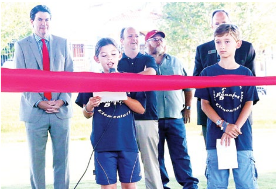
Running Club Ribbon Cutting Ceremony.