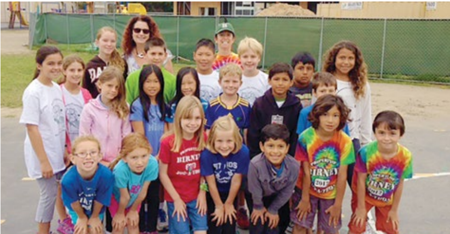
Birney's Weekly Running Club.

These fund-raising efforts are celebrated in a day of fun and exercise. Birney's students ran a total of 850 laps last year, and they are determined to increase that number this year!