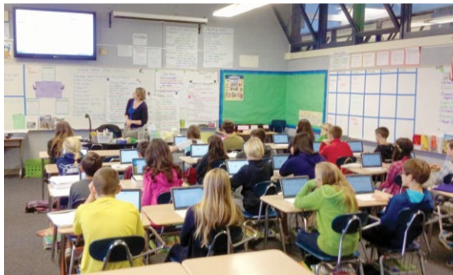
Students at Parras Middle School use their Chromebooks in class everyday.

have better access to safe and reliable databases to conduct their research for papers and projects. When students go to our school Web page at www.parrasmiddle.org , they can access our research databases. Students can also log in and view thousands of safe educational videos on our Web site such as Bill Nye, the Science Guy and Ken Burns' Civil War series. Our language arts and math textbooks are also available for online access. If students are looking for a good book to read, they can access hundreds of novels at our online eLibrary, where they simply log in and check out books to download to their netbooks, electronic readers or electronic tablets.