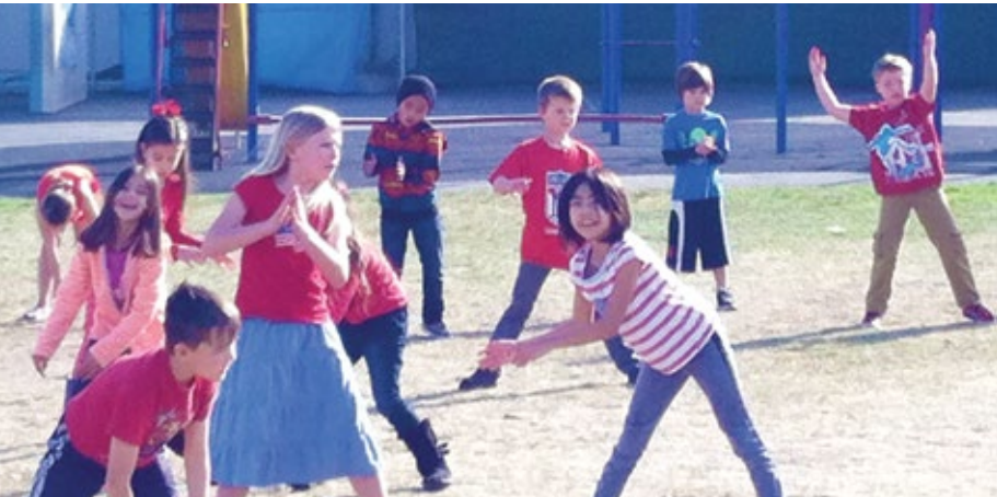
Students "Cherry Picking" during PE.

Birney's efforts to develop and sustain programs that promote healthy living have resulted in our receiving the National Healthy Schools Bronze Award from the Alliance for a Healthier Generation in addition to being recognized as a Let's Move! Active Schools National Recognition Award winner!