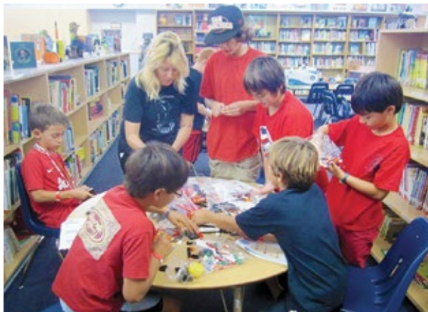
The early stages of sorting through the Lego start-up kits.

As you can see, our students are indeed preparing themselves for their futures. They are learning important skills and having fun!