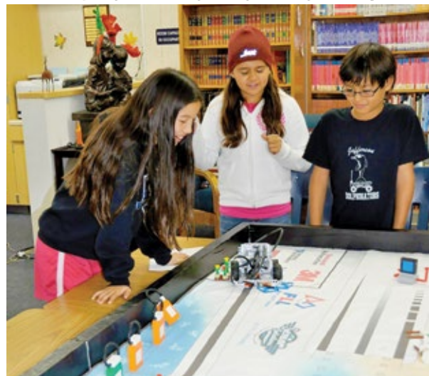
Dolphinator team members from Jefferson Elementary conducting a trial run of their robot.