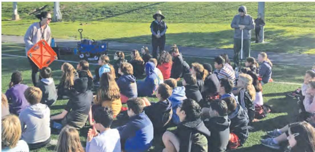
AV's PE teachers in action with our 4th grade students.

This is just a small peek into what RBEF does and the impact it has here at Alta Vista. Of course, all schools in RBUSD are supported by RBEF. I am honored to be a part of this community that cares and invests into the whole child. Your donation to RBEF goes a long way into making RBUSD an amazing place to be.