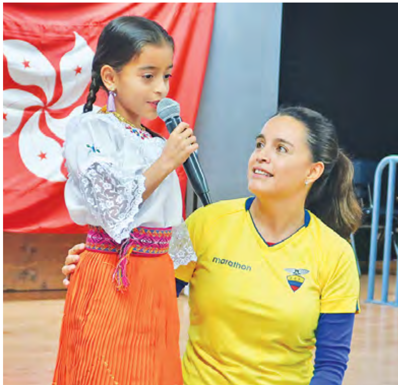
Lincoln International Night is a fun, free event provided by PTA.

It is the PTA's mission to make the Jog-a-thon fundraiser an opportunity to support all of these programs so that they are free or low cost. Thank you to our community, and our Lincoln PTA, for making these programs available and accessible to everyone.