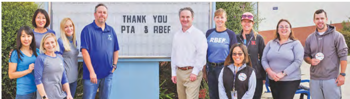
PTA & RBEF team up to help make Jefferson GREAT!

We are grateful to have the support and partnership of both of these organizations here at Jefferson and across the district. We also appreciate the many parent volunteers who give their time, energy and resources to both the PTA and RBEF. Thank you, PTA and RBEF! We are better together!