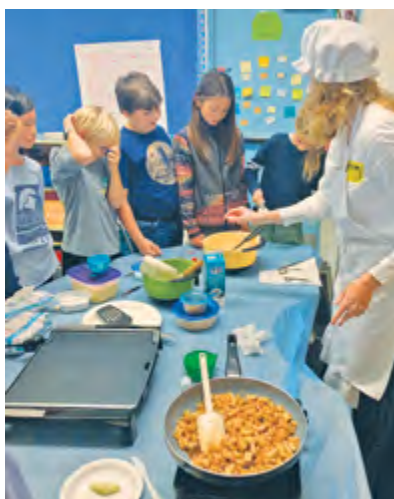
5th graders participating in a culinary lesson brought to us by PTA.

We thank our community for supporting both of these organizations. Both organizations are run by parent volunteers who are dedicated to our school. At Tulita, we all feel a deep sense of gratitude for these two organizations for going above and beyond to support all our schools. Thank you to PTA and RBEF! We appreciate all that you do for our students, teachers, and communities!