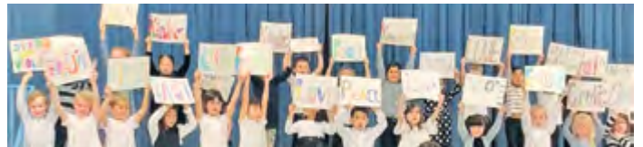
Performance by RBUSD Kindergarten students.

February is the month where families begin the process of preparing to enroll their 'almost five-year-old' child/ren into school for this coming August. All eight of our RBUSD elementary schools are spectacular and we want to encourage our families to be aware of, and attend, the various kindergarten information events we have scheduled. As a Redondo Beach resident, your child is guaranteed a space in kindergarten at your home/neighborhood school. At Washington Elementary School, we also have a District Spanish/English Dual Language Immersion program that is available to any resident through a lottery process. The first date to register a child for kindergarten is Monday, March 2nd. Enrollment takes place in the office at your home school. More information can be found at www.rbusd.org (Parents & Students tab).