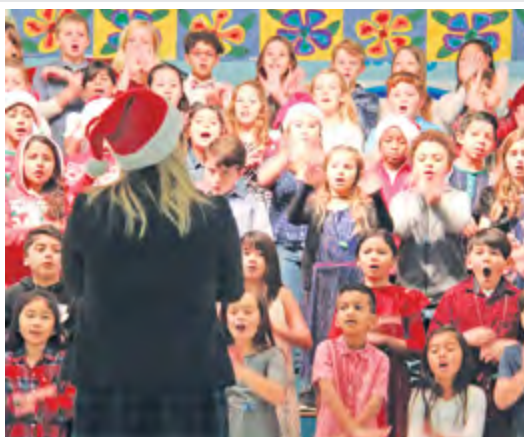
3rd graders show off their musical knowledge at a holiday vocal music concert.

Our PTA provides students and teachers with learning material, assemblies, field trips, newsletters, Hands-On Art, countless volunteer hours, and many other meaningful programs and events. Recently, PTA helped bring Culinary Kids Academy to our fifth-grade students. This allowed our students to experience a full live culinary lesson.