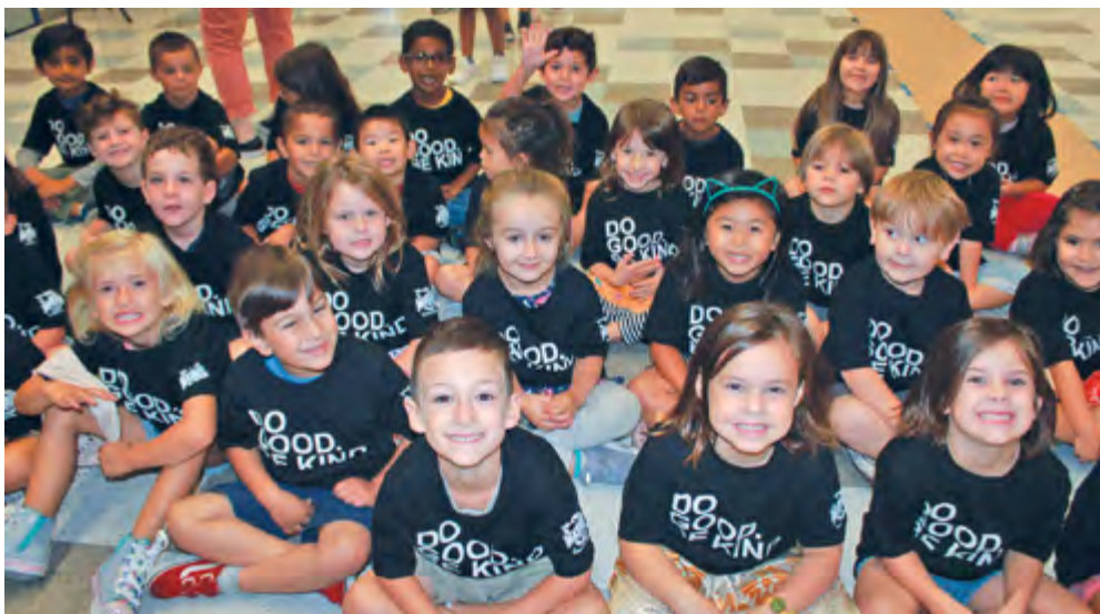
PTA sponsored "Do Good, Be Kind" assembly!

It's a great day to be a Madison Comet, where kindness rules!