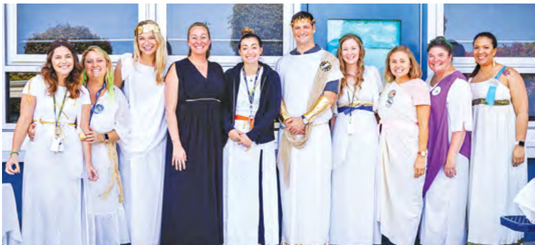
Greek Day 2019. Thank you PTSA for supporting this wonderful yearly event!

Thank you, PTSA and RBEF, for all you do for Parras every year!