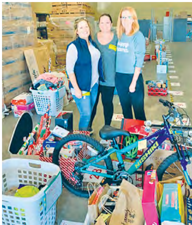
Our wonderful PTA volunteers dropping off items donated by the generous Birney Community for Project Unified to assist families in need.

RBEF and PTA provide the kind of support that reaches each school and student in the Redondo Beach Unified School District. Through RBEF, students in grades one to five receive vocal music instruction. Fifth-grade students receive twice-weekly band instruction. Elementary students receive the support of school guidance counseling and college and career readiness. RBEF has the ability to provide our students with the people and programs that will enrich their education.