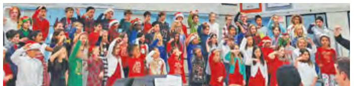
RBUSD vocal music supported by RBEF.

RBEF is a "Charity of Choice" for the BeachLife Festival. We'll have a fun activation table at the event to educate the public about RBEF.