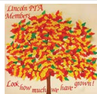
PTA Membership Tree.

The combined work of the PTA and RBEF on behalf of our school makes a significant difference in the lives of Lincoln students every day. Their contributions are strong examples of the successful partnerships that make our school an even better place to be.