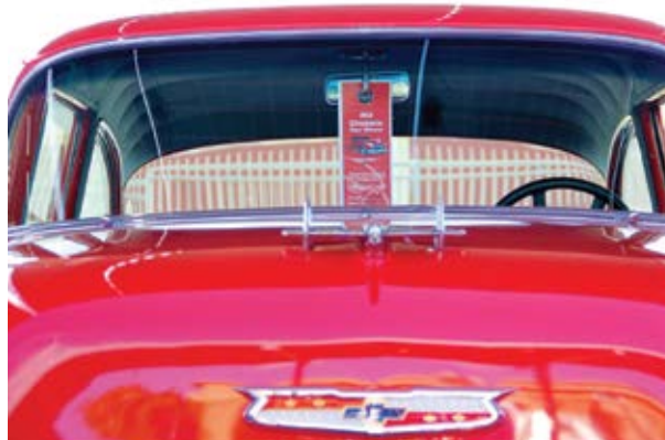
RUHS PTSA volunteers make great events happen, such as the RU Classic Car Show!

Our parents have some unique skills, expertise, experience, and talents that can be used in hundreds of ways to help our RUHS "village" thrive. Being a volunteer gives back to RUHS in ways you can't imagine. So, R-U Involved? Be a PTSA volunteer! Sign up today at RedondoUnionVolunteers@gmail.com .