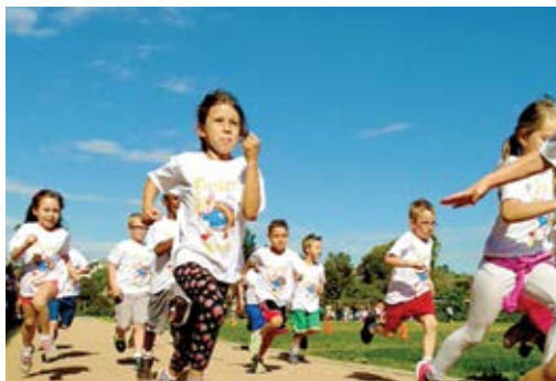
Tulita students participate in the 1st annual PTA sponsored Tulita Turkey Trot.

On October 26, the Tulita staff and students met up to participate in the Pier-to-Pier Friendship Walk to raise money for RBEF and Tulita. This important event not only helps South Bay school districts but also supports a nonprofit organization called the Friendship Circle. On November 19, the Tulita PTA hosted the first annual Turkey Trot, a jog-a-thon organized to raise fund for Tulita PTA. Not only did PTA meet fund-raising goals, but they