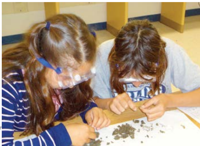
Students in the PTA supported Hands on Science Program.

The RBEF also plays a major role in helping to support student success at Washington.