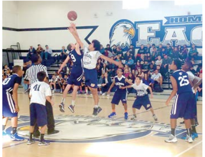
Adams Middle School students intermural competition (funded primarily by the Redondo Beach Educational Foundation).

we want to give a heartfelt thank-you on behalf of our 9,000+ students. If you are not yet involved, I challenge you to make your active participation a personal goal for 2015. Make a difference this year by showing your support and involvement. Thank you!