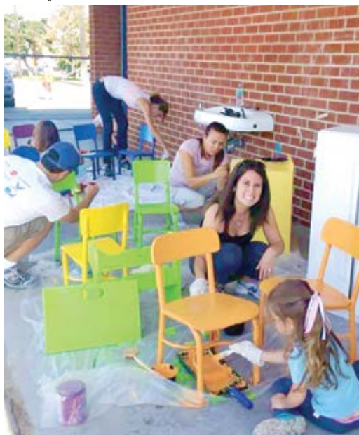
Parents Help Out on Campus Clean Up Day.

3401 Inglewood Ave., Redondo Beach, CA 90278 310/937-3340 • www.southbayadult.org