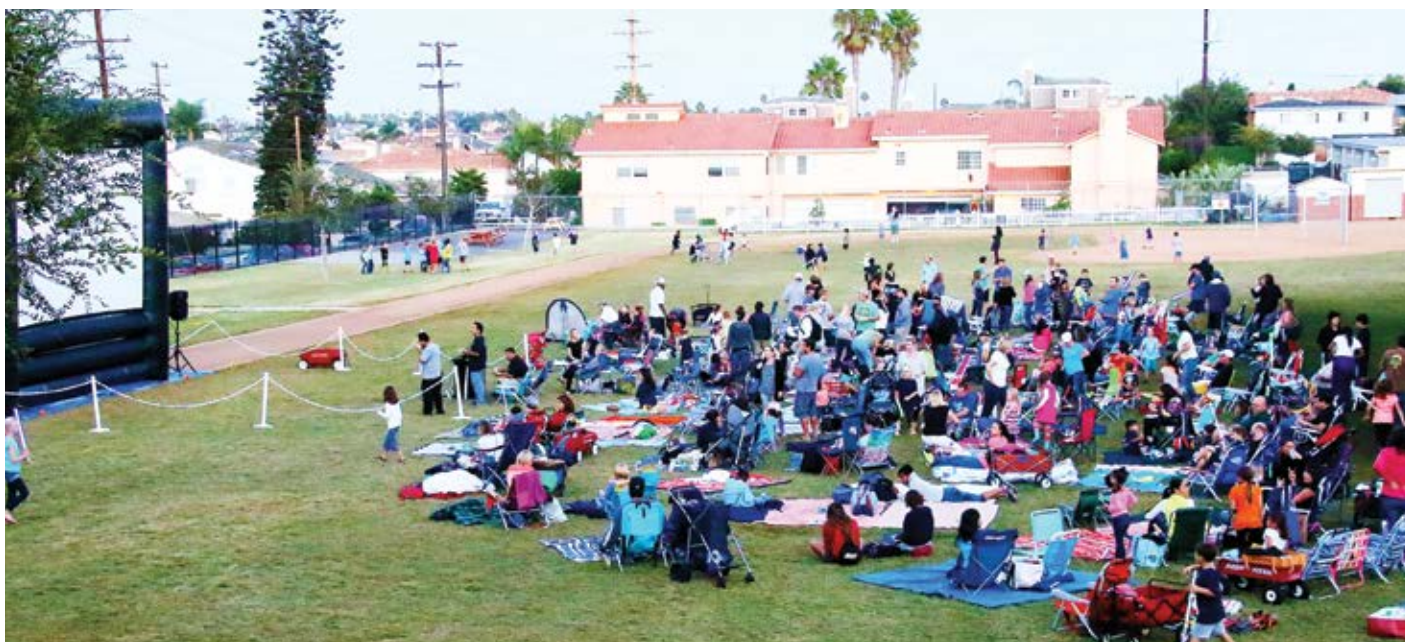
Fall Family Night at Jefferson.

and include: Hands On Art, assemblies, and field trips. In addition, the PTA provides teacher grants to reimburse our teachers for out-of-pocket classroom expenses and curriculum based teaching materials, as well as one large grant for a project proposed by Jefferson Elementary School teachers. In addition to the academic support of the school, PTA also sponsors fun family social activities such as Back to School Ice Cream Social, Fall Family Night, Spring Family Event, Mother/Son Laser Tag, and a Father/Daughter Dance.