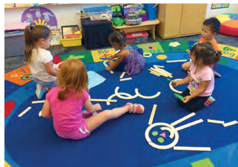
Working together to make a Mat Man.

This curriculum focuses on phonological awareness, listening comprehension, alphabet knowledge, print awareness, and oral language/vocabulary development. It is the same curriculum that we use across the district in our regular kindergarten classes, and our students will experience a seamless transition as they continue on into kindergarten.