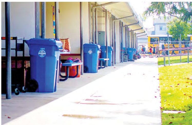
Recycling at Jefferson.

We celebrate all of our students' efforts to help take care of the environment and to continue learning to protect the world we all share.