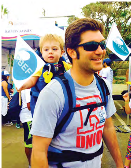
Even babies love RBEF!

RBEF now has more hardworking volunteers than ever before! It is an amazing group to be part of, and you are welcome to join us. We have fantastic donors and corporate partners who are investing back into their community. We are proud to be supporting our great school district!