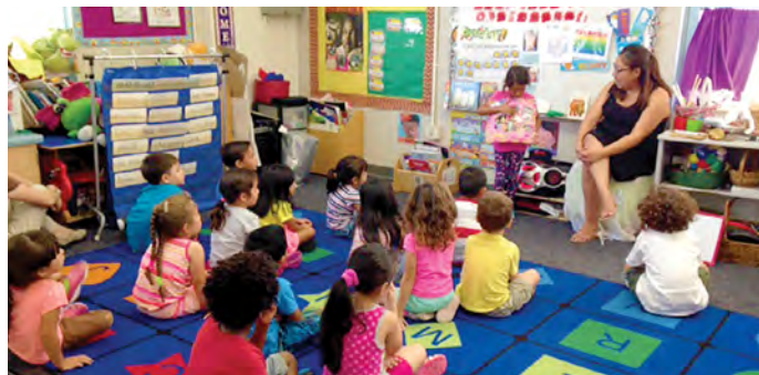
Edison Preschool students during story time.

In fact, reports show that children who attend quality preschools are more likely to graduate from high school, as well as earn higher income rates, and also be more proficient in math and reading by the third grade. Enrolling your child in a quality preschool program can lay the foundation for a successful future.