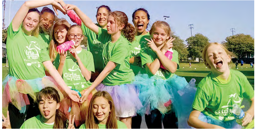
Panther girls having fun being in the GOTR (Girls On The Run) program at Parras.