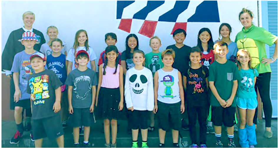
Our elected Birney Student Council leaders, room representatives, and advisors.

Birney Bobcat students are not afraid to try challenging things while giving it their very best. Whether students were elected to a position or were not, I am certain that they all have learned a valuable lesson of trying their very best despite the outcome.