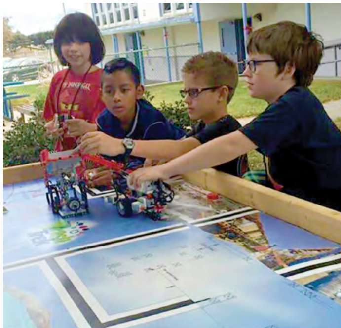
Battle Botz using their engineering skills to problem solve.

After they formally present their findings, the students will participate in the Robot Games at an FLL qualifying tournament. We are so proud of our Washington Battle Botz team and all that they have accomplished. Way to go, Explorers!