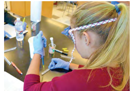
RUHS students experience the breakdown of DNA using gel electrophoresis.

Far from how an ordinary classroom environment accomplishes it, the Biomed Program has given the graduating cohort confidence to work as independent thinkers. I personally plan to continue my love for the sciences in college and one day become a medical professional.