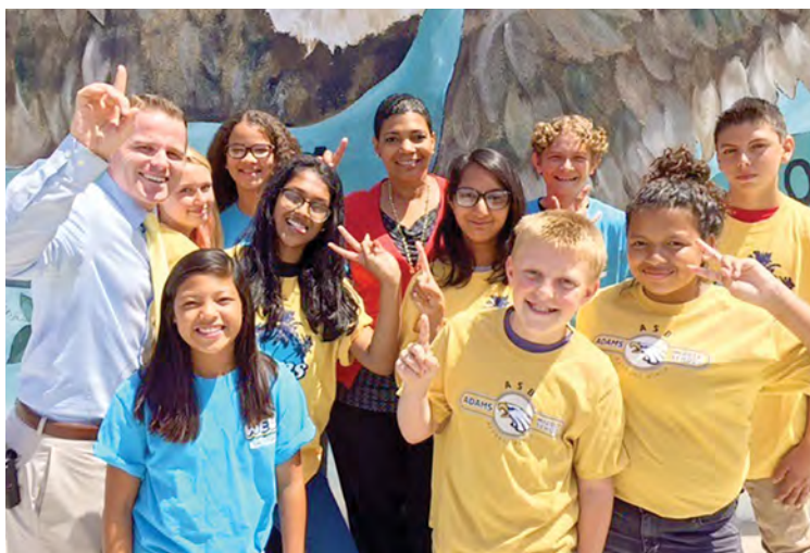
Adams ASB and WEB students coming together to support their school.

As we strive to promote a positive school climate, and provide programs where our students can feel involved, we value the role that these leaders play in helping us meet our goals.