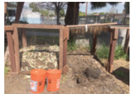
Composting at work at the Lincoln garden.