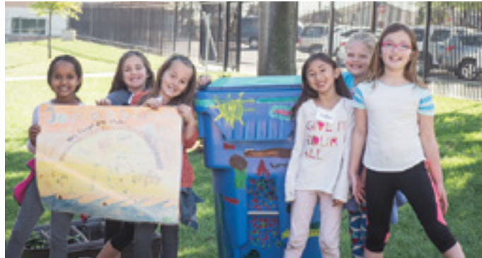
Environmentally Minded Jefferson 2nd graders team-up as the Beach Club.

One school program to highlight is our Green Ambassadors Program. The goal of this PTA-supported program is to encourage students to make environmentally minded choices, such as walking or riding a bike to school or bringing a trash-free lunch. The Green Ambassadors program also aims to help keep our campus looking green and clean. In recognition of Earth Day this spring, they will hold a beach clean-up event on April 22.