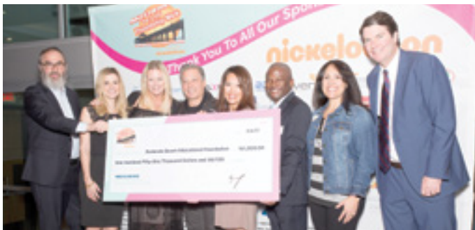
RBEF receives Friendship Walk check.

Join our community at RBEF's Annual Spring Gala on May 12, 2017 at the Portofino Hotel & Marina to Celebrate Redondo Beach's 125th Birthday! Tickets on sale now at www.rbef.org .