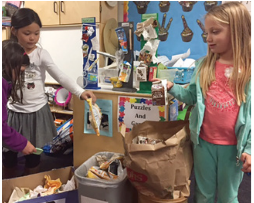
Kinder friends sorting items

At Lincoln CDC, we are proud to be learning and doing our part.