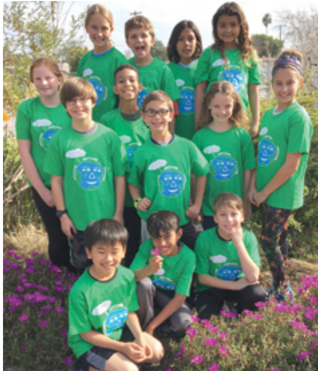
Washington's Green Team