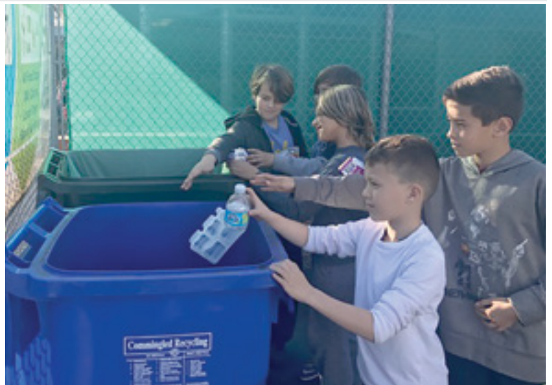
Student sorting their items into the proper bins

Birney students across campus are more aware of their impact on the school, as well as the Earth itself. We