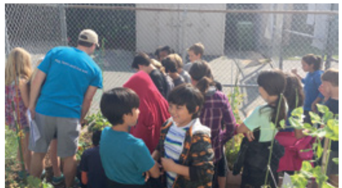
Learning about farm to table in the Tulita Garden.

Our partnership with Beach Cities Health District, Blue Zones and the Alliance for a Healthier Generation supports healthy eating and living. Students are becoming environmentally conscious and healthy. Our LiveWell Kids program ensures that every student gets dedicated garden and nutrition instruction. We also have recycle bins wherever there's a trashcan. We encourage our students to have trash-free lunches, and our fifth-graders commit one day a week to sort trash at lunchtime and keep our campus clean and green!