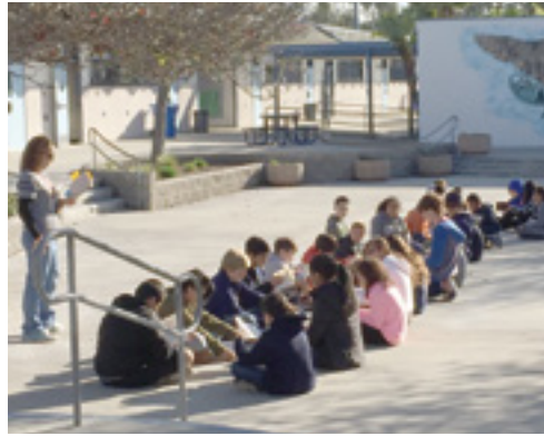
Adams students enjoying an outdoors classroom

Adams' wellness practices have greatly improved as