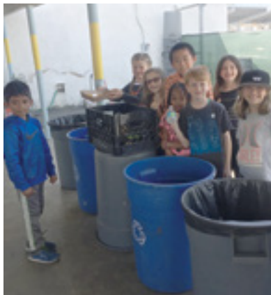
Lincoln students help their peers sort trash at lunchtime.

Our lunch “trash sorting” helpers also get rewarded with Lincoln Leader slips, but they all say that they would do it anyway just because “It’s fun!” We love helping our Earth, and that is the best reward of all.