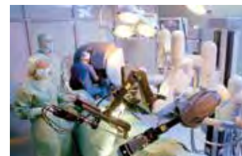
The robotic da Vinci Surgical System will be demonstrated at the O.R. Show & Tell

Take this opportunity to get "hands on" knowledge about the latest operating room technologies. At Torrance Memorial's popular "Operating Room Show & Tell," state-of-the-art surgical equipment and instruments will be on display while surgeons and other medical staff members demonstrate advanced surgical technologies, including da Vinci robotics and minimally invasive laparoscopic surgery.