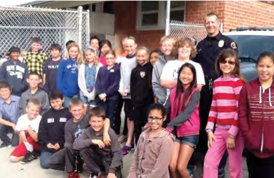
5th graders learning about a career in law enforcement.

All of our Tidalwaves have what it takes to attend college, pursue an inspiring career and enjoy a bright future!