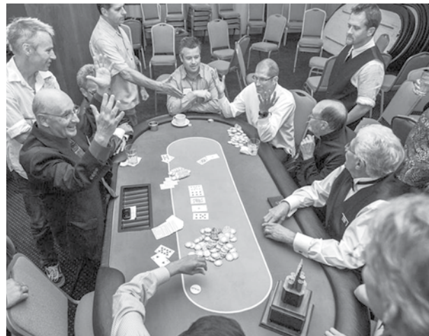
RBEF's 2012 Poker Tournament

If poker is not your game, come play a few hands of blackjack to get your casino fix all while supporting RBEF. There will also be plenty of appetizers, great conversation, and a private cash bar for all who attend.