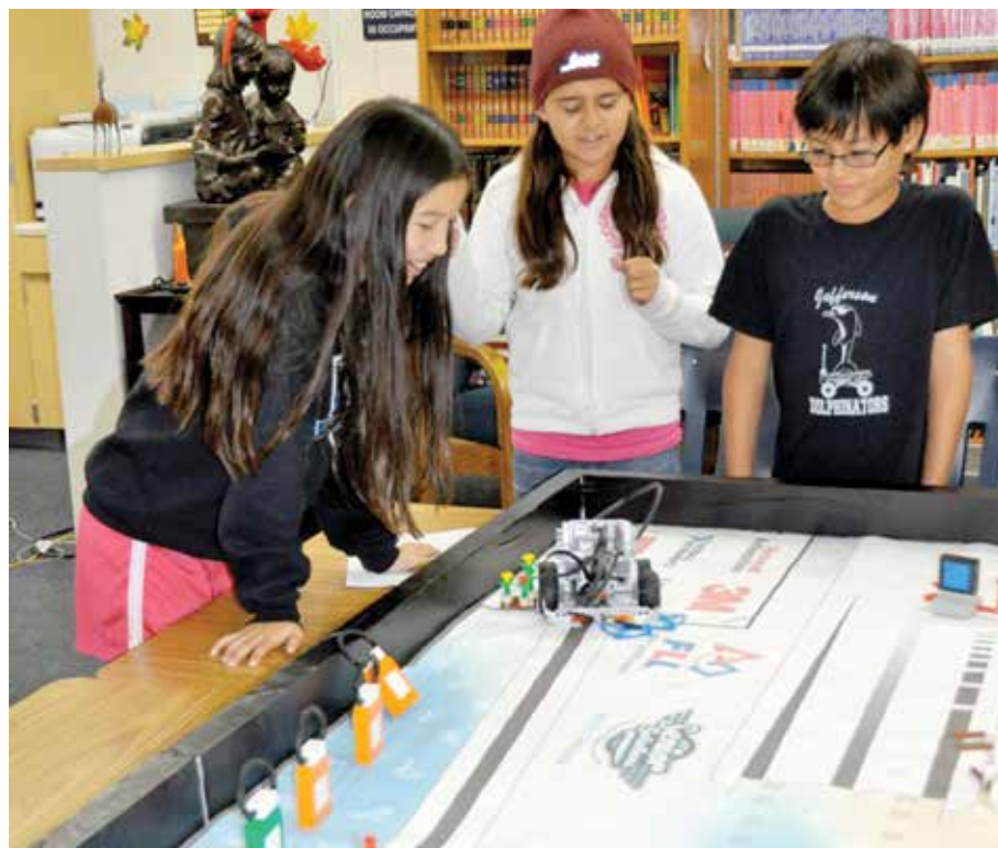
The Dolphintors Robotics Team constructing their Robots.

which builds on engineering and teambuilding skills while inspiring innovation through the nurture of comprehensive aptitudes, including teamwork, self-confidence, communication, and leadership.