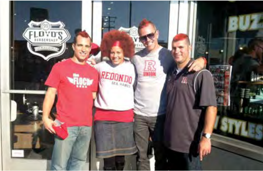
RUHS Administrators keeping their promise!

During approximately four weeks in April and May, our students will have the opportunity to show exactly what they have learned during the 2012–2013 school year. Students will be tested in English language arts, mathematics, science and history. We expect all of our students to be successful during testing; it is our goal for every student to achieve, at minimum, proficiency in each content area.