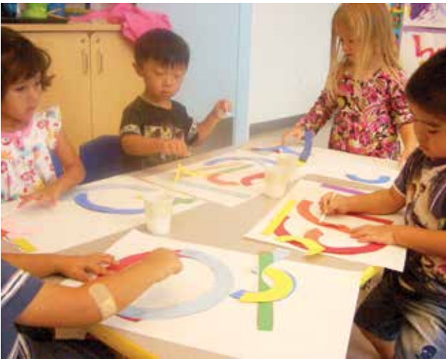
Making Mat Man