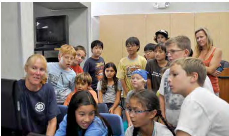
The Dolphintors learning an engineering program

The robotics team has been an inspiration for students to further explore interests in science and technology. This program engages students as a motivating, mentor-based model,