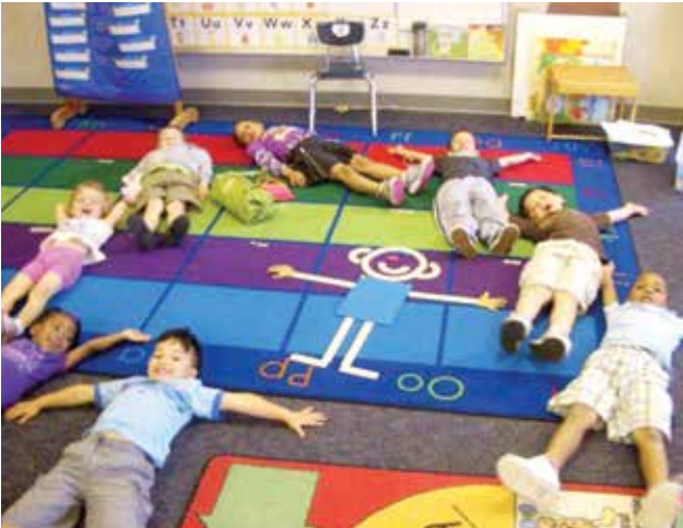
We are all Mat People