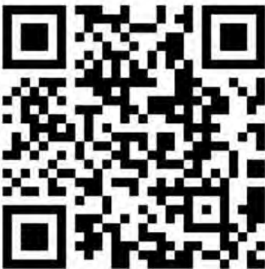
Scan our QR Code and visit our website.

Just like Marta, all of our students are eager to learn and focus on improving their English skills. Visit us on the Web and learn more about all of our lifelong learning classes.