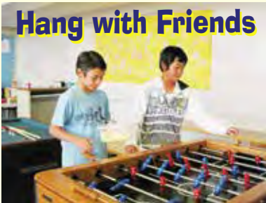
Hang with Friends