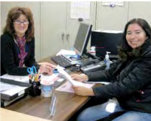
Student love the individual attention in distance learning.