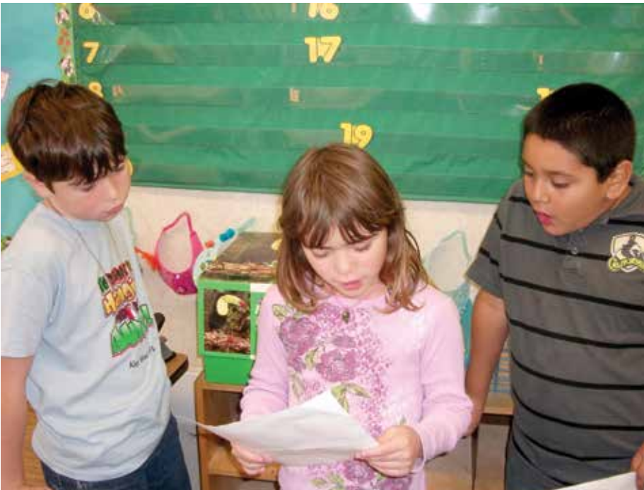
Students prep for the STAR Tests