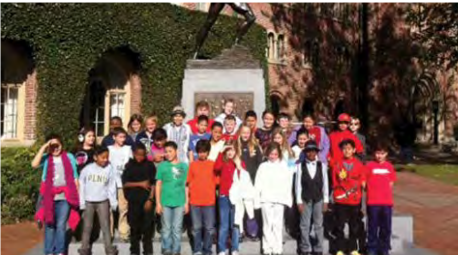
Madison students happily pose with Tommy Trojan on the USC campus

Some of the colleges and universities we visited were Pepperdine (Jefferson Elementary School), USC (Madison Elementary School), UCLA (Alta Vista, Birney, Beryl and Lincoln Elementary Schools), CSU Long Beach (Birney and Washington Elementary Schools), Loyola Marymount University (Lincoln Elementary School), and Chapman University (Tulita Elementary School.)