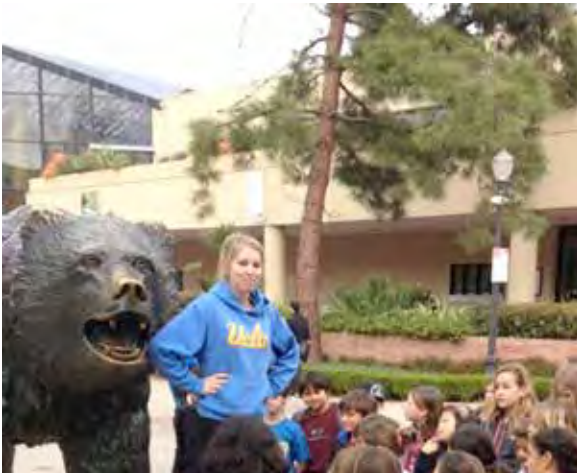
Alta Vista students begin their UCLA tour next to the Bruin Bear

These questions allow us to begin the college-going conversations at an appropriate developmental level for our students. The answers we provide high school students are very different from the level of detail we offer to the younger children. But the important point is that we begin our conversations early and often, and continue to keep the educational torch lit for everyone. Our students were deeply inspired by these visitations, and we are all grateful to the RBEF for supporting them.