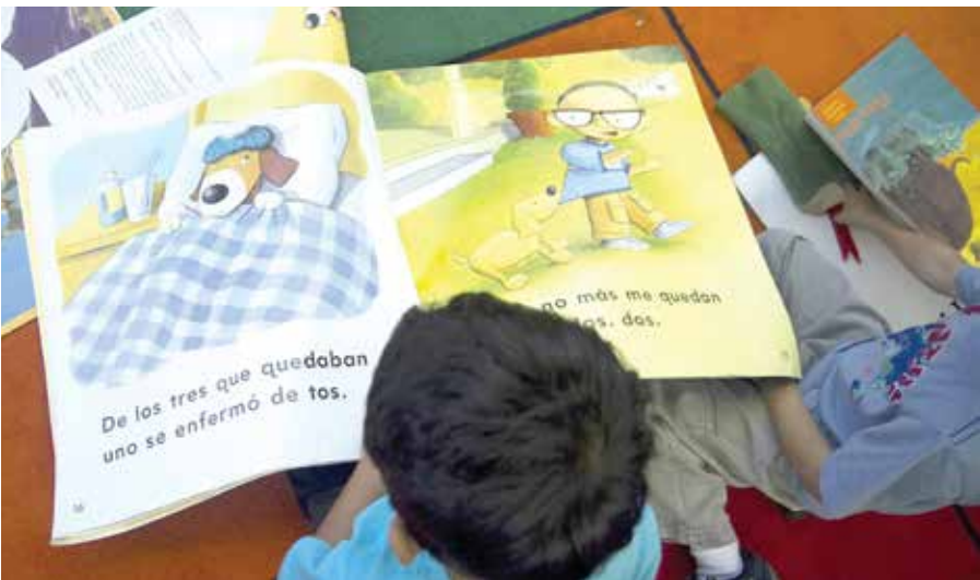
A dual immersion kindergarten student reads a book at his level during Readers Workshop.