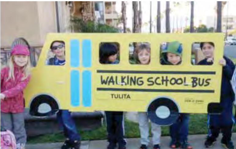
Tulita Elementary School kids and the Walking School Bus

multiple predetermined routes. Two or more trained volunteer coordinators are assigned to each route and pick up groups of children along the way, safely delivering them to their destination.