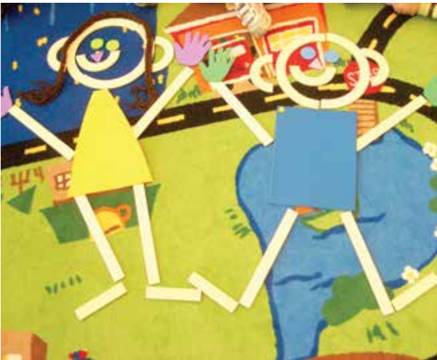
Mat Man and Mat Woman

We are very excited about these great curriculum pieces, and we encourage you to stop by one of our centers to see these great programs in action.