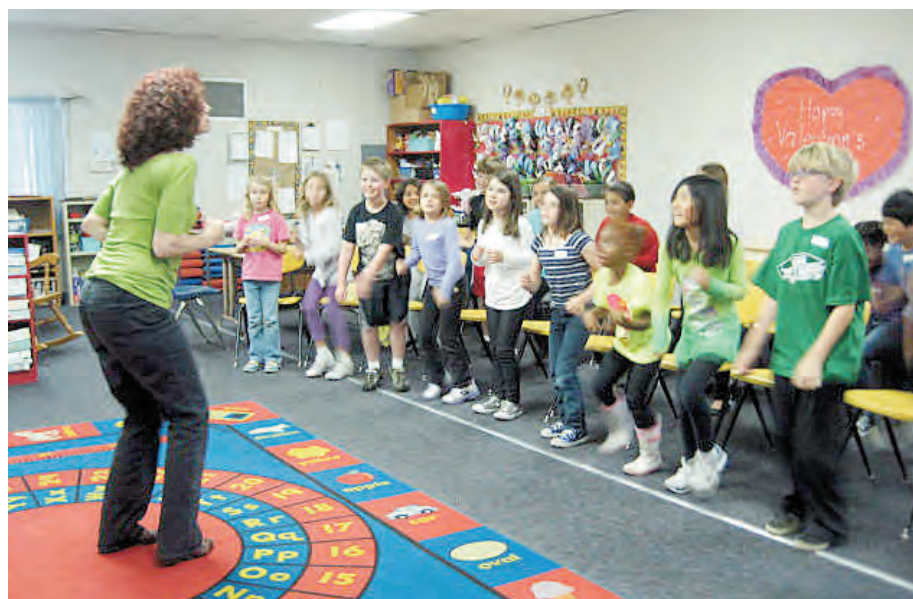
Second grade students participating in a theatre lesson.