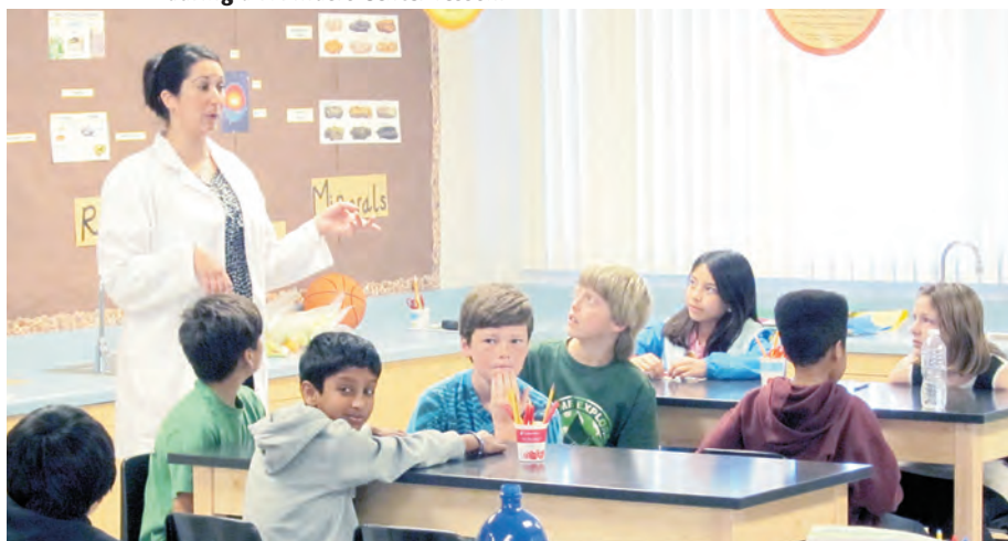
Jefferson Science teacher leads a fifth grade class in discussion.