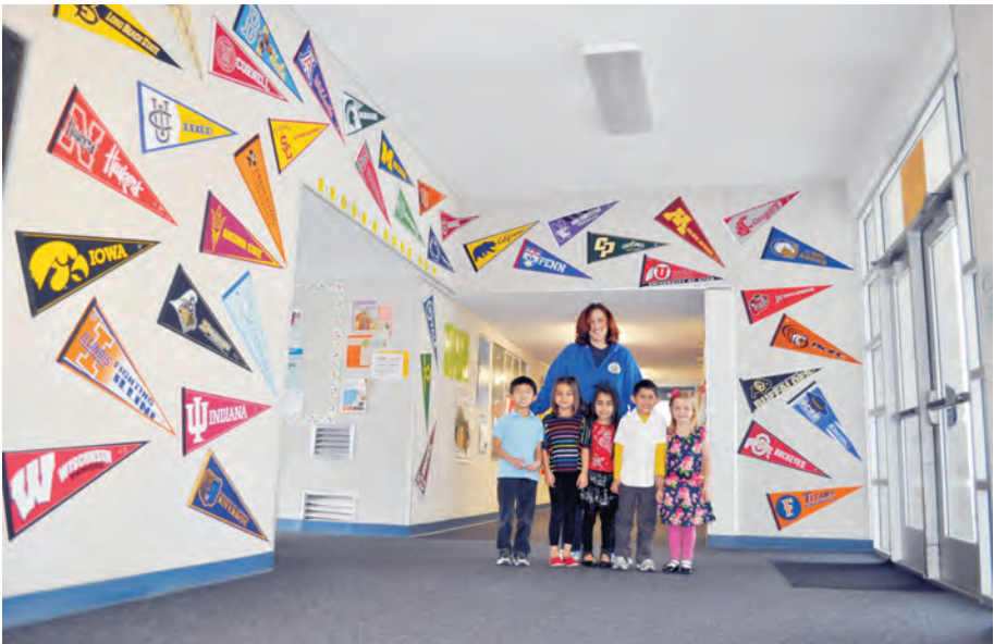
Washington Kindergartners are college bound with some help from RBEF