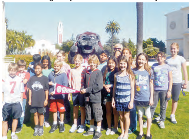
College bound Lincoln students visit LMU.