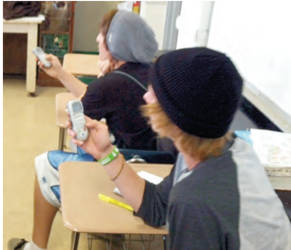
Biology students use student response clickers, which means everyone participates at the same time.

Add your drop, because every drop counts when you're raising the tide.