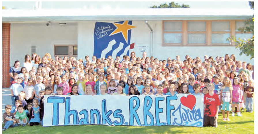
RBEF Champion School 2010 and 2011 - Tulita loves RBEF!

RBEF is seeking donations to support districtwide programs that could not be offered in Redondo Beach schools without additional funding and support. Please donate whatever you can to this worthy cause. As our district and state face ongoing budget challenges, we are forced to rely on support organizations such as RBEF to help provide the enriching and inspiring programs we feel are essential for Redondo Beach students. Without the support of RBEF and generous donors in our school and district community, our students would be missing out in so many ways.