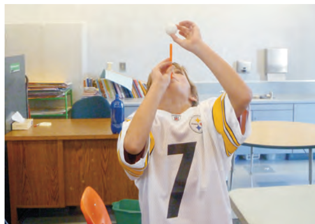
Lincoln fifth grader performs Hands on Science experiment.

As the month of April begins, the RBEF annual donor drive ends. This drive is a major source of support for RBEF and the many programs it supports. If you have yet to make a contribution, please consider doing so. Every contribution helps make a difference, large or small, so please add your drop, because every drop counts when you're raising the tide.