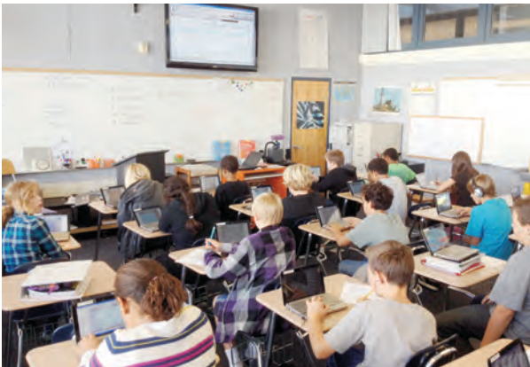
The number of laptop computers for student use has increased, thanks to RBEF!

Parras Middle School’s students have benefited directly from the financial support of the Redondo Beach Educational Foundation (RBEF). Through our parents’ and community’s support of RBEF, our school has been able to target the specific needs of teachers, students, and the school as a whole. Some of the things we were able to obtain with RBEF’s financial assistance include equipping our science lab with eight computers; purchasing hands-on science materials; funding our after-school intermural sports program; purchasing 20 laptop computers for student use, funding Naviance to help prepare students to be college ready; funding our Safe School Ambassadors program to end bullying; purchasing new curriculum materials for our Spanish program; purchasing a schoolwide video-distribution system; purchasing a student-response clicker system for math; purchasing A–G materials to distribute to families; and much more!