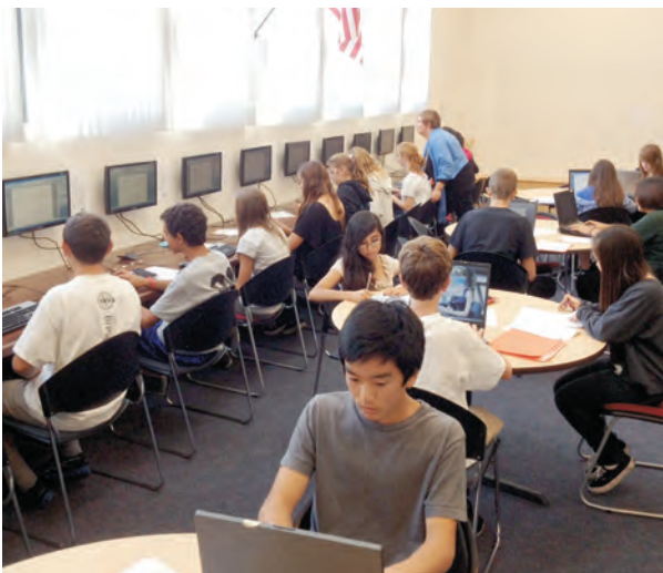
RBEF has helped to support the use of technology in our school.

As our school’s principal, I greatly appreciate our education foundation’s involvement with Parras Middle School. RBEF’s involvement with our district over several years has resulted in hundreds of thousands of dollars being directed to our community’s schools. As such, we have continued to move forward, going from good to great. Please continue to support the educational foundation of Parras Middle School and Redondo Beach Unified School District. Without RBEF, times would be much more difficult for our students, and they would be receiving fewer resources to benefit their education. I encourage you to add your drop, because every drop counts when you’re raising the tide.