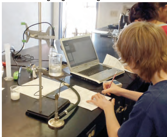
Eighth graders using updated lab equipment.

Other mini-grants included picture-it and pix writer software programs to help students with vocabulary and speech development, and K'Nex to build simple machines and roller coasters for the mechanical engineering club.