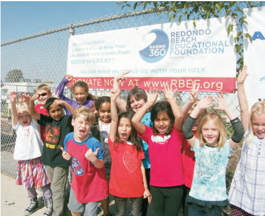
Madison students getting behind the RBEF 360 Donor Drive

You may have seen the RBEF posters around school asking you to donate $360, which is roughly a dollar a day for this spring donor drive. But if you are unable to make this $360 tax-deductible donation then please consider giving what you can.