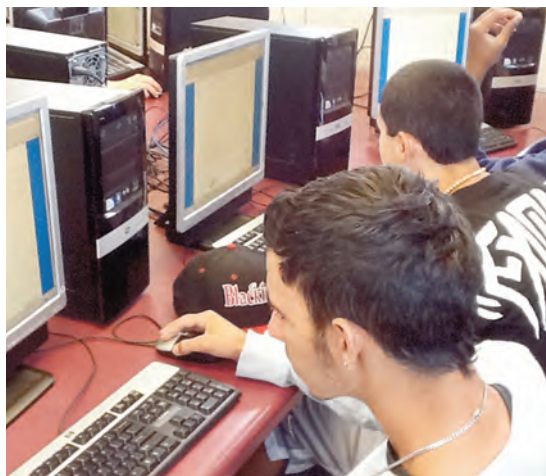
Eighth graders using Naviance.

At Adams Middle School specifically, many of our teachers have been awarded RBEF mini-grants to enrich the learning experience. Our science department was also awarded a grant to upgrade their lab with new materials for inquiry-based hands-on time.