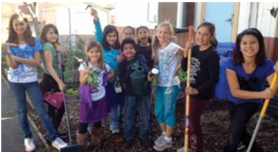
Beryl students get their exercise gardening.

work and determination, we received the Bronze award from the Alliance for a Healthier Generation, and it is evident that the staff and students are learning about physical fitness, eating healthier, health education, and school policies and procedures. Through LiveWell lessons taught by parent docents, students are learning the value of good nutrition and how it affects their minds and bodies in order for them to be successful.