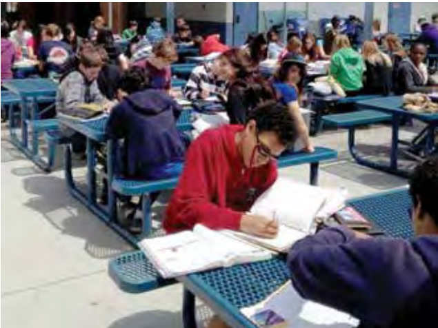
Students studying during open tutorial period.

We are looking forward to the new year, and to reaching even higher levels of achievement!