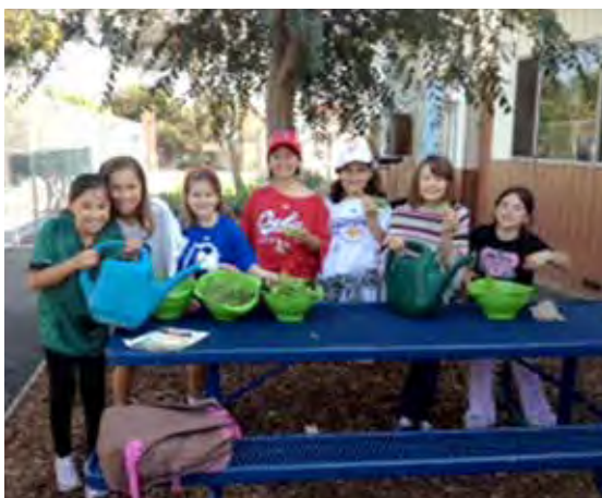
Beryl students plant, harvest, and reap the benefits.