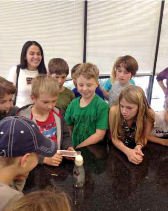
Students learning about pressure change.

The students also recently brainstormed ideas about how to make Tulita a better school. Those with similar beliefs were placed on a team and matched up against opponents. The groups planned and prepared thoughtful debates on the following topics: changing the school lunch routine, adding vending machines to campus, revising the school start time, and replacing teachers with robots.