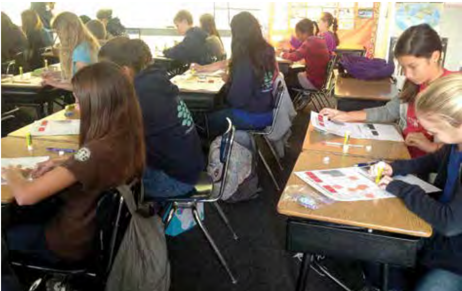
Adams 7th graders completing their 6 year plan.

Be sure to save money for college now, too. As tuition costs rise it is imperative that most parents plan early. Consider a 529 plan or a Roth IRA account, or talk to your bank for more options.