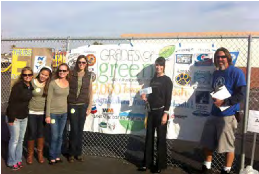
Jefferson receives recognition from ReproCycle during Grades of Green contest.