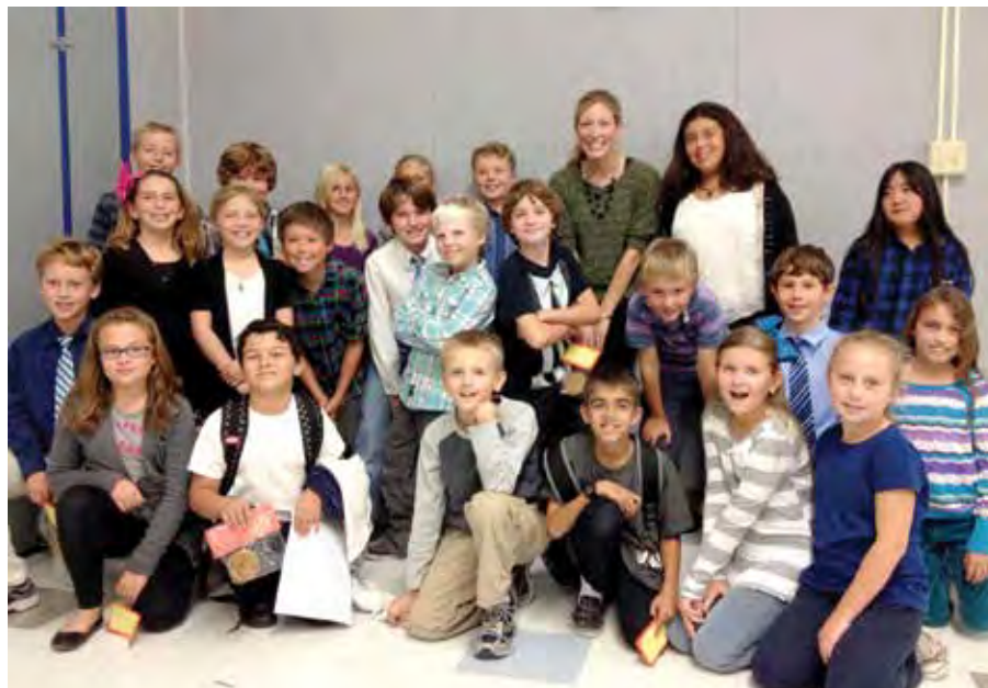
After school enrichment class after presenting their debates.