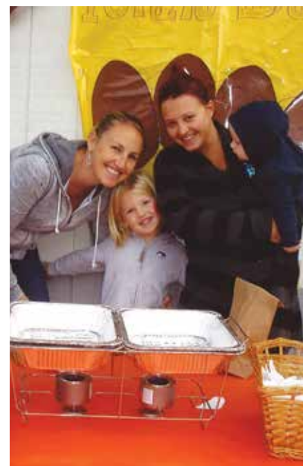
Parent volunteers at fall carnival

Our first annual Fall Harvest Carnival did just that! Our goal was to provide an opportunity for children to experience giving to others and gain a sense of appreciation for others within our school community. In addition, our children benefited as they interacted with families and fellow peers in activities such as face painting,