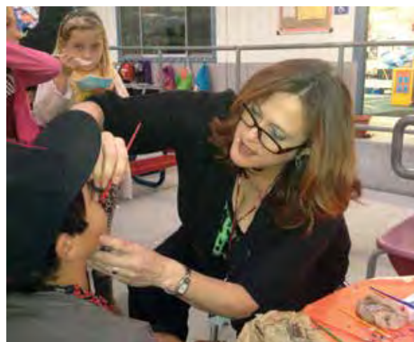
Face painting at Fall Carnival

pop the balloon, pumpkin ring toss, and harvest wheel of fortune. What a wonderful way to encourage, learn, and build an appreciation of community giving for young children, while reinforcing the importance of family bonding and fellowship with friends! The overall message is: "You are valued and important enough to have an impact on others!"