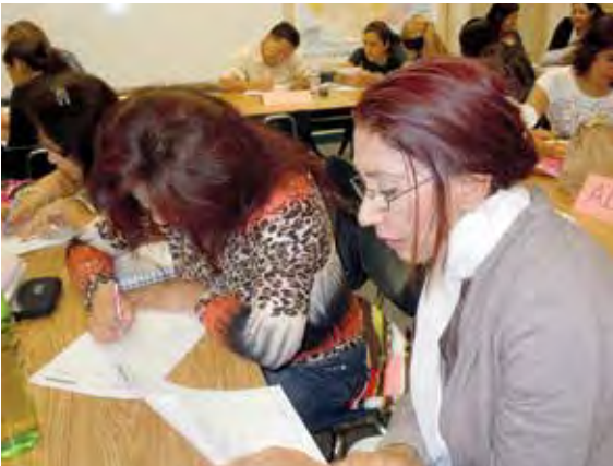
ESL students work together to learn English.

At SBAS, we offer classes for adults of all ages. Some are for fun, and some can help you in the job market. Students can learn English as a second language, learn from home with distance learning, or complete their high school diploma. We offer day and evening computer classes to help you update your skills, brain-fitness classes to improve your memory; and fitness classes to keep in shape. Our most popular classes are in the parent education/preschool program. Families with children from birth to age five can sign up for parent-and-child participation classes. Classes are offered during the day and at night for working parents. The adults learn parenting techniques and make lifelong friends, and the children get a great preschool experience.