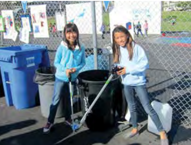
Students attend to the lunch sorting stations.

practices on campus; and ensuring that school policy and practices are consistently in use on campus. Through service learning and community partnerships, the program fosters personal growth and leadership skills to help our students tackle and the most critical environmental issues facing our planet and their future.