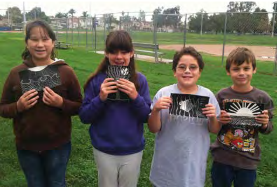
Lincoln students with Hands On Art projects.

There is no question that art education is valued at Lincoln. The strength of the programs we provide to students is a credit to the combined commitment that our teachers, parent volunteers, PTA, Educational Foundation and Board of Education have made to enrich the lives of our students.