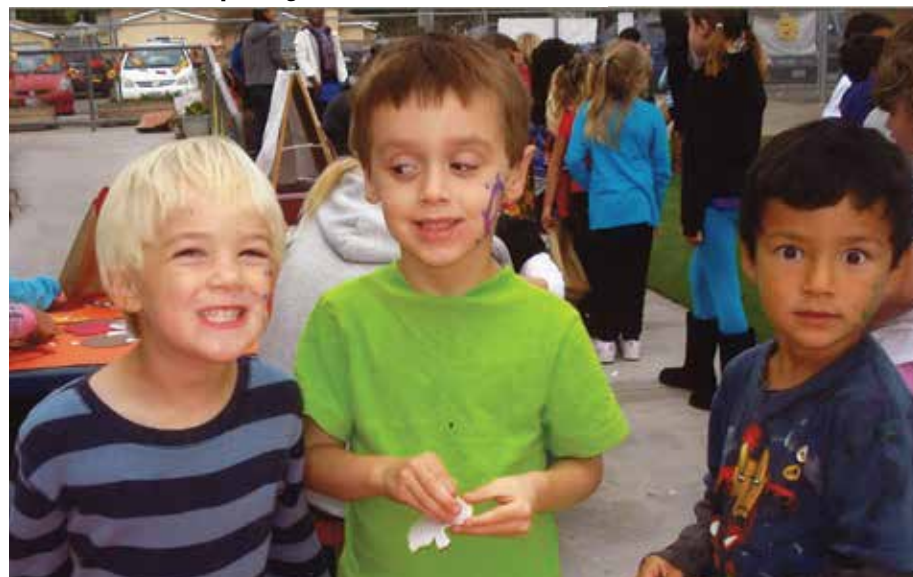
CDC students enjoying fall carnival

pop the balloon, pumpkin ring toss, and harvest wheel of fortune. What a wonderful way to encourage, learn, and build an appreciation of community giving for young children, while reinforcing the importance of family bonding and fellowship with friends! The overall message is: "You are valued and important enough to have an impact on others!"