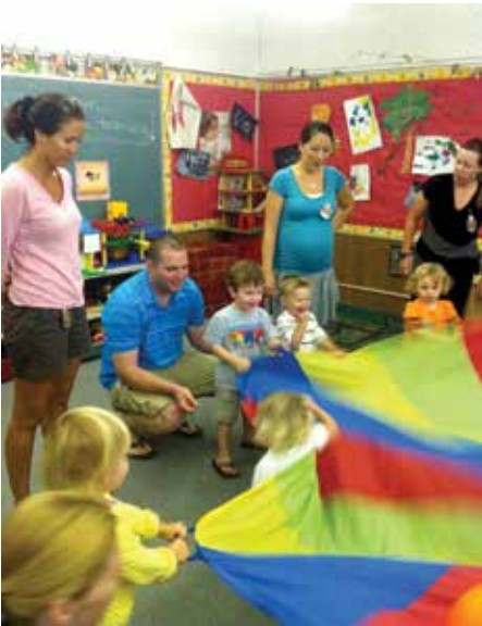
Fun times in the Toddler Class.

The South Bay Adult School believes in lifelong learning, but you may wonder how that applies to the families in our community. Lifelong learning classes can enrich and improve your life. They help you find different interests or hobbies, grow in your career, or learn something fascinating and new. More than 2,700 adults took classes last term, and we appreciate your support. This winter, we have some exciting new classes such as American Sign Language, Basic Makeup Application 101, Introduction to Filmmaking and many new online classes. We invite everyone to choose to learn and take a new class.