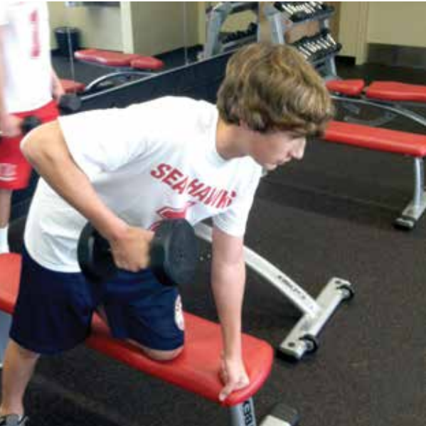
RUHS student working towards passing the PFT and achieving his own fitness goals

At RUHS it is our goal to improve our PFT pass rate from 78 percent in 2011 2012 to at least 83 percent in 2012 2013. Our PE courses and team sports enhance student fitness and health. Students who are actively involved in their PE courses in either a sport or outside of school demonstrate little or no difficulty in passing this state-mandated test.