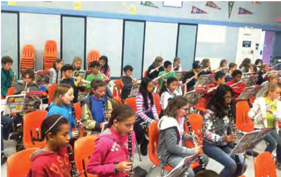
Lincoln 5th Graders participate in the instrumental music program.