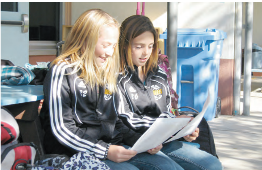
Fifth graders practicing "thinking about thinking" on their oral reports.