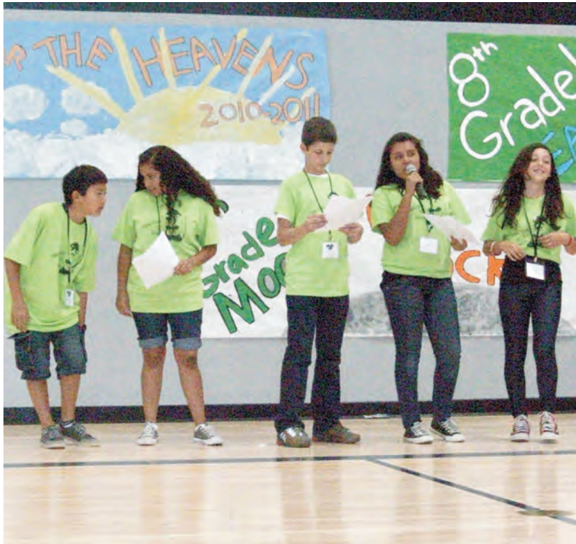
Adams Middle School Student Council performing a skit during their first spirit rally.