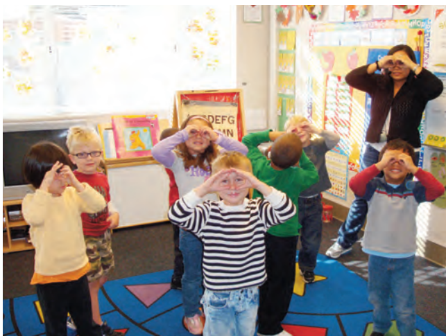
BEACH BUDDIES students incorporating movement during circle time.