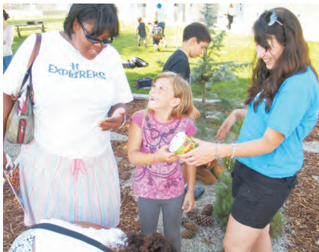
Releasing ladybugs into our garden.