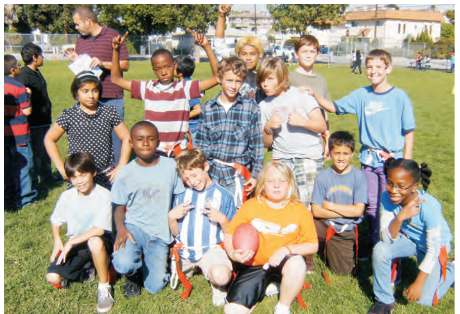
Madison's 4th and 5th grade Flag Football Noon League participants.