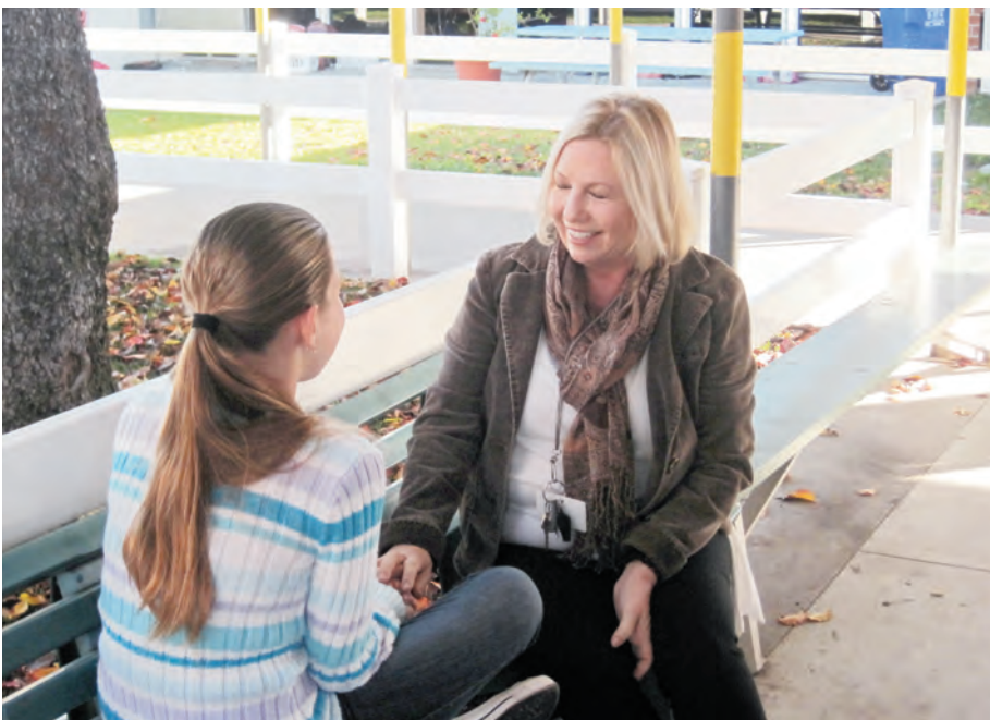
A relationship with a caring adult can make all of the difference for a child at school.

Recently at Birney we implemented a program called “invisible mentoring.” First, we listed all the students at Birney and the staff put red dots next to the names of students they already had a relationship with, beyond just hello or knowing their name. Each adult then made a commitment to reach out to one or more of these students with few or no dots and make a connection based on common interests, ease of accessibility, or other natural connections. In January the adults will learn and use the child’s name, talk with the student frequently, and perhaps ask them to help them with a project. Because the project is “invisible” mentoring the adult does not alert the child that they are part of this outreach. The key to success is to interact with the child at least once a week and be focused, patient, consistent, and, above all, committed. By reaching out to the quieter, less conspicuous children, Birney Elementary is truly committing to leaving no child behind.