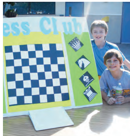
Chess Club and Cooking club Adams students recruit during club rush.

Please encourage your child to participate in school activities and events. There truly is something for everyone. For additional activities, please check the Adams Web site at www.adamsmiddle.org .