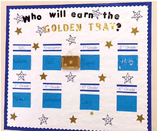
One of our new Positive Incentives.

To enhance an already great school culture, Palm Tree will become proficient in implementing all PBIS strategies and tools to ensure a completely positive school culture. The goal is to have a safe and inviting school environment for students, staff, parents, and the community.