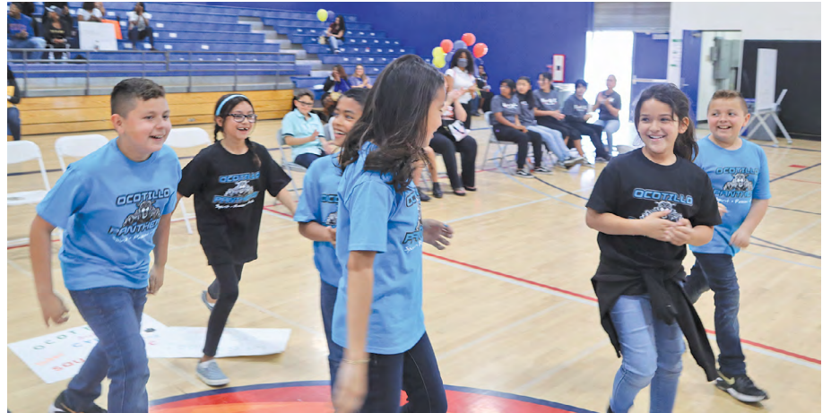
Ocotillo team runs to collect their first-place trophy.

The Black Knowledge Bowl teams were given a study guide—all the information was in the study guide. Teams from elementary and middle schools competed in the same competition. Teams demonstrated their knowledge of countries, flags, cuisine and inventors, to name a few categories. During each of the five nights of competition, the scores were very close—sometimes, one question determined the winner. At the end of the final round, the winners were Palm Tree Elementary in first place, Dos Caminos in second place and Palmdale Learning Plaza in third place.