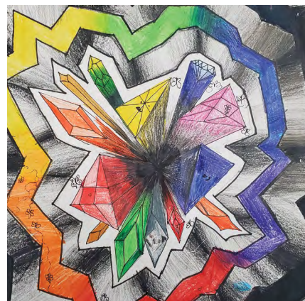
Dahlia - Cactus Magnet Academy