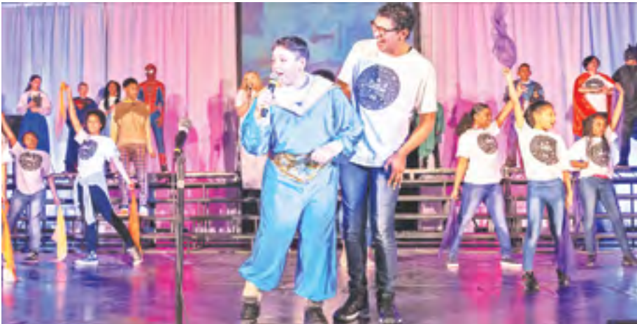
Hidden talents were revealed as students sang, danced, and performed!

The Palmdale PROMISE (a strategic plan that provides opportunities for students to pursue remarkable opportunities to marshal inspiration and imagination for success and engagement) proves to be more than a district plan that is hidden in binders or a poster that hangs on a wall. It is a plan that is more than just hoping that “every student leaves ready for success.” It provides various choices and different paths for students to succeed. It is a promise that engages students as they explore and foster their talents to enter high school with more confidence and a passion for lifelong learning.