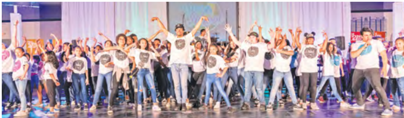
The Cactus gym was packed on the night of March 30th for a world-class performance by the Young Americans and over 100 PSD students.