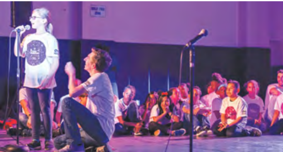
Students showcased their love of the Performing Arts!

The Palmdale PROMISE (a strategic plan that provides opportunities for students to pursue remarkable opportunities to marshal inspiration and imagination for success and engagement) proves to be more than a district plan that is hidden in binders or a poster that hangs on a wall. It is a plan that is more than just hoping that “every student leaves ready for success.” It provides various choices and different paths for students to succeed. It is a promise that engages students as they explore and foster their talents to enter high school with more confidence and a passion for lifelong learning.