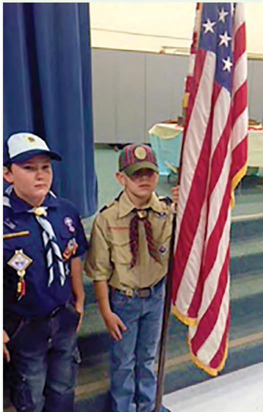
Cub Scout Pack 145 color guard presented colors to open the competition.