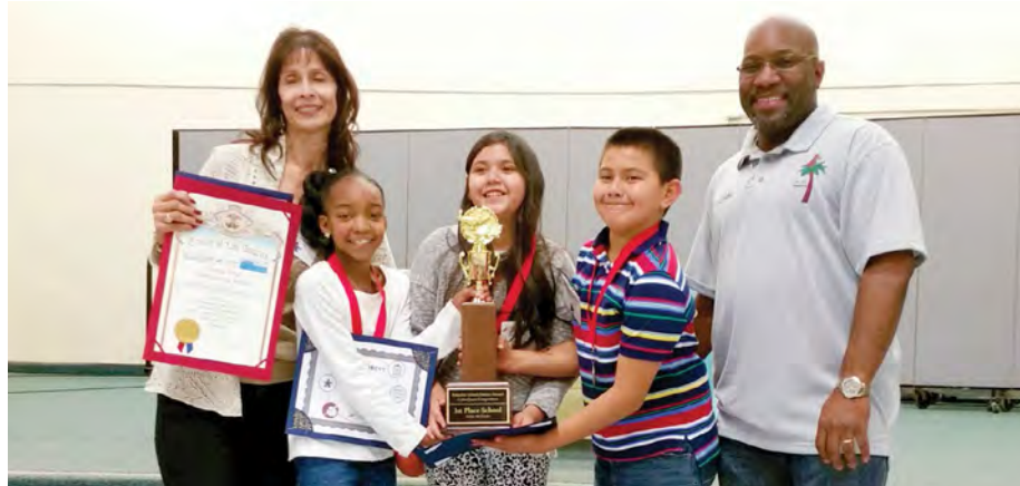
2 teams from Palm Tree.