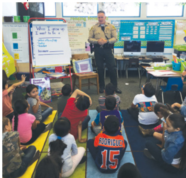
A law enforcement officer shares his career information with these curious first graders.

On April 12, Edmondson Elementary School students learned about many different careers during our eventful Career Day. Students were beaming with excitement viewed many different city vehicles, including a fire truck, a tractor, an ambulance, a city bus, a sheriff's vehicle and motorcycle, a highway patrol vehicle, and much more. They were able to talk to the important men and women who operate these vehicles and ask lots of questions.