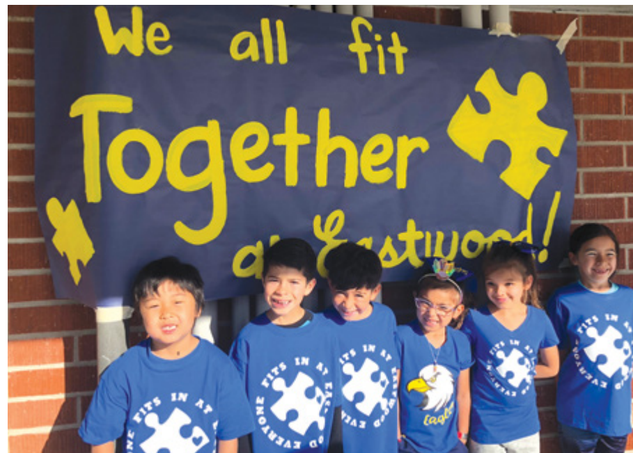
We Care Wednesday event dedicated to Autism Awareness Month