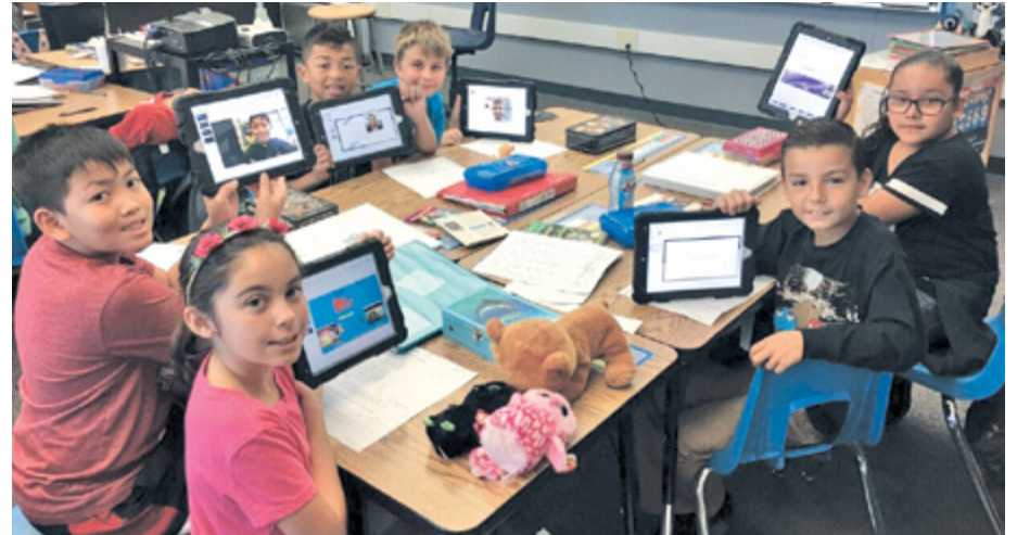
4th graders with their devices at Escalona Elementary School in La Mirada.