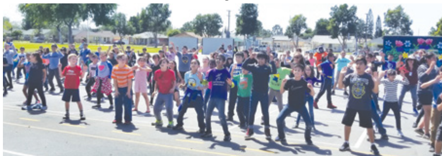
Johnston Students doing Zumba at their "Jump for Heart" event.

Johnston continues to demonstrate greatness in all we do!