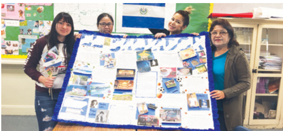
"Students show projects created for International Day."

Each year, this event brings students closer together as they learn that they have more in common with one another than they have differences.