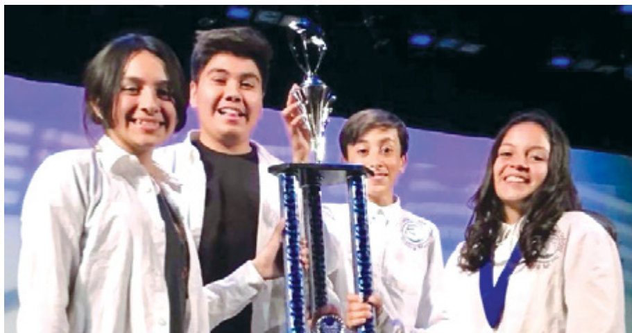
Best Overall Middle School Band Award

Middle School Band Overall and the Esprit de Corps Award, which is for best sportsmanship, for all groups in the competition. This was the third year in a row that our music groups won the Esprit de Corp award!