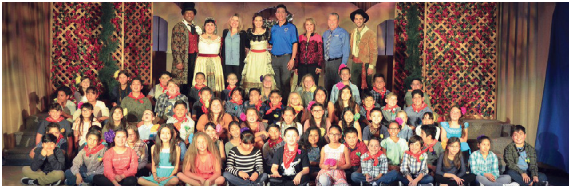
Dolphins perform the Marriage of Figuroa alongside LA Opera at Dulles.

The arts are part of a well-rounded education at Dulles. LA Opera is our partner who helps to integrate the arts into our existing educational endeavors.