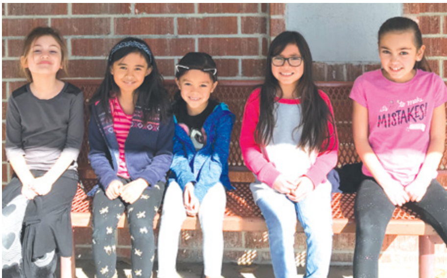
Spreading kindness by showing appreciation for our friendships!