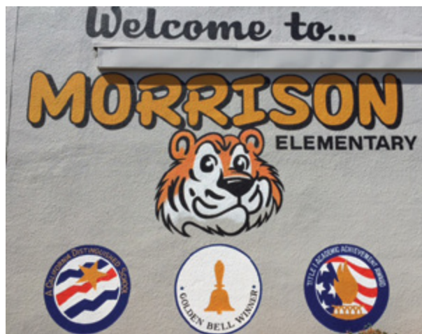
Julia B. Morrison Elementary School is proud of each award received.

We have had a great year at Morrison, and we look forward to the 2018–2019 school year. Go Morrison Tigers!