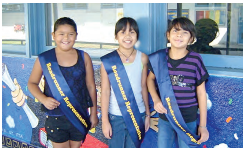
Roadrunner Representatives greet parents and students every morning.

Our school wide commitment towards our Caring Pillar is to Be Kind. At Johnston, we build character one pillar at a time. One way we demonstrate our school wide kindness is in the mornings before school starts. Our Roadrunner Representatives greet students and parents as they walk on to campus. Our Roadrunner Representatives are 5th grade students that are part of our Kids Care Club. Every year, 5th grade students are eager to join this wonderful club. This year, we are hoping to do more community projects that demonstrate our kindness even more. Stop by and visit our beautiful campus where you can see first hand how our Johnston Scholars demonstrate excellence and kindness!