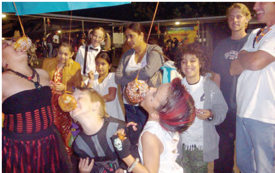
Fun at the Fall Festival!

Our first community fund-raiser is our annual Fall Festival on October 19. Volunteers come together to create a fun-filled evening of games, activities, and food for our local area. Come join the fun!