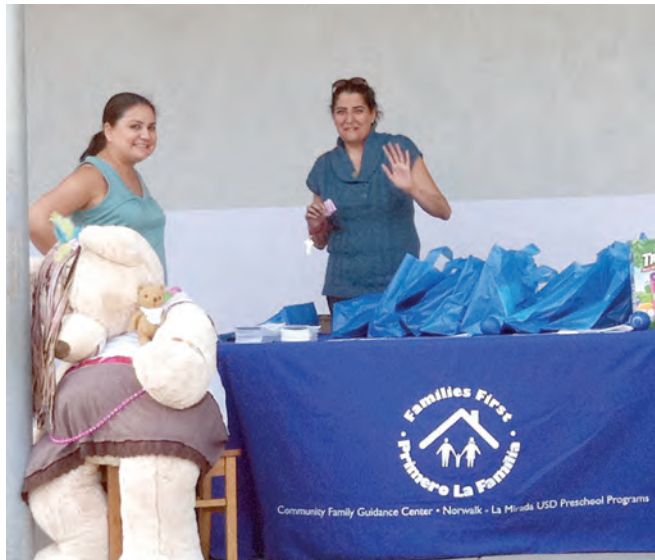
Staff from Families First attended the Preschool Family Fun Night in May 2012.

We are excited to announce a partnership with Cerritos Family Guidance Center, which is called Families First. This partnership is providing mental health services to children and families. We are thankful for the initiative from this agency to create a strong connection with community resources, and to be able to serve all families enrolled in our program.