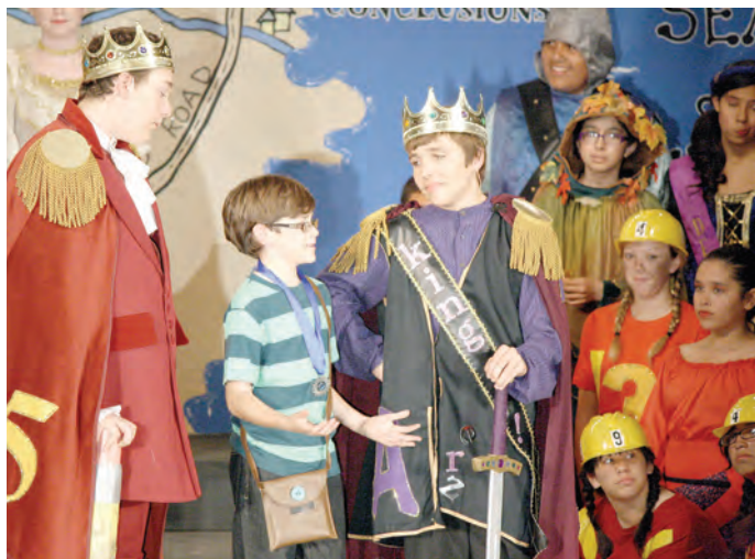
The Benton Middle School cast of "The Phantom Tollbooth"

theater arts, orchestra, guitar, band, world percussion, steel pans, choir, piano, dance, creative writing, photography, media arts, video production, technology, AVID and more! Benton Middle Magnet School is poised to become a premier academy of visual and performing arts.