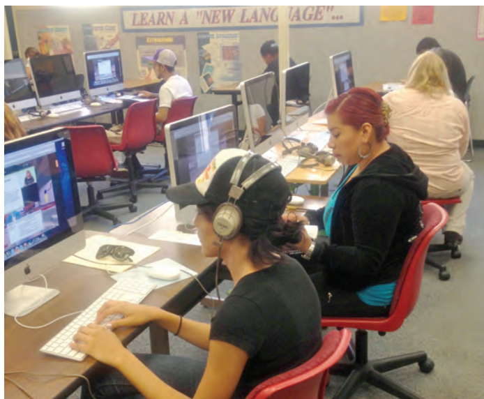
Student access high school diploma courses online.

computer in this way at first, but it does not take long for them to feel comfortable with the process and become engaged in the topic of study. If you have thought about taking that important step towards a diploma, the flexibility of online learning may be exactly what you need!