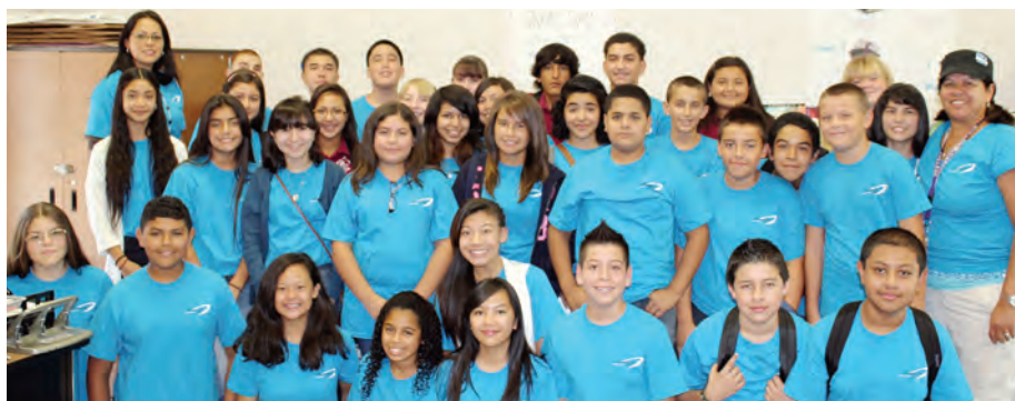
Seventh & eighth grade WEB Leaders/Mentors and Advisors.

The modernization process started this summer. Work began on the infrastructure of the school, including updating electrical, irrigation, water, sewer, fire and safety systems. During the next phase, work will focus on completely updating classrooms, restrooms and other facilities. Interim classrooms are in place for students while the buildings are being modernized. In the meantime, there will be some noise and dust, but the end result is more than worth the inconvenience. Be sure to check the school website for updated information.