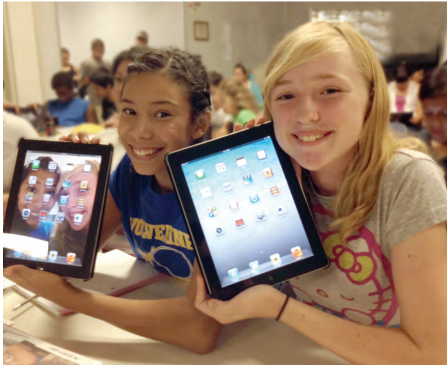
Benton Middle School students can't wait to show what they can do with their iPads!

Three hundred and twenty middle school students across Norwalk and La Mirada schools will be participating in a one-to-one iPad program this year. This pilot program is one of several initiatives being rolled out this fall by NLMUSD to better prepare students for academic success, upcoming California Common Core Standards test requirements, and