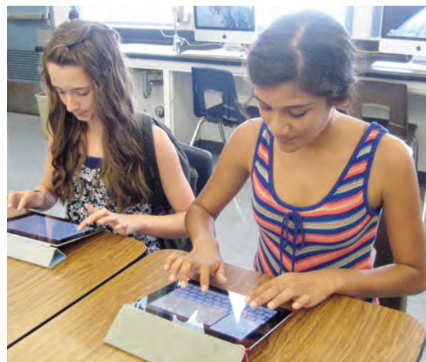
Hutchinson students utilize iPad for learning!

The staff of Hutchinson Middle School is excited to partner with students, parents and the community for the 2012–13 school year. Our 1 to 1 iPad Honors Academy is off and running, providing students with a rigorous pre-AP learning environment. Students utilize their iPads for research, project development, digital textbooks, word processing, student responders and formative assessments. Our Math, Science and Technology magnet introduces students to units in environmental science, structural engineering and principles of engineering, and robotics. Our Visual and Performing Arts (VAPA) program includes our award-winning