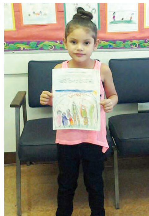
Good character is fostered at Dolland Elementary!

Here at Dolland, we want to celebrate strong academic success and ensure that our students also develop strong principles and values.