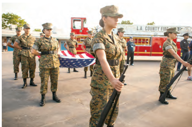
Southeast Academy Cadets honor the lives lost on September 11, 2001.

We are proud of the educational experiences we offer and look forward to an exciting and outstanding school year.