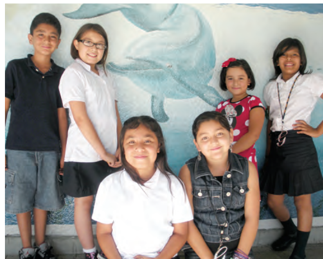
Lampton welcomes new friends and families!