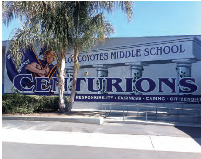
The new LCMS mural

On the first day of school, the PTSA also unveiled the new Centurian mural on the wall of our Multi-Purpose Room (the MPR). The Character Counts! pillars on the mural serve as the foundation for our interactions with students, parents, staff members and the