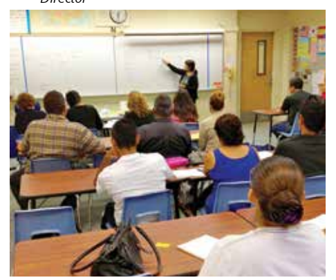
Adult students focus on learning critical skills.

This summer, the Norwalk-La Mirada Adult School will offer a nineweek session of courses to build those critical educational and employment skills. The summer session will run on Monday through Thursday mornings and evenings from June 23 through Aug. 21. We welcome you to join thousands of other adult students who will make progress on important goals this summer!