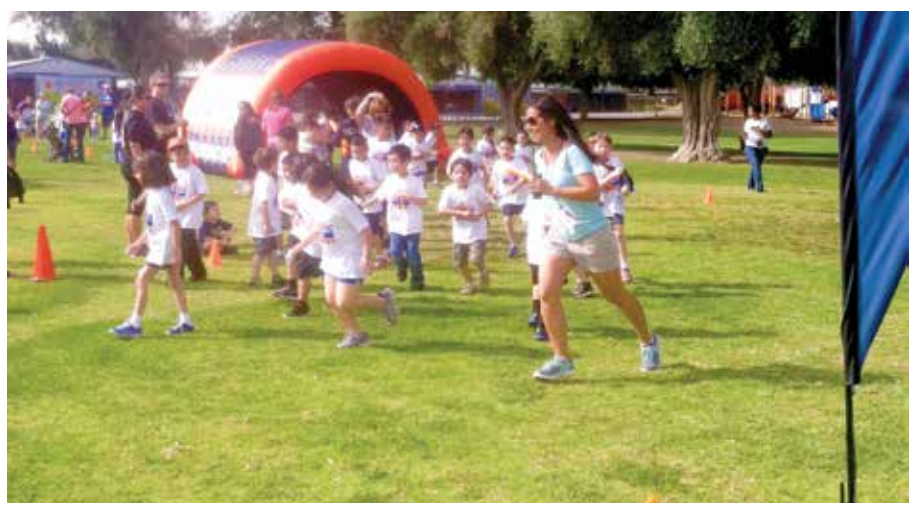
Gardenhill's annual PTA jog-a-thon.

What makes Gardenhill Students so great? They work hard on their academics with an API of 915, and they work hard serving our community and world. Gardenhill students just finished up our annual PTA jog-a-thon. Students and families worked hard to raise money for our school! Students also recently raised $2,588 for the Leukemia & Lymphoma Society participating in "Pennies for Pasta." Additionally, we are proud of our partnership with By Grace Orphanage in Kenya. Students and families have donated "Love Packs" and have raised over $4,000.00 for the orphanage. We are developing such amazing students and are proud of their great character and their hard work with the new Common Core