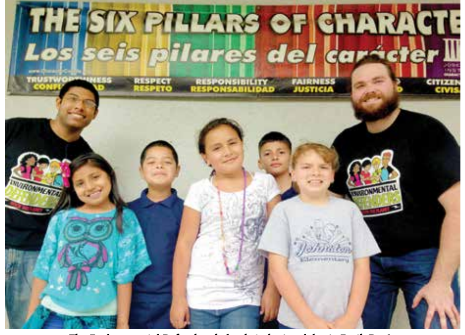
The Environmental Defenders helped students celebrate Earth Day!