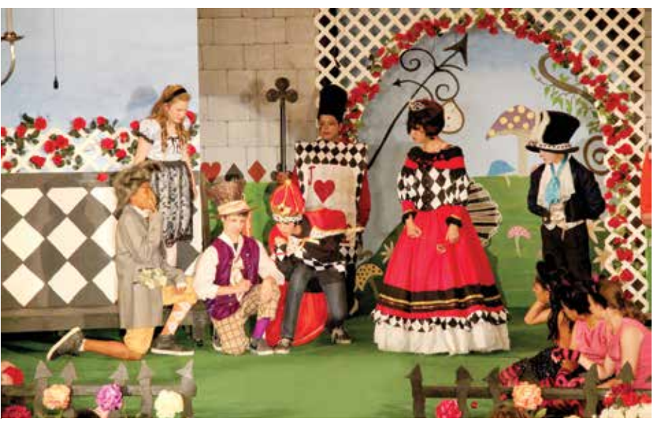
Benton students shine on stage in Disney's Alice in Wonderland, Jr.

Above all, we are proud of the hands-on learning opportunities that students shared throughout this production. Students gained exposure in every facet of theater production. From acting to prop and program design to set decoration to sound and lighting, students learned priceless skills that they are able to take with them to high school and beyond.