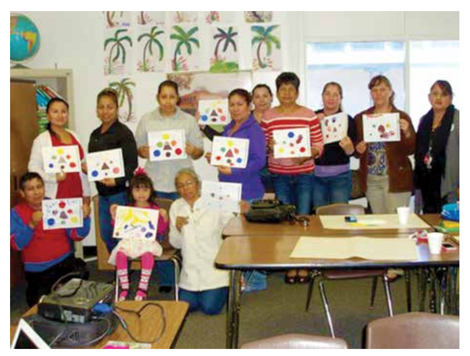
Waite parents using art as an expression of life.

The more parent and community activities, the more students learning improves. Learning-focused involvement activities may include: Family nights on math or literacy., Family-teacher conferences that involve students, and Family workshops on planning for college.