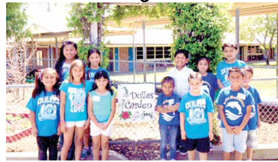
Dulles students are proud to be a California Distinguished School!

The California Department of Education recently named Escalona Elementary and Dulles Elementary California Distinguished Schools! This prestigious award recognizes those exemplary schools from throughout the state that possess exceptional instructional programs and outstanding student achievement. Approximately five percent of California's public schools are selected for this recognition each year.