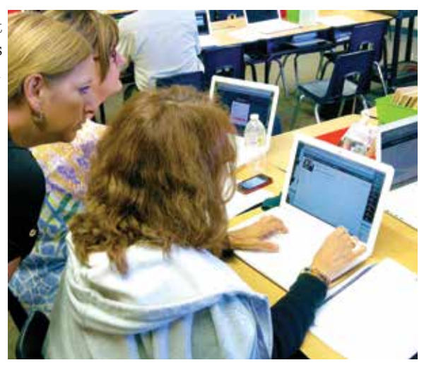
Edmondson teachers logging onto Schoology to access info regarding SBAC."

I am proud of our teaching staff because they have been eagerly anticipating this new era. They are spending quality time to help our students do their best on this new test.