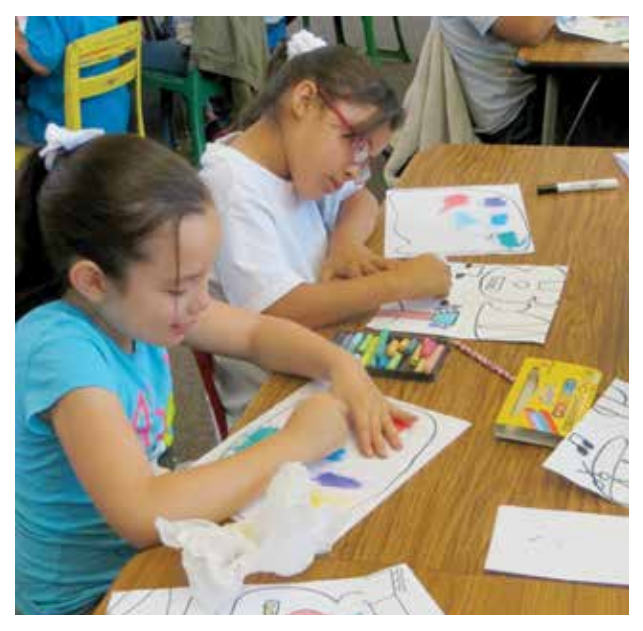
Morrison students participate in the Meet the Masters art program.

Once the children have a true connection to the artist it is then time to introduce the techniques that made this art revolutionary.