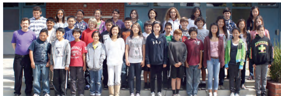
Los Coyotes sixth grade Academic Pentathlon Team.

The Centurian Honors Magnet is also expanding next year due to an increased number of students who are interested in performing at a higher academic level. Congratulations goes to those Honors Magnet eighth-grade students who were recruited by the Matador Scholar Academy for participation in the academy next year.