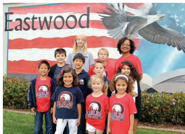
Eastwood Eagles: 2012 California Distinguished School

We are very proud of this award, which recognizes our efforts to close the academic achievement gap and our strong commitment to two complementary signature practices: a balanced approach to reading instruction and a systematic English Language Development (ELD) program. These two practices are designed to increase listening, speaking, and reading skills through high-level questioning and active student engagement.