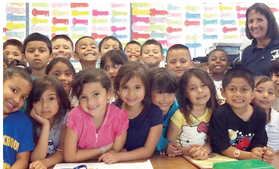
The keys that students earn when they pass a comprehension test

Our Gladiators have been immersed in a rich reading environment that promotes a love for reading and inquiry. Aside from providing an effective, balanced reading program and implementing reading strategies to develop a strong reading foundation for our students, our teachers are incorporating technology to increase their motivation. Technology-based programs are being utilized to assist with our quest to improve comprehension as well as increase student engagement within our classrooms. Since the implementation of the Accelerated Reader (AR) "app" on the iPad in a 1st grade classroom, the number of students who are taking and passing their AR comprehension tests has gone from 35 AR tests per month to over 100 AR tests per month... that's incredible! Glazier is definitely moving our students forward as they become independent readers and writers. Go Gladiators!