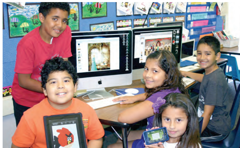
Morrison Tigers take learning to new levels!

All Morrison teachers have designed and published Web pages on weebly.com. These class websites outline and showcase their class events and creative student projects. The technological experiences we provide our students with at Morrison will help ensure that they are well equipped to compete in the 21st century.