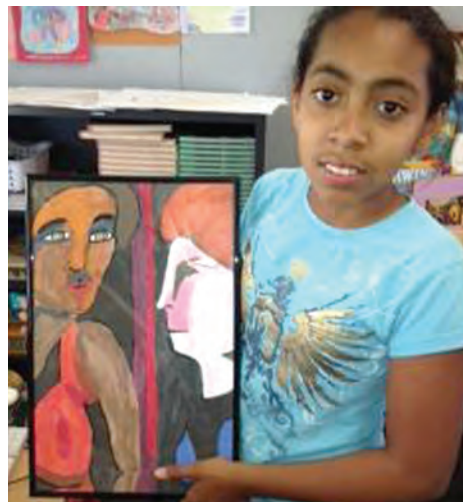
Fifth grade learns about representation

This approach means that our students will be well-prepared for middle school, as well as become good citizens who can appreciate and enjoy the deeper forms of beauty.