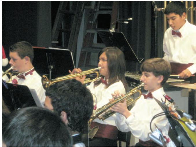
Hutchinson band has a winning sound!

Our seventh- and eighth-grade Academic Pentathlon teams brought back 36 individual medals and four team awards in their competition in April.