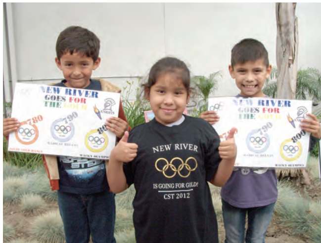
New River Going for Gold on the CST!

to explain the test's significance. Children created Specific, Measurable, Achievable, Relevant, Timely or SMART goals for language arts and math. These were shared with their teachers and parents. Parent meetings were held to explain how parents could support their children during testing.