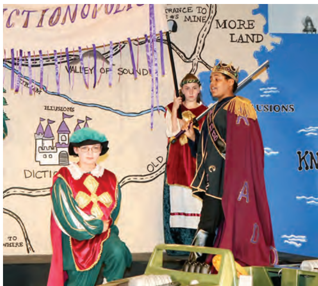
Benton's VAPA Visits "The Phantom Tollbooth!"

door instrumental music festival to be held on June 14. In addition to our fine performances this year, we are pleased to announce our first-ever publication featuring the writings of our students, a sampling of student studio art creations, and prints from our award-winning photography students. At Benton VAPA Magnet, students ended an incredible year with a crescendo!