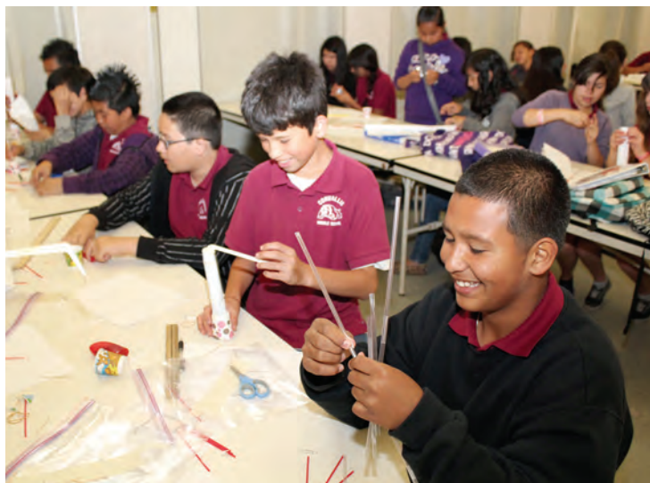
Corvallis GATE students are up for the challenge!

and build a device to accomplish this task in the least amount of time, which included setting up their device. It was a very exciting day, filled with critical thinking, problem solving, and fun!