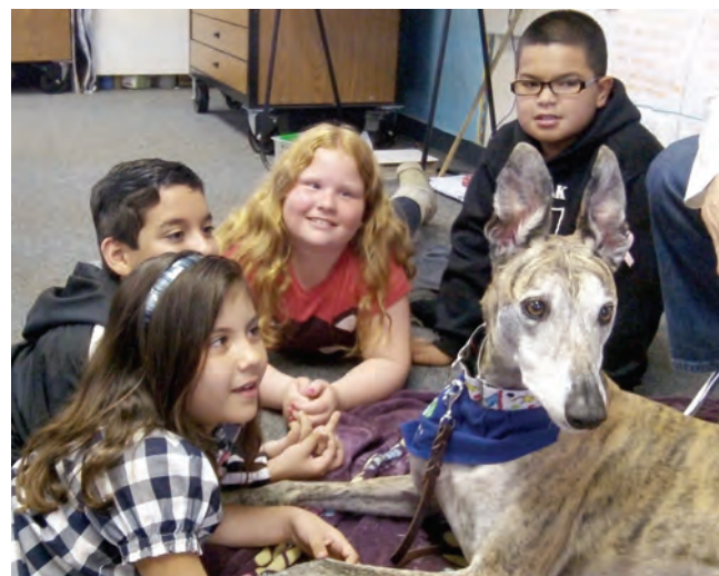
Geronimo the Greyhound made a visit to Lampton!

students tried out healthy recipes in class as part of the Harvest of the Month. Our fast friend, Geronimo the greyhound, a BARK therapy dog, also made weekly visits as his owner read to students and provided them with new books.