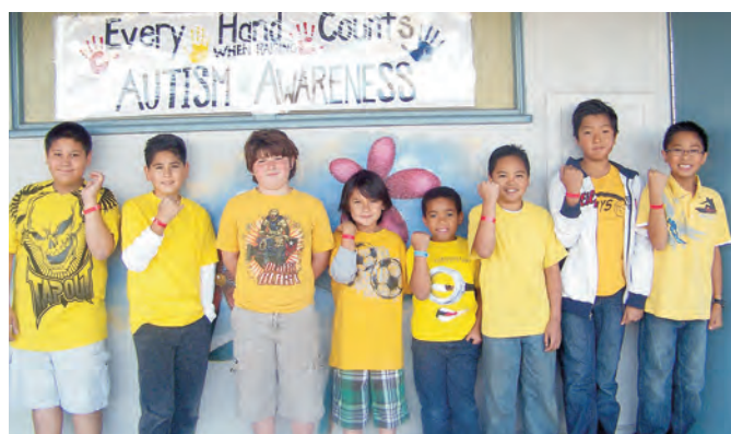
Every hand counts!