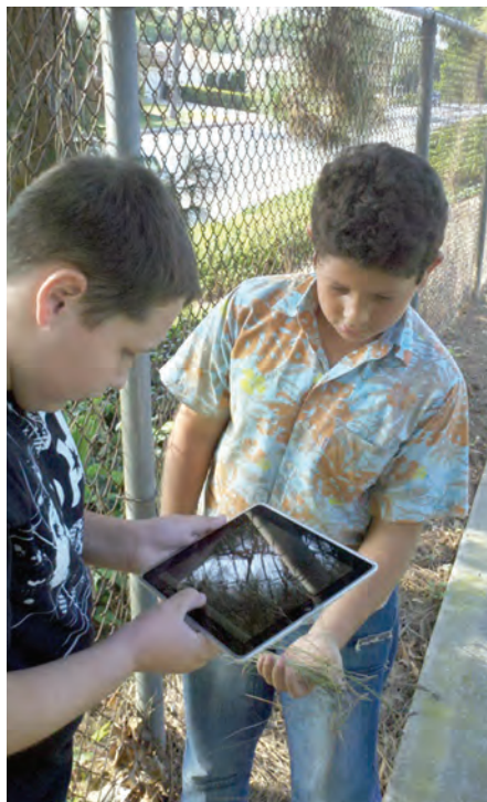
La Pluma students integrate technology into their learning

Our vision focus of integrating technology has also allowed for 14 iPads to be added into our fourth- and fifth-grade classrooms. In addition, we have five classrooms participating in our Modeled Integration of Technology Program. Those classrooms, equipped with iPads and additional desktops, assist students in connecting their learning to real-world application. Together, we have worked to provide a learning environment that not only acts as a complement to the whole-child but is also “Building Brighter Futures” for our students. We invite you to visit us in person or online at our website.