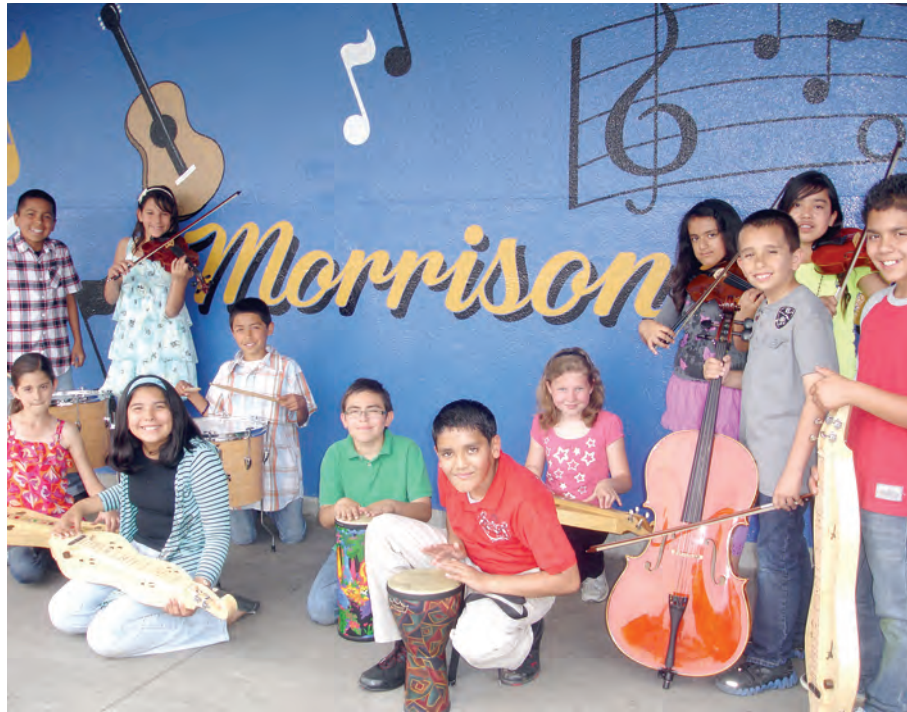
Morrison Tigers creating the sweet sounds of success!

Morrison Elementary School is proud to have again been awarded the title of California Distinguished School and, for the fourth year in a row, our school has earned the Title 1 Academic Achievement Award. Our Academic Performance Index (API) has grown steadily over the past several years, reaching 856. After three years of implementing English-Language Development (ELD) and Academic Language Development (ALD) systematically at Morrison, our school has closed the achievement gap, as demonstrated by the API comparison of sub-groups, between our English-Language Learners (ELLs) and our native English-speaking population of students. In fact, ELLs experienced the most API growth, at 60 points,