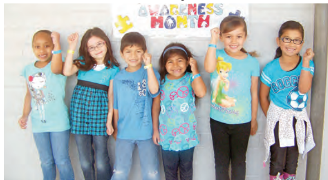
Raising awareness for Autism

Escalona Eagles are aware, and they care!