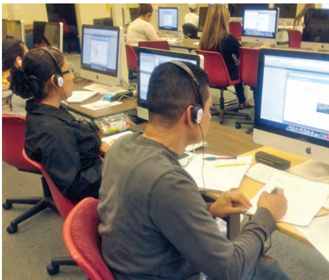
Adults students access various diploma courses online.

Students at the Norwalk-La Mirada Adult School are facing their fears and reaping rewards as they navigate through the APEX online curriculum on their way to earning their high school diplomas. Many of our adult students were uncomfortable with computers at first, but with successful use, they are now hooked on the technology and the immediate feedback offered through this online program. Teachers and administrators love it too, because the curriculum is more rigorous and consistent than the work that was previously done in the Individualized Learning Center (ILC).