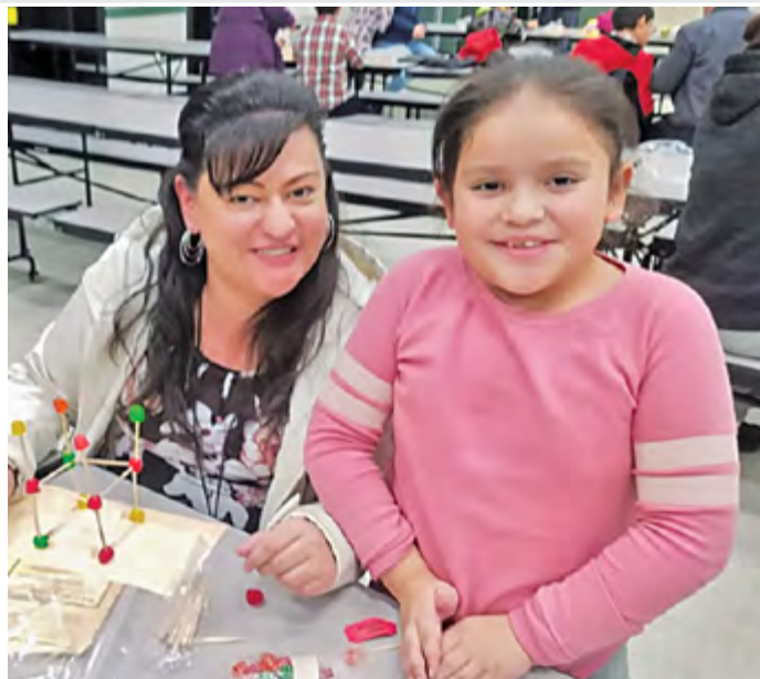
Family Engagement Activities

We are excited to start the year and make a positive difference in the lives of our students!