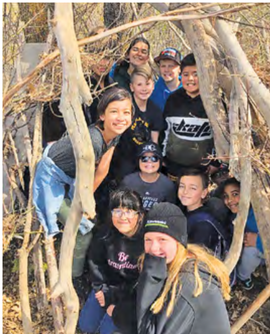
Peachland GATE Field Trip

¡Esperamos un excelente año escolar 2019-20!