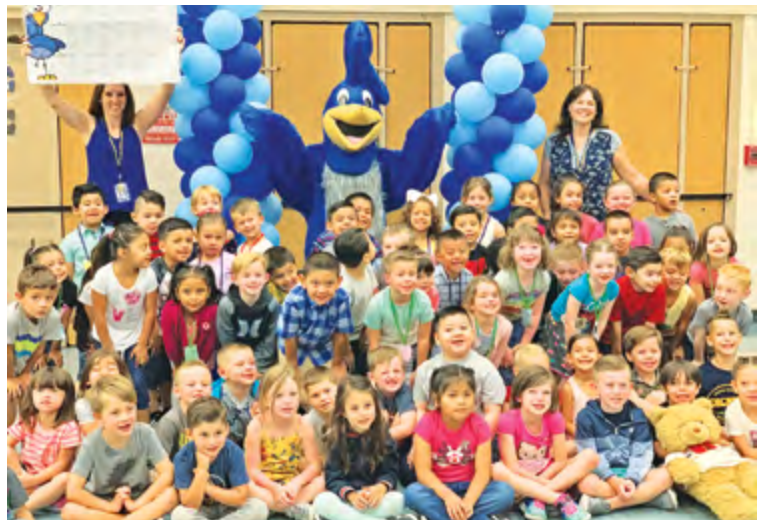
Miles the Roadrunner

Together, our Peachland Roadrunners are going the extra mile to ensure that we are helping all students grow and develop into well-rounded citizens ready to set the world aglow with their positive energy and love of learning!