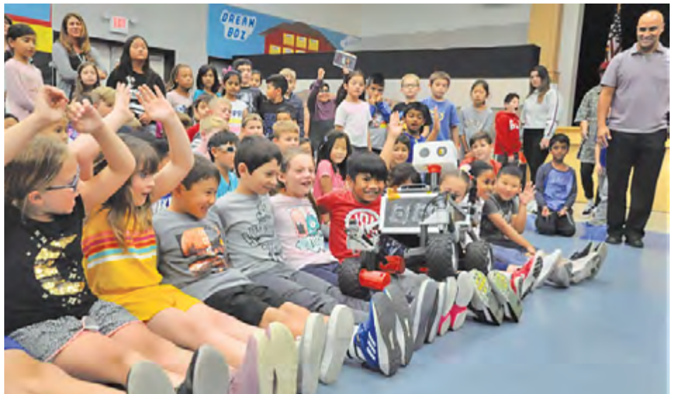
Mars Rover Assembly

With the help of our parent-led Science Booster program, and the Oak Hills Foundation, we will also continue our partnership with NASA’s Jet Propulsion Laboratory (JPL), which provides us with both field trips and guest speakers.