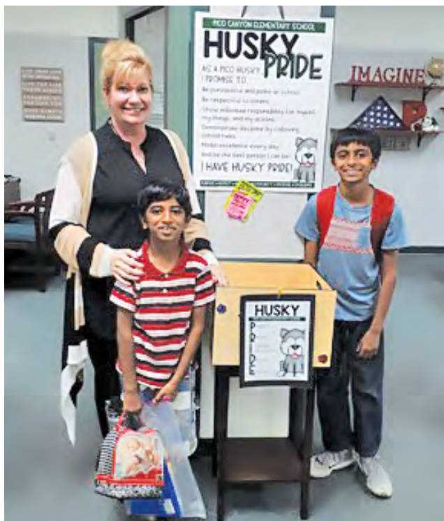
Husky PRIDE Recognition

Academic optimism and the belief that all students can learn and grow is felt in every classroom and is discussed in every grade-level collaborative meeting, staff meeting, PTA meeting, and Instructional Leadership team meeting. All adults work to create a student-centered community from the moment a child steps onto our campus.