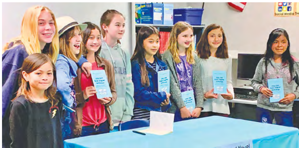
Student Authors at Wiley Canyon

This year, more students have expressed an interest in joining the writing and book club. We are very excited to read the next collection of stories written by our students!