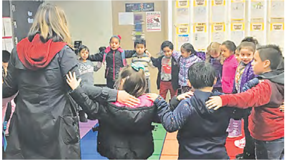
Arts Integration in Action

Inspired by the Kennedy Center’s Arts Integration Conference last June, teacher established a site collaborative and a school-wide theme—The Art of Possibility—which was created to support arts integration implementation. Newhall Elementary teachers are excited about sharing strategies and collaborating to teach both art forms and curriculum to engage students in learning.