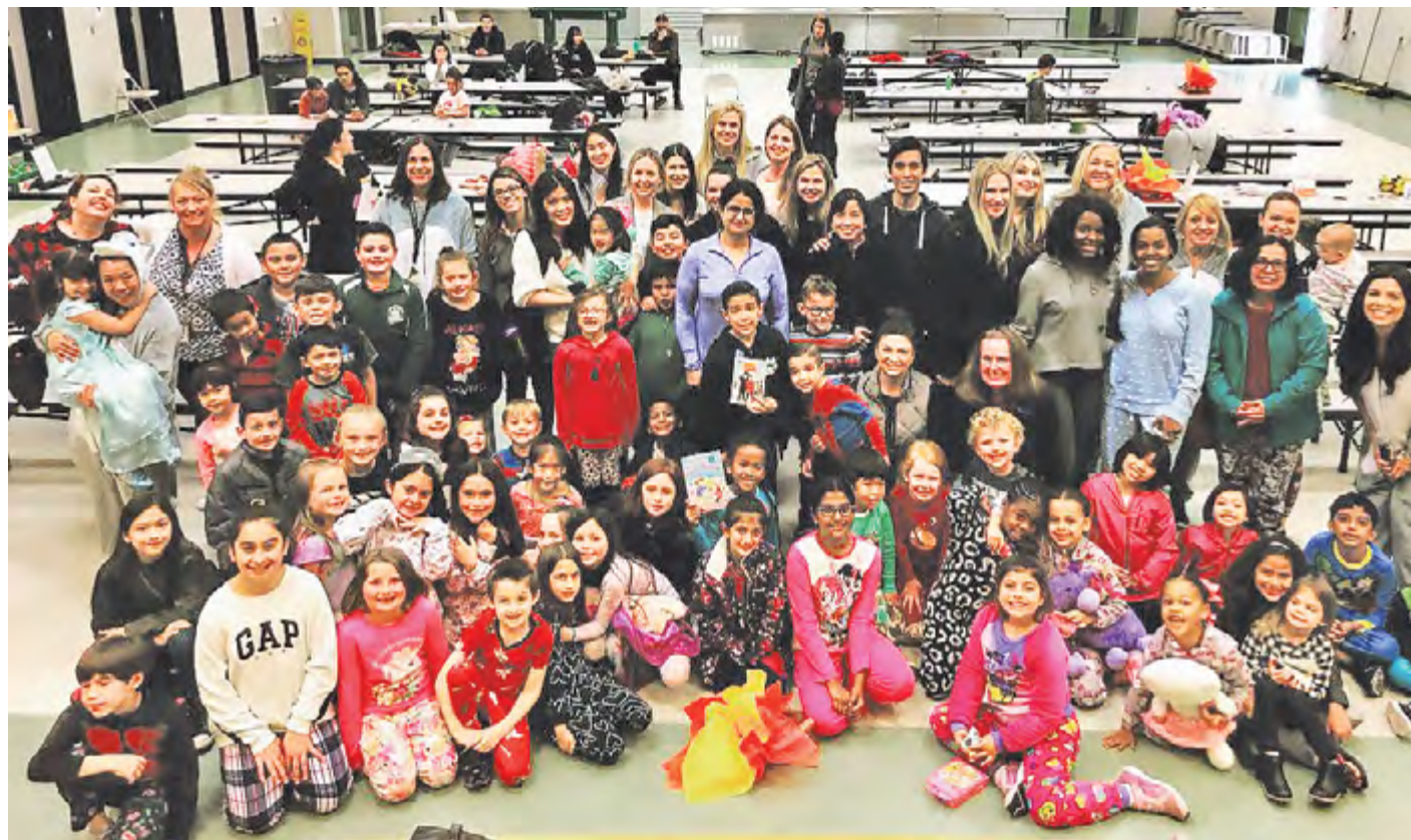
Pico Canyon Literacy Night

Volume 1, Issue 1 September / October 2019