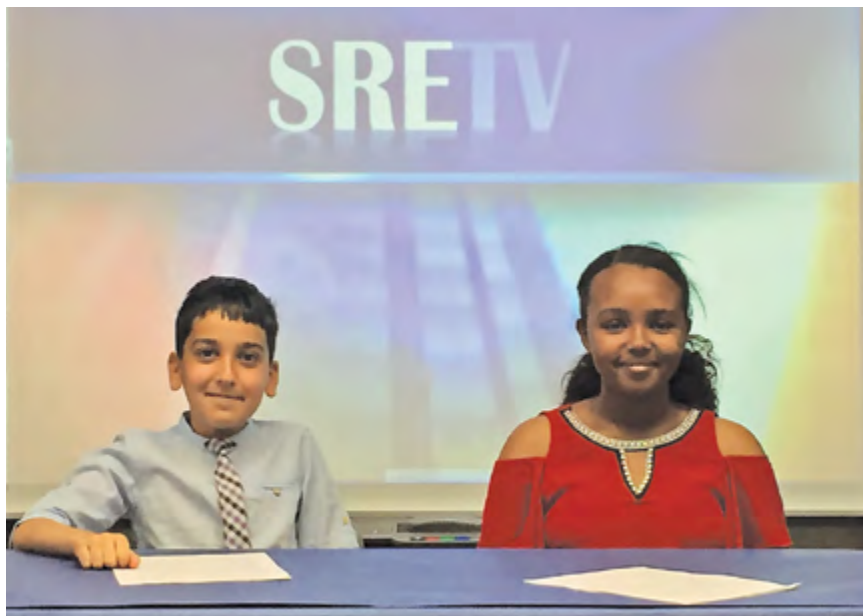
Stevenson Ranch Elementary Student TV

The goal of the Innovations program is to encourage every student's journey in becoming an innovator by inspiring ingenuity, exploring different perspectives, and creating original works. Sixth-graders, for example, become newscasters by writing, producing, and editing video news reports tied to their social studies and science standards. Third-grade animators create Claymations to explain life cycles. Students in the first grade attend space camp as they become astronauts.