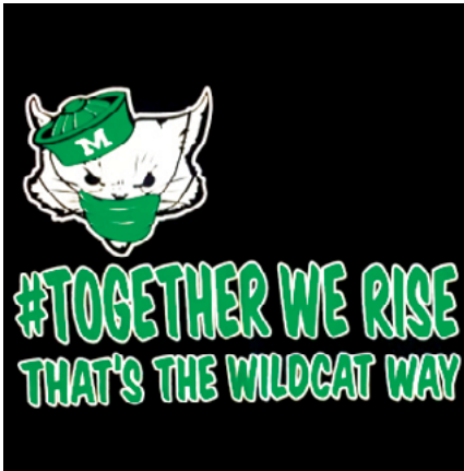
The Wildcat Way for 2020/21

Welcome back to school, Wildcats! The 2020–21 school year is poised to be one for the history books as we begin building relationships and focus on learning on a full virtual platform. Although the way we are hosting school is different this year, with students and teachers connecting with one another on a Zoom call, the why of school remains consistent. The entire Wildcat Staff is committed to providing caring, supportive and engaging learning environments for our students, starting now in a distance-learning environment but with the goal of getting back together on campus when it's safe to do so.