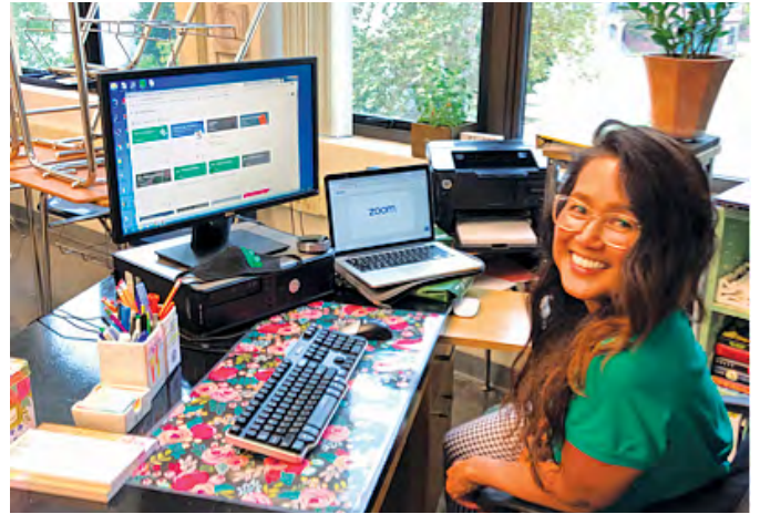
Teachers teaching remotel

Please visit the MUSD Distance Learning Platform at monroviashools.net for more information and strategies for support. Here, you will also find an overview of the Monrovia High School distance-learning plan, with answers to many of the frequently asked questions.