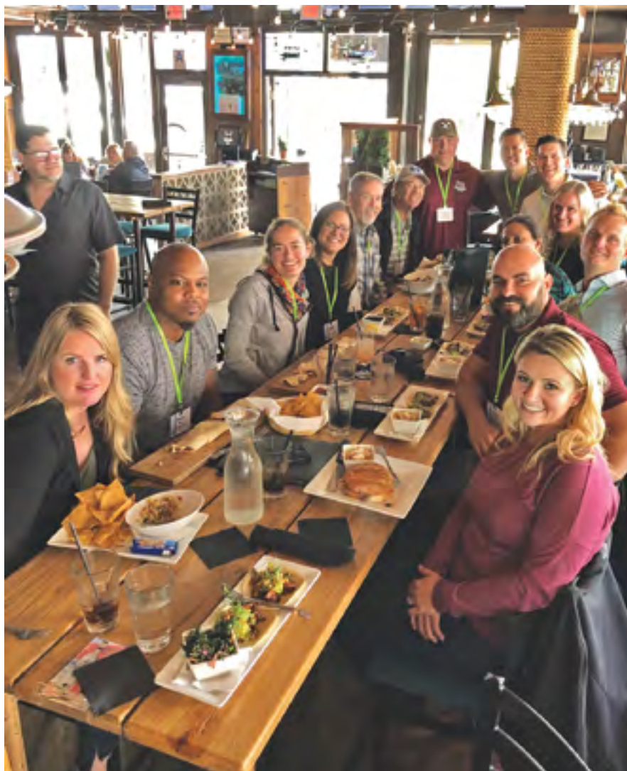
Canyon Oaks HS staff at a conference in San Diego

This PLC conference allowed our staff to strategically embed shared leadership practices and student achievement into our Mountain Lion Pride's culture and curriculum.