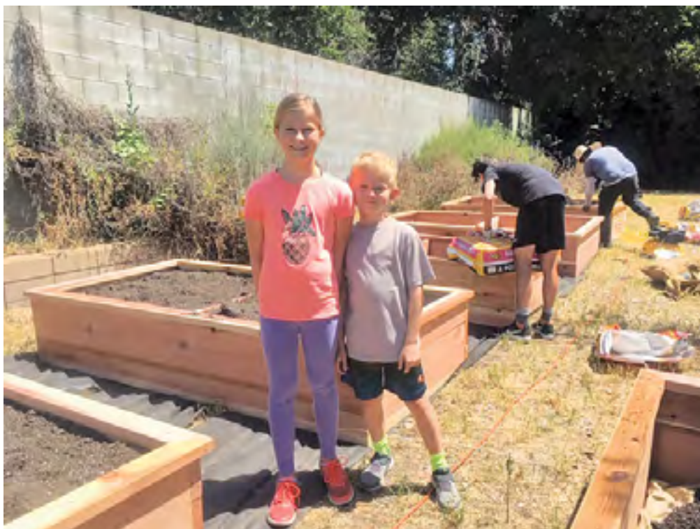
Two students build a garden with the support of Enrich LA

Along with the structure and foundation of the garden, the garden organization will provide a "garden ranger," who will teach interactive and interdisciplinary lessons and help to care for the garden.