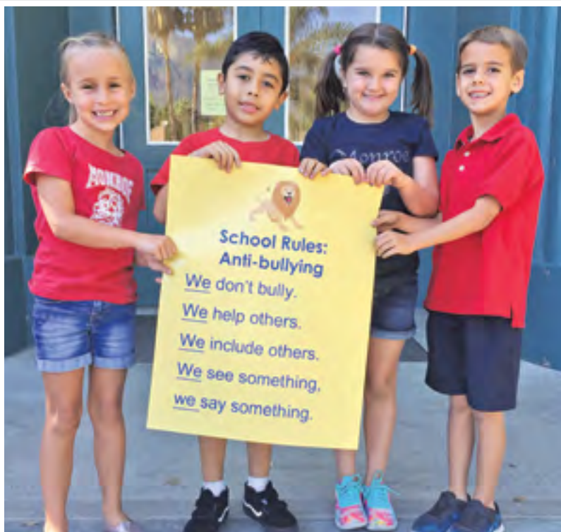
Students holding up a sign with anti-bullying rules.

One of the goals of this program is to empower students to become “up-standers” who stand-up against verbal, physical bullying and cyberbullying. As a means of reaching this goal, their teachers will facilitate regular class meetings intended to build a strong and positive bully-free school culture. Monroe has committed to and will continue to build on our successes by deepening our character-development program and positive-behavior initiatives. Parents can support their children by supporting our rules and encouraging their children to be buddies and not bullies.