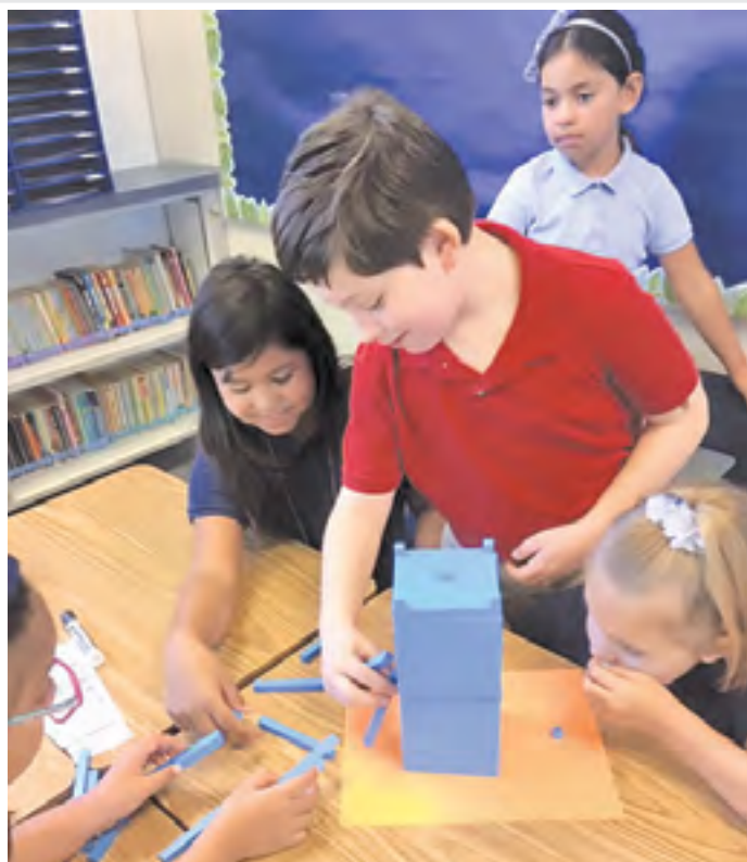
Students learning to build a house on a budget.

Witnessing our students laugh and share ideas while working together is inspirational. Bobcats, we are off to a great start!