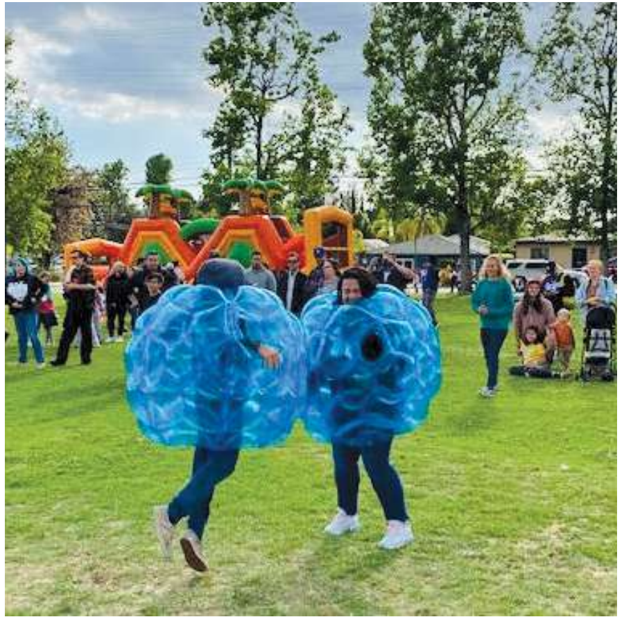
Monroe's School Carnival was held on Friday, April 22, 2022.

At Monroe Elementary School we pride ourselves in providing our students with a positive school environment along with a rigorous differentiated instructional focus. We believe in a growth mindset and in the power of yet. The word YET reminds us that everything is achievable. We would not be able to serve our students without the support from our dedicated PTA organization. They have hosted various school assemblies from the Music Center, like Futa Toro West African Dance Ensemble and Ballet Folclorico do Brasil. Our PTA also organized an amazing Student Talent Show where we definitely talked about Bruno! At the end of April, they brought our entire school community together with a School Carnival. We enjoyed student entertainment, ate delicious food and fundraised through a silent auction and carnival games. We are so thankful for their tireless dedication and for believing in us. We're the mighty lions, hip, hip, HOORAY!