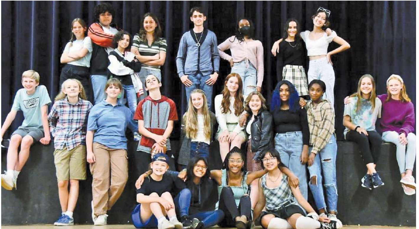
Clifton Middle School partnered with Centre Stage, Inc. in the production of 13, The Musical. Cast and crew members consisted of students from Clifton and Santa Fe.