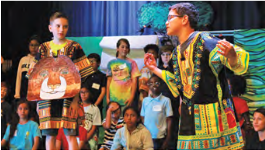
Students participating in Wild Rose SOCA's Production of "Lion King Kids"