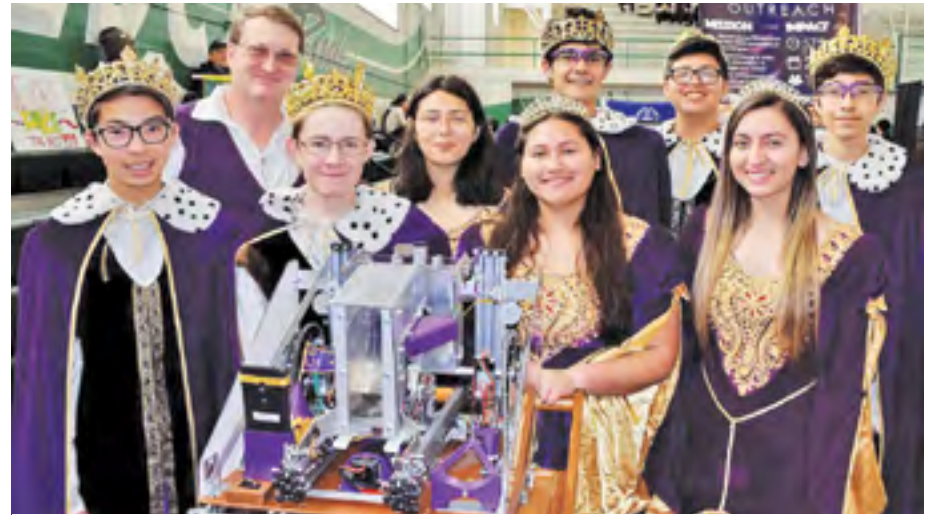
Monrovia High School's Kings and Queens and Clifton Middle School's Hippy Bots at the FIRST Tech Challenge World Championships in Houston, Texas.