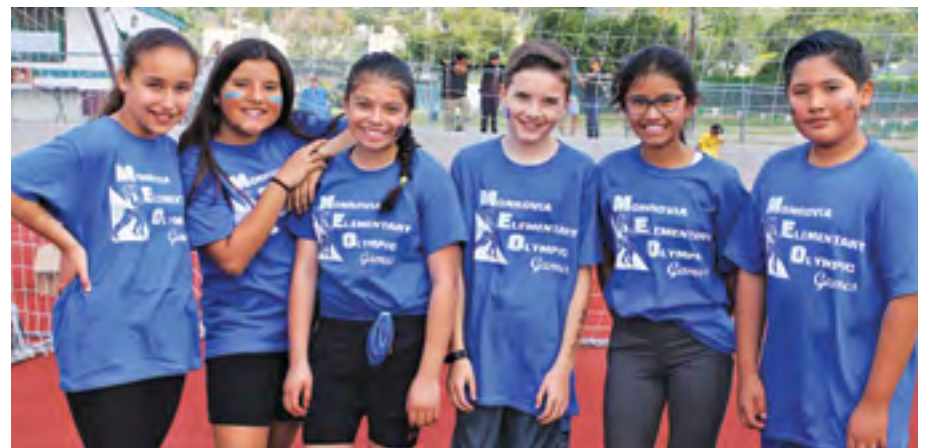
Monrovia Elementary Olympics (MEO) Participants

We are excited about all the wonderful things we accomplished across the district this year and look forward to welcoming back our students on Aug. 14.