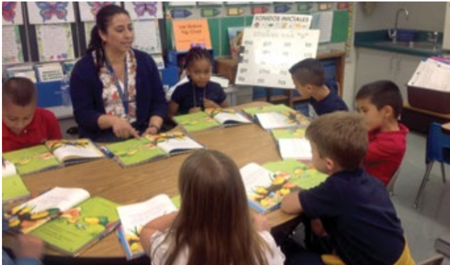
First grade readers at Monroe

The instructional focus at Monroe Elementary School is reading comprehension. We believe that academic success requires strong proficiency in reading. To that end, Monroe teachers collaborate to ensure that all students fluently read, understand, analyze, and respond to grade-level text in Spanish and English. Student success is monitored and measured frequently by performance on district, site, and state assessments. Students in kindergarten through fifth grade are demonstrating steady improvement on these assessments.