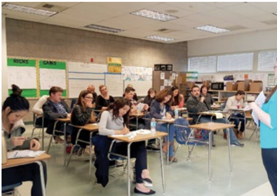
MUSD staff members are lifelong learners.

In support of this important work, each of our schools has been participating in monthly Professional Learning Community (PLC) meetings to explore and establish a common leadership framework. In this edition of School News Roll Call ,