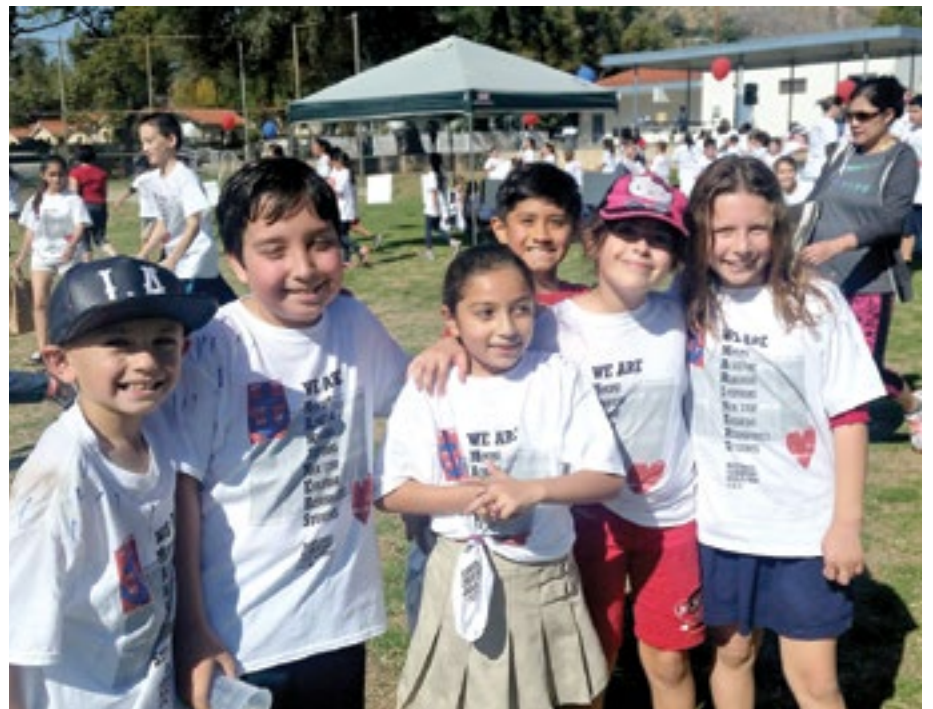
Kids having fun at annual walkathon!

In March, we hosted a beautiful open house for all of our families. Here we showcased the amazing work that the students demonstrate in our classrooms every day. In addition, our student leadership teams also led the school in a fun-filled College and Career Week. Each day included several activities and demonstrations that focused on college and career awareness.