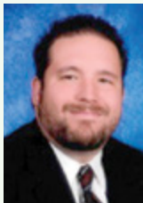
George Buchanan President

Les deseamos lo mejor a todos nuestros estudiantes y familias a medida que avanzamos hacia el final de otro año escolar. Esperamos volver en agosto para otro año exitoso de enseñanza y aprendizaje.