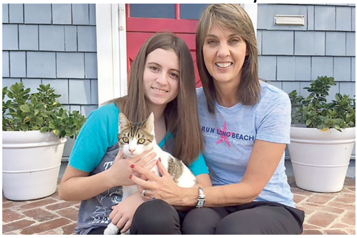
Please see Long Beach City Auditor page 7.