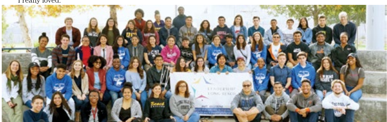
Youth LLB Class with YLLB alumni

www.leadershiplb.org or www.facebook.com/leadershiplongbeach 743 Atlantic Ave., Long Beach, CA 90813 562/997-9194